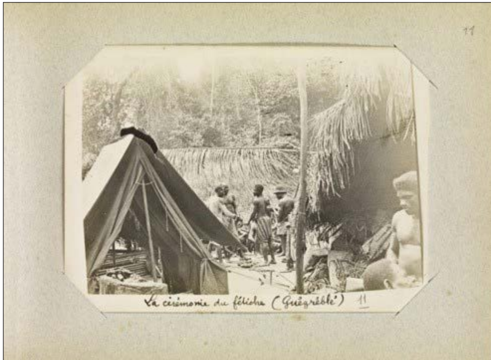
Figure 5. Georges Thomann (1872–1943), “La cérémonie du fétiche (Guézréblé)”

their recirculation as photogravures is part of a recurring pattern of the time that consisted in unveiling supposedly exotic and mysterious religious ceremonies. Far from being specific to Africa, this was a generalized phenomenon. One example here is the two photographs taken by George Wharton James that show, in two stages, the reaction of the members of Governor Eusebio's team in Acoma (New Mexico); tired of years of dealing with intrusive photographers drawn to the region in the hope of photographing ceremonies such as the snake dance, they refused to be photographed (Barthe 2019, 26–27).