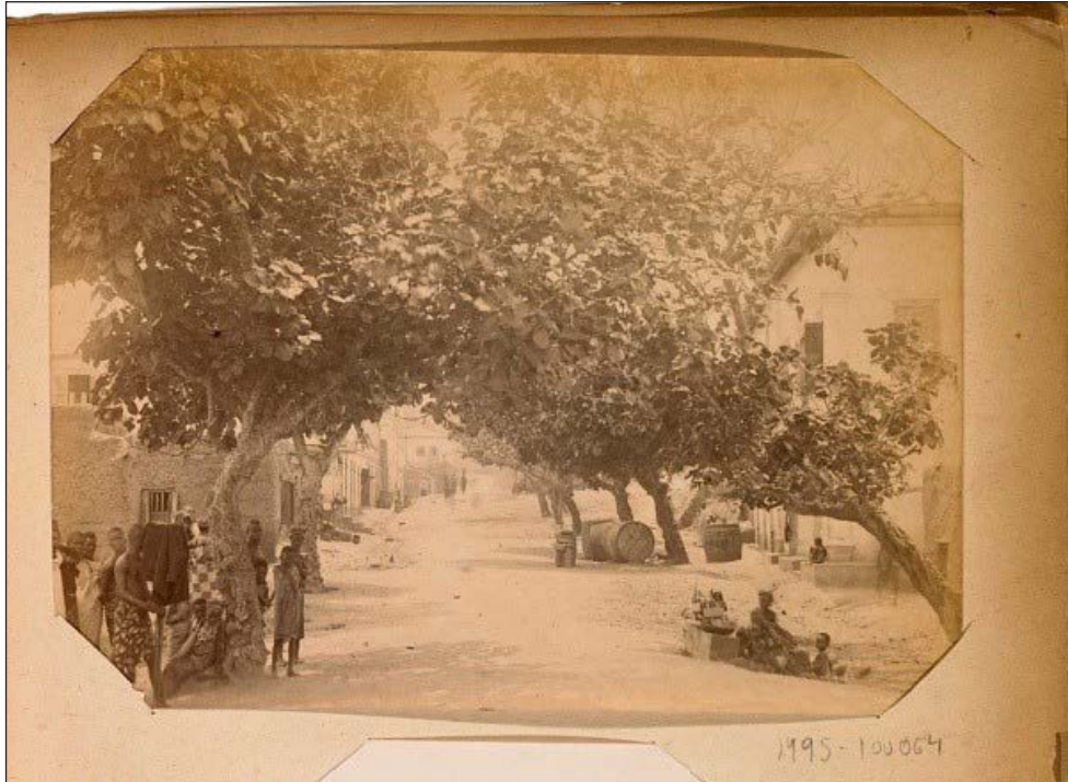
Figure 2. Anonymous, “Ashanti Rd. C.C.”

Silver print included in an album, 13.5 x 19.5 cm, approx. 1910. In Ghana Photographs (1889–1910*) .