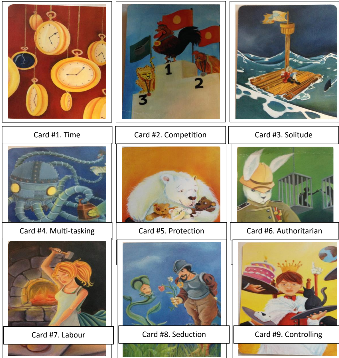
Figure 1 – Projective Cards

These coloured cards are printed with illustrations (no text) that depict impossible situations. An interviewee interprets each card and is thus led to more subjective answers. Several projective techniques are used in psychology (Guelfand, 2013). The one we used consisted of presenting the interviewee with ambiguous pictorial stimuli (Chabert and Anzieu, 2004). “The images are also keys for entering into what is real; they translate what we feel and enable us to talk about