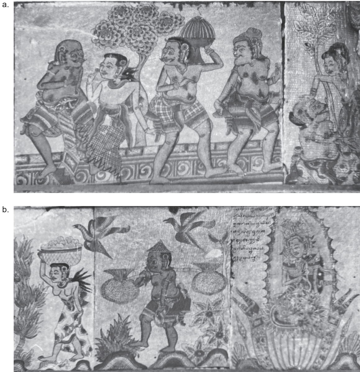
Figure 1a and 1b: Two panels from the ceiling of the Kṛta Ghoṣa depicting the prosperity (panel a) that is presaged by the occurrence of an earthquake in the second month, due to the yogic practice of the goddess Gaṅgā (panel b).

the event that are augured by an earthquake in that month. The ceiling of the Kṛta Ghoṣa pavilion in Klungkung, painted in the mid-twentieth century by the artist Pan Seken and his assistants, contains a palinḍon illustration with text corresponding to each month (Figure 1). For example, an earthquake in the second month is associated with the goddess Gaṅgā: