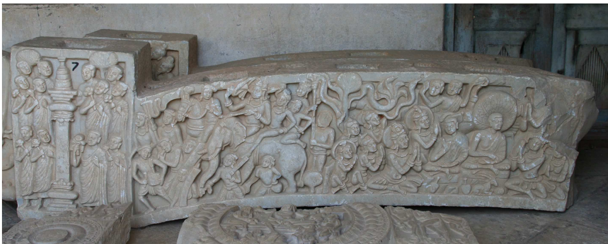
Figure 6. General view of the inner side of the toraṇa beam fragment no. 7, Phanigiri.