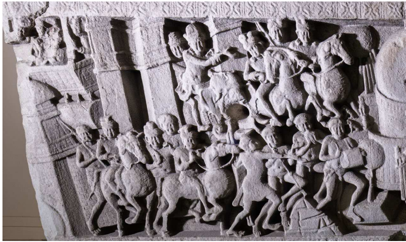
Figure 3. Detail of the Amaravati coping stone, left register.