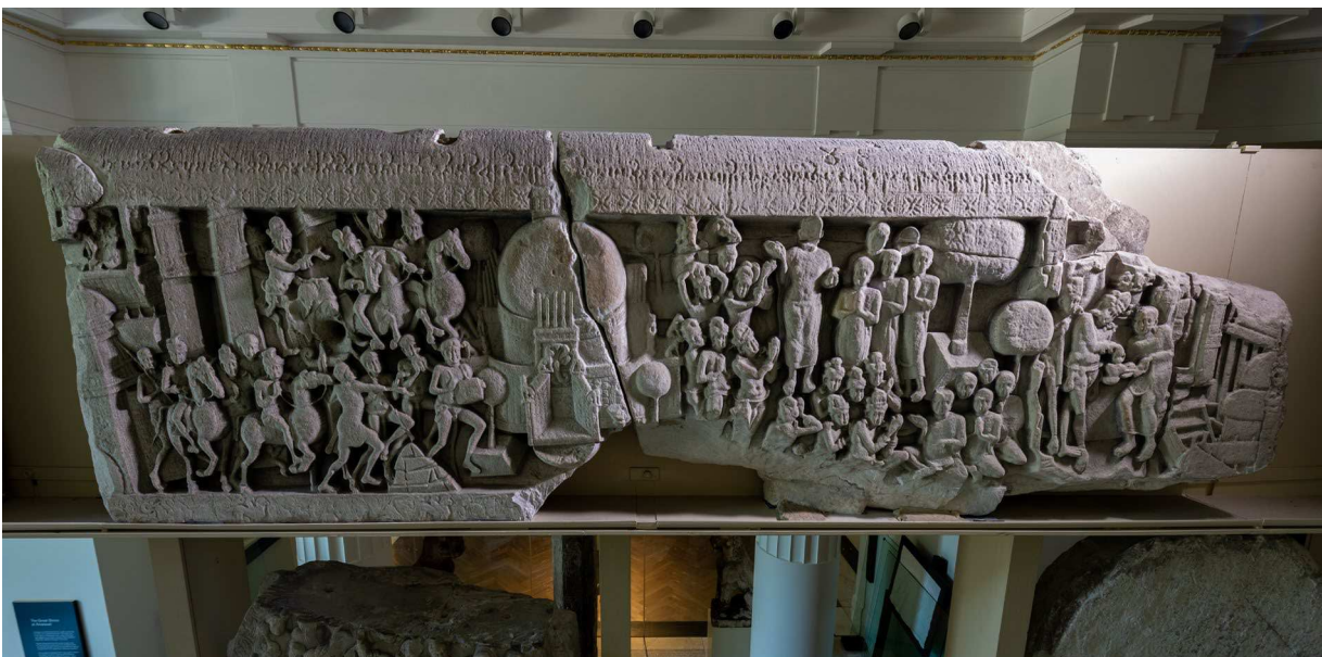
Figure 2. General view of the inner face of a coping stone (bearing EIAD 468), vedikā of the Amaravati stūpa, British Museum.