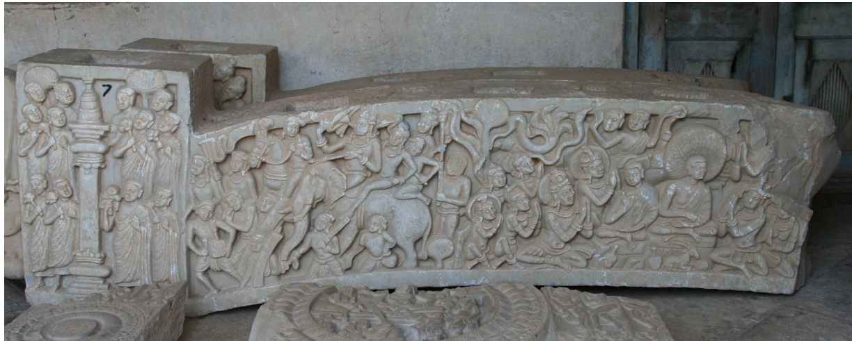
Figure 6. General view of the inner side of the toraṇa beam fragment no. 7, Phanigiri.