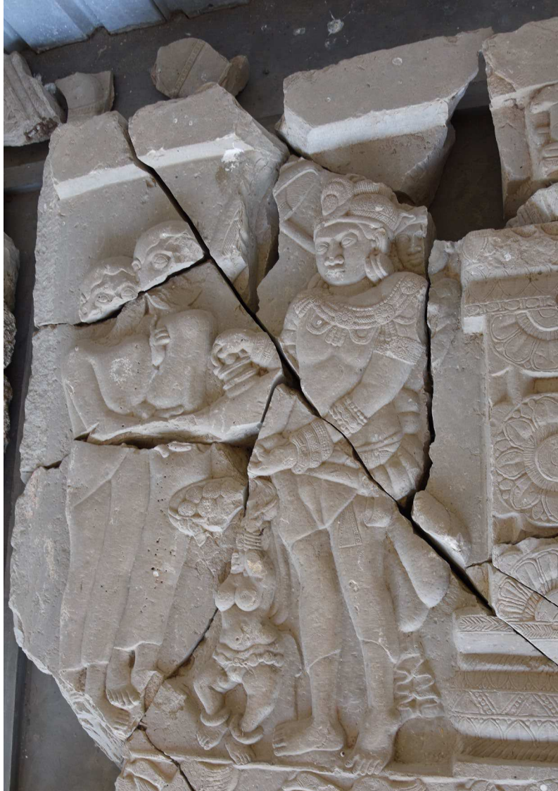
Figure 1. Upper register of an encasing slab, with relief showing King Sātakaṇṇi donating silver flowers to the Great Shrine, Kanaganahalli stūpa site.