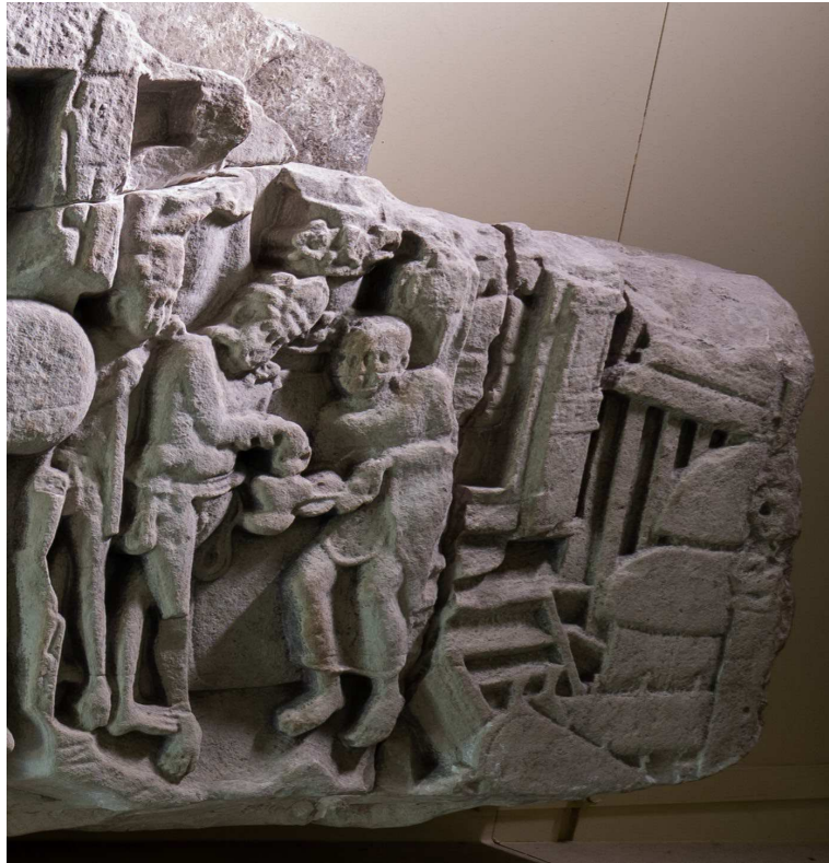
Figure 5. Detail of the Amaravati coping stone, right register.