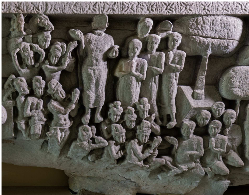
Figure 4. Detail of the Amaravati coping stone, center-right register.