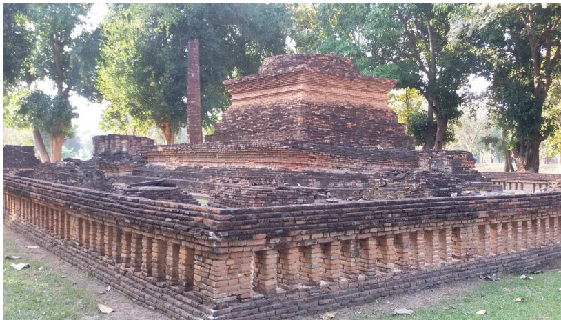
Figures 4 & 5. Stupas and foundation of the brick hall of Prey Svay monastery.