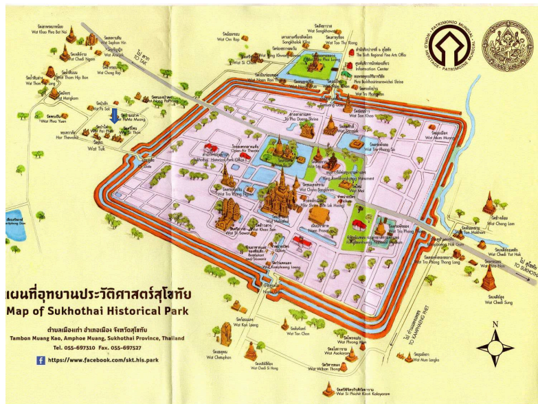
Figure 3. Plan of Sukhothai Historical Park showing the vihāra of Prey Svay situated outside the west gate.