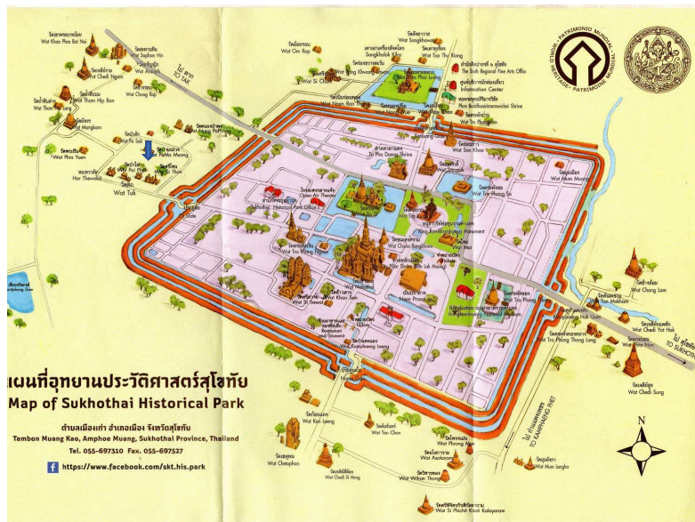
Figure 3. Plan of Sukhothai Historical Park showing the vihāra of Prey Svay situated outside the west gate.