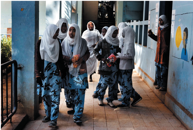
Figure 28: Sudanese girls in school uniform in 2007. 15

under the inqādh regime is perceptible in both schoolbooks and pupils' clothing. Throughout their education, students attending public schools were required to wear uniforms that mimicked military camouflage (see figures 28 and 29). 14 This meant that two central institutions of the modern state – the army and the school system – were ideologically and visually connected in the Sudanese public space, no matter how much the pupils themselves actually identified with the military. A university teacher born in 1974 told the author that in the 1990s war songs were not only sung in class, but were also a constant presence on children's radio and television programmes (Mahā 2021). Until 2005, the regime used to broadcast a weekly thirty-minute programme entitled Fī sāḥāt al-fidā' ("In the Fields of Sacrifice"), which used footage of battles between government armed forces and the Sudan People's Liberation Army (SPLA) to promote jihad against Southern "infidels" and celebrate fallen "martyrs" (Fluehr-Lobban 2012: 83). Although the programme was taken off the air when the CPA was signed, Sudan Television briefly resumed broadcasting it in 2011, as conflict erupted in the Blue Nile and South Kordofan areas (El Gizouli 2011).