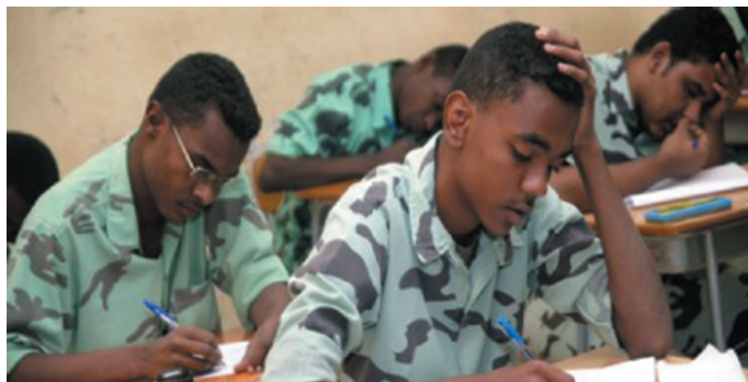
Figure 29: Sudanese boys in school uniform in 2015. 16