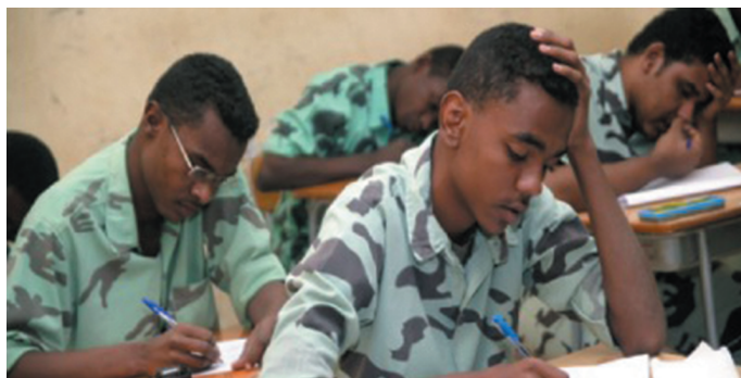
Figure 29: Sudanese boys in school uniform in 2015. 16