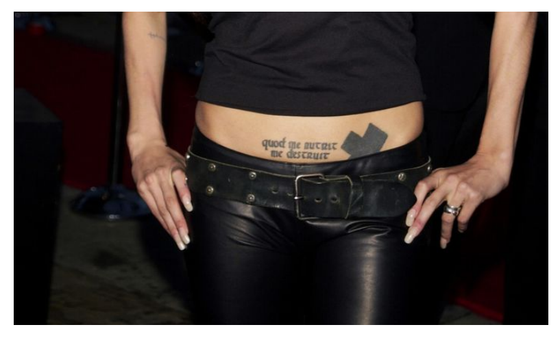
Figure 1: Tattoo of Angelina Jolie, showing the inscription "Quod me nutrit me destruit."