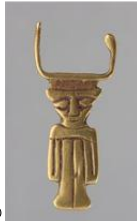
Image 4 , The goddess Hathor welcomes SETI I (1294 to 1279 BC; Paris, Musée du Louvre; https://www.photo.rmn.fr ); Image 5 , Emblem of the goddess Hathor (Paris, Musée du Louvre; https://www.photo.rmn.fr ), N.B, it is not clear whether she has a snake or horns on her head.

- It travelled thousands of years and miles to appear among the Minoans (see the statuettes from Knossos; Evans, 1906).