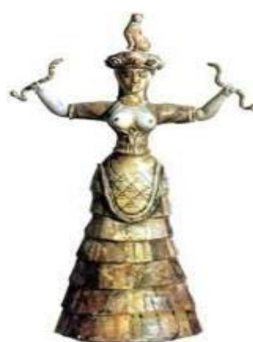
Images 6 and 7 , Statuettes from Knossos dated around 1600 BC.

These last two images associated with the snake can help us to understand the evolution of this concept, which is apparently migrating northwards through time and space.