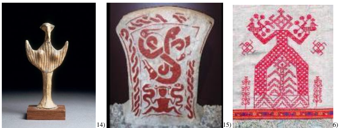
Images illustrating the evolution of the concept of the Great Mother Goddess during the last 3,500 years over a vast territory from south to north and from west to east: 14) Figurine 13, head with bird's profile from the Late Helladic III period (1400-1200 BC, Paris, Musée du Louvre;) 15) Tombstone, 400-600 CE (, open woman with a crown of horns, holding two snakes); 16) Slavonic embroidery practiced to this day (photo from

At the dawn of the Neolithic (Mesolithic), Palaeolithic beliefs linked to the cult of the Mother Goddess, still visible in Turkey (Göbekli Tepe) and Libya (Messak), began to change. This change spread beyond the Fertile Crescent, prompting populations wishing to preserve their ancient beliefs to migrate northwards (images 6 to 10). A new social order (patriarchy) was established. Under this order, the land lost its sacred character and became an object of covetousness, provoking wars and violence. Some of the population continued to resist, taking refuge on islands (photo 14). Others (like our mummies) fell victim to this brutal change in civilization. When the Bronze Age collapsed, there were no longer any followers of the ancient beliefs on the shores of the Mediterranean: funeral rites (position of the deceased, objects accompanying him/her, etc.) changed. We assume that the worshipers of the Great Goddess survived in spite of everything, moving towards the north-east (see images 9 and 10), but this hypothesis will be the subject of further study. In this next article, we will also look at the myths relating the killing of the serpent or dragon in various popular legends which, in our view, illustrate the transition from feminine to masculine monotheism. Here's an overview in pictures: