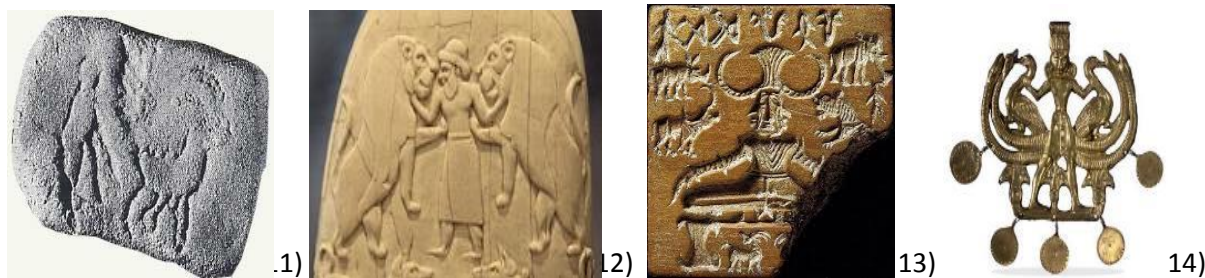
Image 11, One of the Tărtăria tablets with a scene of the domestication of a horned beast depicting a humanoid form with two long arms (Museum of Transylvanian History, Cluj-Napoca, before 5000 BC, public domain); Image 12, Fragment of the ivory handle of a knife (Egypt, Naqada II, 3,300-3,200 BC, Louvre,); Image 13, Seal from the Indus Valley (2000-1800 BC, Mohenjo-Daro,); Image 14, Minoan pendant "Mistress of the Animals" (accompanied by 4 snakes and two birds) found on the Greek island -Aegina (British Museum, 1700-1500 BC,).

While images 1 to 10 show that the snake symbol is more specifically feminine (although horns do appear and become confused with snakes in later periods), this series focuses on man , who presents himself as 'master of the animals' (except image 14). We can therefore see that the concept of 'master of the animals' in the 'masculine' appears in the Neolithic, reflecting the process of domestication of wild animals and the establishment of a new societal order, even if certain territories (mainly located on islands) still resist (see also image N°14).