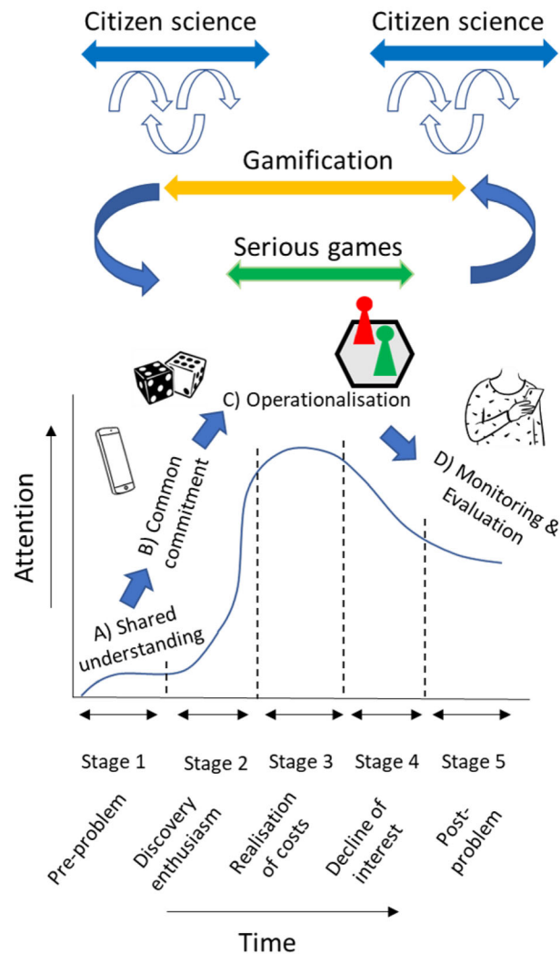
Figure 3: Conceptualization of a multi-method approach of citizen science, serious gaming and gamification efforts within transdisciplinary research in natural resource management contexts, matching the desired level of engagement and (long term) commitment along the issue-attention cycle (adaptation of [10]). In the early (stage 1 and 2) and later stages (stage 4 and 5) citizen science can be gamified to gain and maintain attention and interest of citizen scientists. The collected information in stage 1 and 2 can input for the development of serious games (stage 3 and 4), while the output of the game sessions can be used to lead the data collection for monitoring in stage 4 and 5.

the game sessions, can in turn be used again to set out potential new measures for monitoring of disturbance and threat by the tigers.