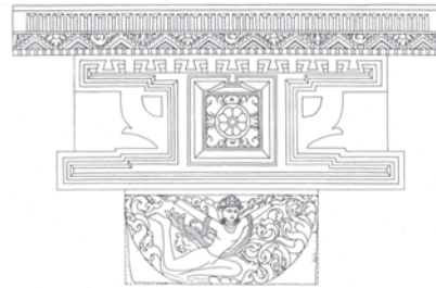
Blind window from south wing courtyard facade. Drawing Bijay Basukala, 2002