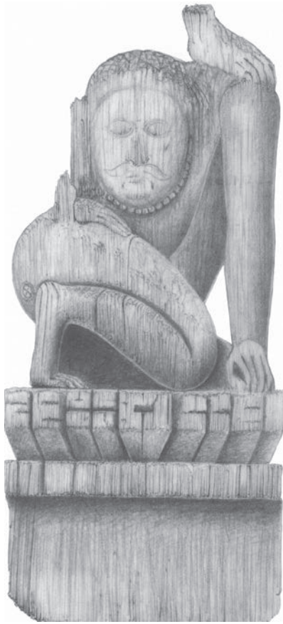
Drawing of one of the Itum Bāhāh strut's mutilated yakṣa . Drawing Bijay Basukala

Though it is hazardous to pronounce whether an iconographic ensemble is complete or not, a group of carvings may reflect the community's choices in matters of ritual texts and symbolism, as the following lines will seek. The great difficulty resides in the fact that most of the items are often un-contemporaneous and their origins may be doubtful.