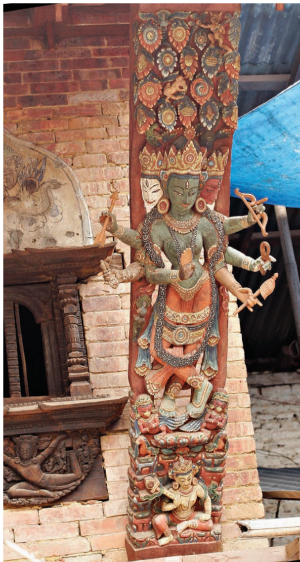
Existing struts of Itumbāhāh North Wing courtyard facade after cleaning.