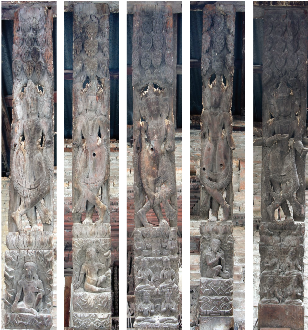
Existing struts of Itumbáhah East Wing courtyard facade. Photographs October 2013