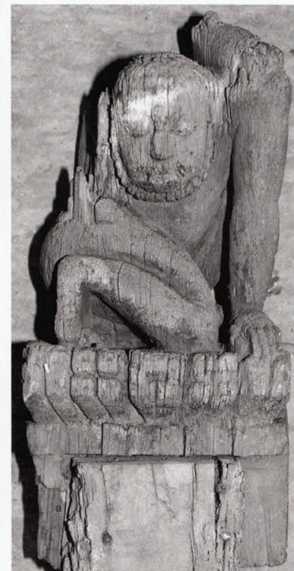
Fig. 51 (opposite, left). Already in a deplorable state when photographed in 1969 or 1970, this exquisite early carving, radiocarbon dated 770–970, was soon allowed to disintegrate under a collapsed roof. Itumbāhāh, strut 1. The presence of a child is unique among the earliest struts.