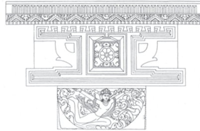
Blind window from south wing courtyard facade. Drawing Bijay Basukala, 2002