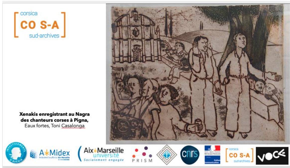
Xenakis recording corsican singers in Pigna, Corsica

Corsica Sud-Archives : How to build a musical bridge between cultural heritage and today users.