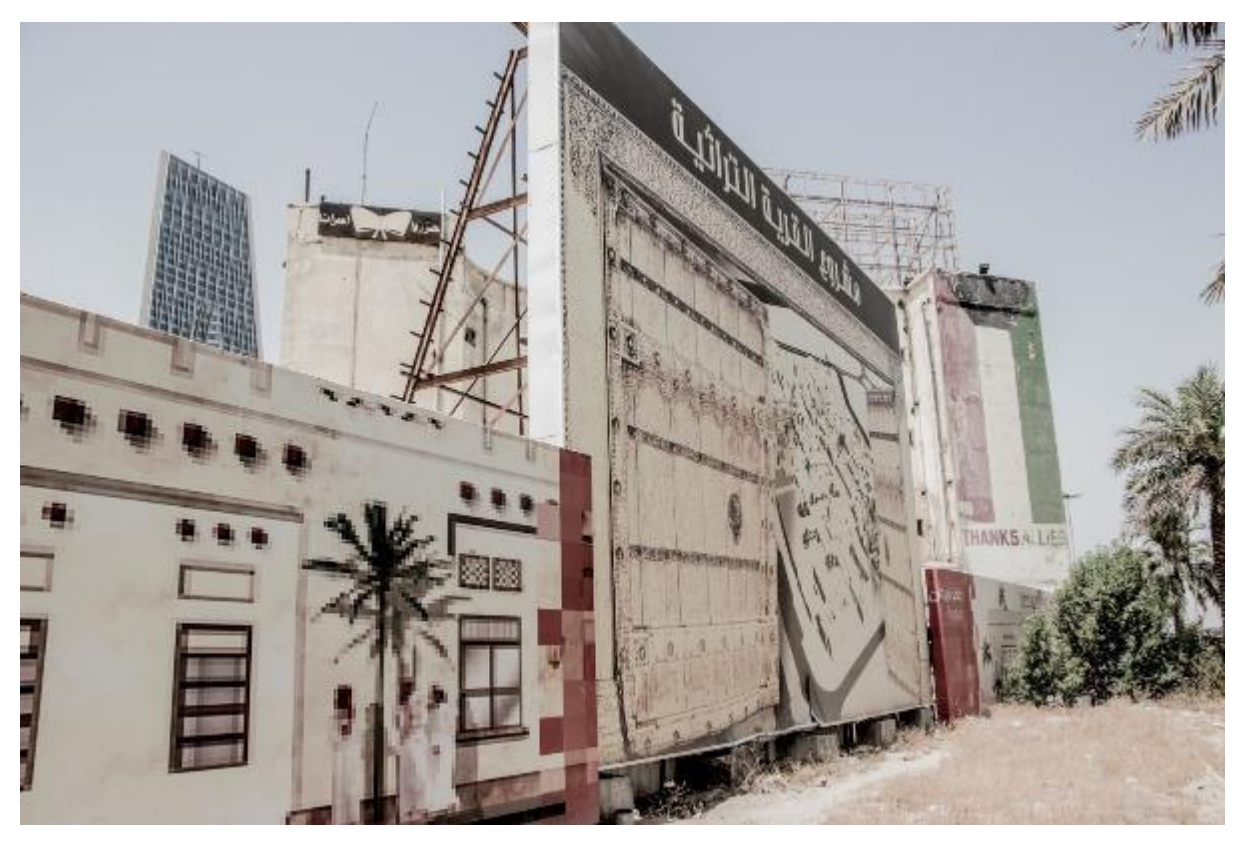
Fig. 5: Advertising stratification and pixelation of the Heritage Village project, discontinued in 2010. Photo and copyright: Manuel Benchetrit, 2017. Courtesy of the photographer.

It is not unusual for speculative phenomena to be abandoned but maintaining the advertising despite incompletion is unusual (Fig. 5). The images are imposing, a mixture of impressions on fencing and large metal panels in the ground. The cocktail of "tradition" and "modernity" lacks subtlety (a man in a thawb <sup>42</sup> carrying a briefcase, an aerial view of a 3D model of sand-coloured buildings bearing the slogan "Inspiration from the past"), on posters that are in good condition. According to one source, some of them have been replaced since the work ceased. You can tell that they were not all put up at the same time. Several layers coexist to form a sort of stratification, echoing how the site's archaeological content arose through layers of history. Why would the developer make such changes after having abandoned the project? Is it to maintain the illusion that the work is ongoing? The government is usually quick off the mark when it comes to removing posters that just take up space. Is it not attempting to save face by allowing the town-planning fiasco to hide behind flattering images? These questions remain unanswered but support the two-fold thesis of the image rendering something "invisible" and the image as a project. Cover prevails over content and the absence of images in an icon-mad society appears to be more attractive than their presence.