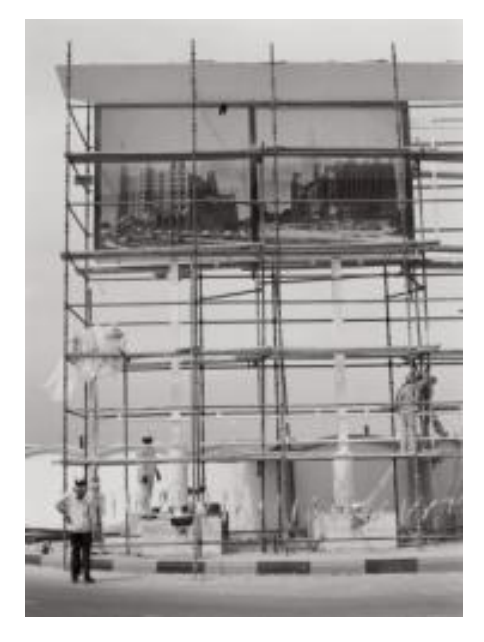
Figure 6: Putting up the image. Advertising is an economy its own right, with its workers and scaffolding, exactly like a construction site, Sharjah, UAE.

Looking at these signs along with contemporary trends in the advertising market, although still generating a considerable urban micro-economy (Fig. 6), is a 4m by 3m image posted on a panel the epitome of 20th century marketing? Nowadays, new budgets go to advertising campaigns on the social networks and video platforms, as demonstrated by the recent promotional film for the new town of NEOM desired by the crown prince of Saudi Arabia in the Gulf of Aqaba, viewed more than 300,000 times. Dilapidated images, empty billboards and mirage advertising are symptomatic of a crisis in this outdated visual and material advertising. It raises questions about what is to become of urban advertising and on the place it occupies in urban settings when the field is increasingly digitalised and played out on social networks (Fig. 7).