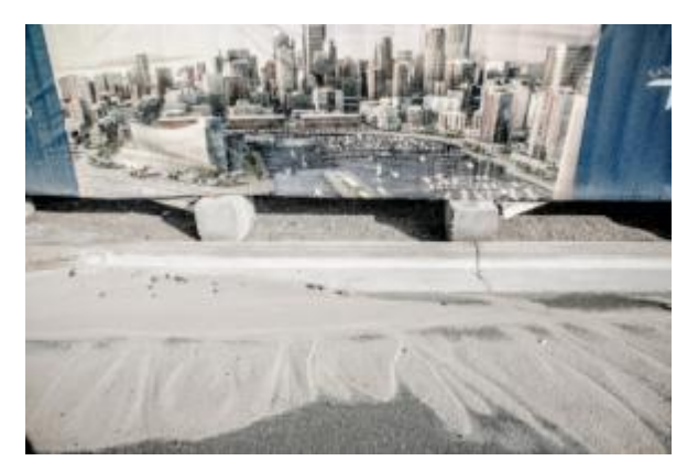
Fig. 1: When advertising looks like a city: construction site in Abu Dhabi, UAE.

Images are everywhere, proliferating in huge format in front of planned or ongoing construction sites, finding their way into all stages of the urban fabric. They are almost always the product of creative work on 3D design software, producing with results that are both so realistic that they could be mistaken for a photograph and very artificial (smooth surfaces, immaculate flowerbeds, flawless vegetation, and with people positioned geometrically). Advertising for future buildings, neighbourhoods, malls and resorts represent a considerable share of the advertising market. In marketing terms, "city products" are urban projects of symbolic significance and have taken over from the "product-city", aimed at promoting a particular identity trait.<sup>20</sup> Consequently, the interchangeable and de-territorialised dimension of urban projects and their images have been accentuated (Fig. 1).