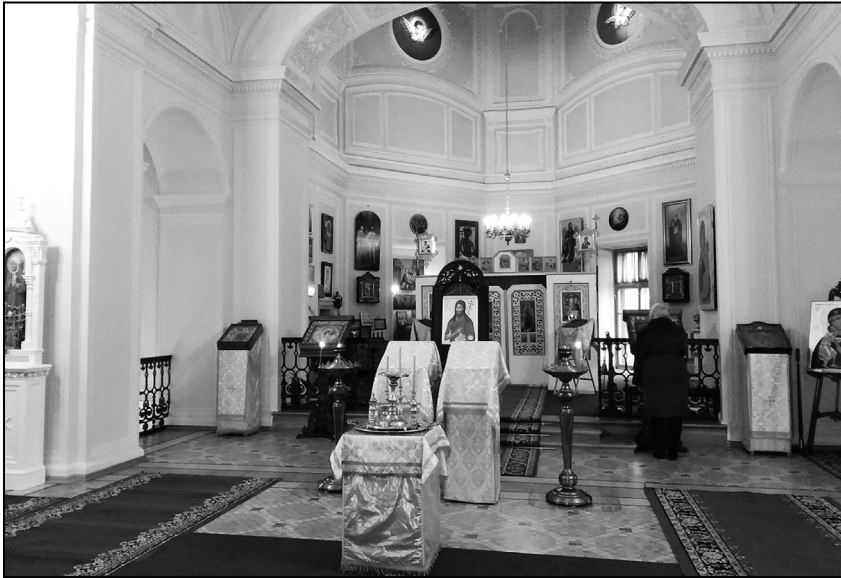
Figure 1. The imperial temple of the palace in Gatchina

of their agency as simultaneously religious believers and state museum professionals, and by paying close attention to the political and historical conditions in which this agency has been deployed, we can gain an understanding of the practical making of Russia's post-secular era.