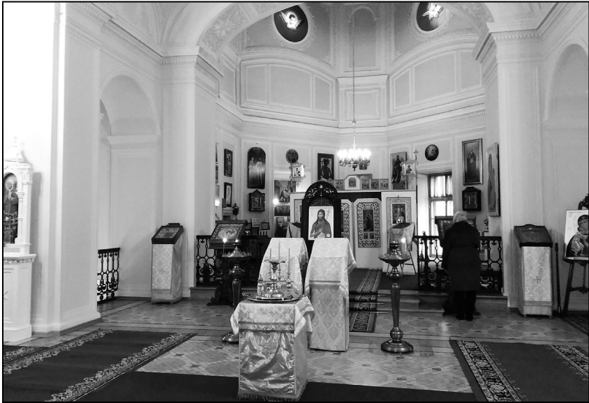
Figure 1. The imperial temple of the palace in Gatchina

of their agency as simultaneously religious believers and state museum professionals, and by paying close attention to the political and historical conditions in which this agency has been deployed, we can gain an understanding of the practical making of Russia's post-secular era.