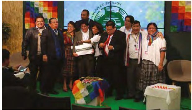
Indigenous delegates at Indigenous Peoples' Pavilion of the COP21 Generation Climate space, 4 December 2015.

negotiation. Here we examine the consolidation of three such narratives that articulate the theme of climate change with that of traditional knowledge and, more generally, Indigenous peoples. These narratives portray these peoples as key players in the development of scenarios anticipating the future of humanity, at the same time justifying their interests and supporting the defense of their claims. As such, narratives are key diplomatic instruments in the climate arena.