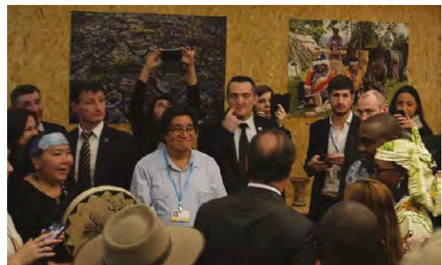
Visit of French president François Hollande to the Indigenous Pavilion during COP21.

From the state-level negotiations during COP 21 to more alternative spaces like the Climate Action Zone welcoming global civil society, we found Indigenous narratives to be carried through a wide range of channels, reaching a wide variety of actors, from heads of state to passersby in the Paris metro. While not obviously central, the Indigenous presence at COP 21 was significant and visible, with many of the participating organizations clearly identifying this COP as an important event at which to continue to push their agenda, advocate for their cause, establish contacts and capture resources and projects from international funders.