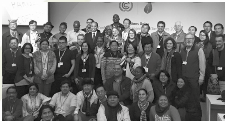
Meeting of the Indigenous Peoples' Caucus at COP 21 in Paris.

The diplomacy of traditional knowledge thus seems to lay the foundations of an alternative to the science diplomacy of climate change. It exercises a kind of influence or form of soft power where the challenge is not so much to impose decisions and norms as it is to change representations, roles in the climate arena, and alliances. This influence must be understood cumulatively and over the long term. The exercise of traditional knowledge diplomacy does not drastically change the living conditions of local communities, and it may even in some cases create or reinforce a conceptual gap between global humanity and local autochthony. However, its contribution over the last 50 years to a growing institutional and political consideration of Indigenous peoples and their rights must be acknowledged.