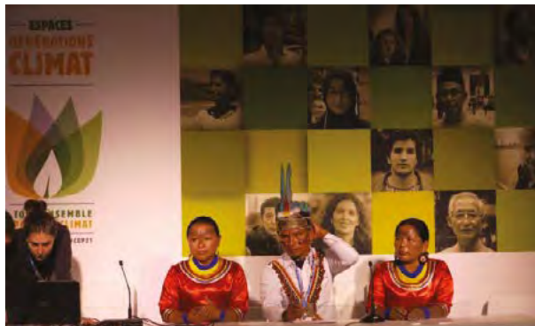
Presentation of the "Selva Viviente" (Living Rainforest) initiative by Sarayaku People Delegates in the COP21 Climate Generation space, 1 December 2015.

Ontology, or metaphysics: the philosophical study of 'being' in general. - Encyclopaedia Britannica