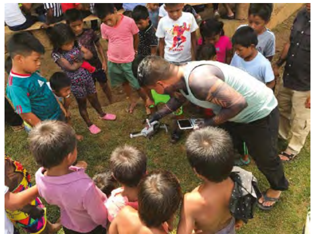
Training in drone management by Panamanian organization Geoidigena in Honduras, 2022.

"With time, the climate jargon is always stronger. Nevertheless, the so-called Indigenous Monitoring, Reporting, and Verifying for us is nothing but a form of governance and vigilance of our territory, that is to say what we have always been doing all along our history, but this time with technological tools that enable us to do it better".