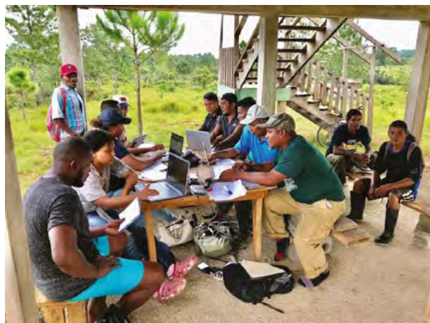
Navigating the territory and learning to use Geographical Information System (GIS) during a 2022 workshop between Panamanian and Honduran Indigenous people: an example of combining traditional and scientific territorial knowledge.