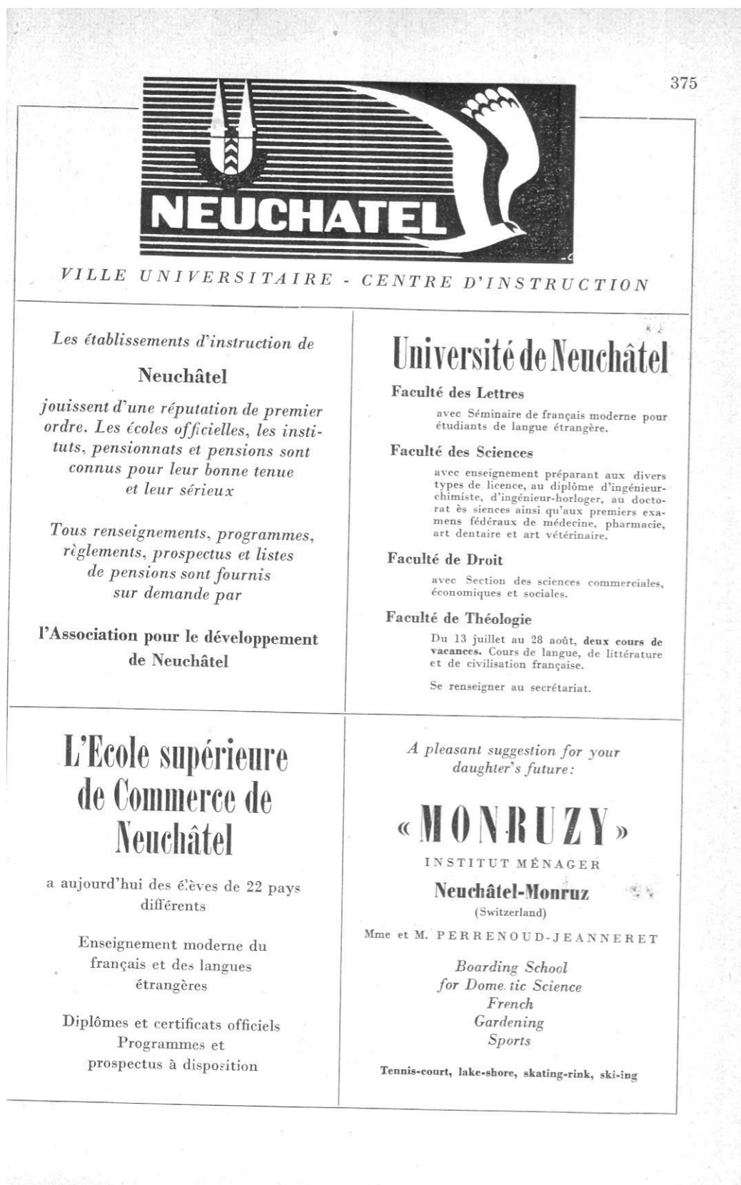
Image 8: Annuaire des organisations internationales/Yearbook of international organizations , Genève, Société de l'annuaire des organisations internationales, 1948, p.279.