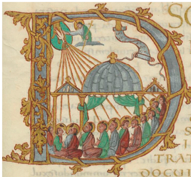
Figure 6. Paris, Bibliothèque Nationale de France, MS lat. 9428, folio 78 recto.

Christ is not mentioned in the verses relating the episode of Pentecost. In the image, even though he is figured, he does not seem to be part of the narration. He stands in a