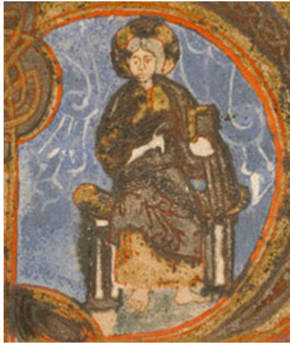
Figure 4. Boulogne-sur-Mer, Bibliothèque municipale, ms. 20, fol. 11 recto.