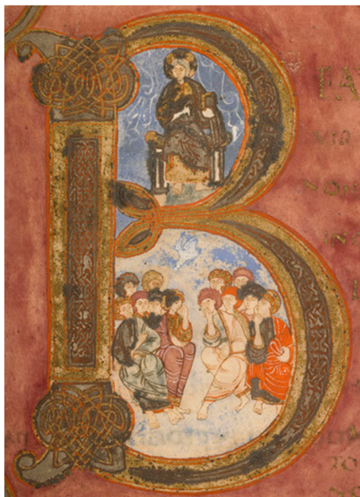
Figure 2. Boulogne-sur-Mer, Bibliothèque municipale, ms. 20, fol. 11 recto.