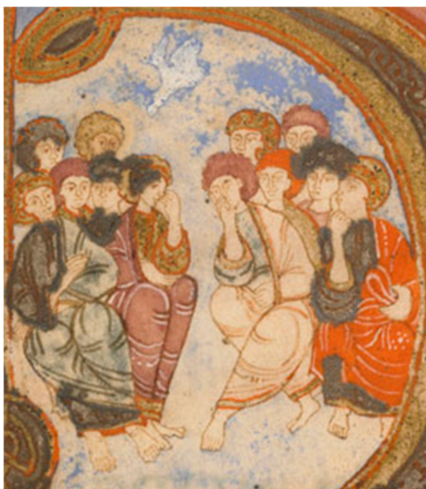
Figure 3. Boulogne-sur-Mer, Bibliothèque municipale, ms. 20, fol. 11 recto.