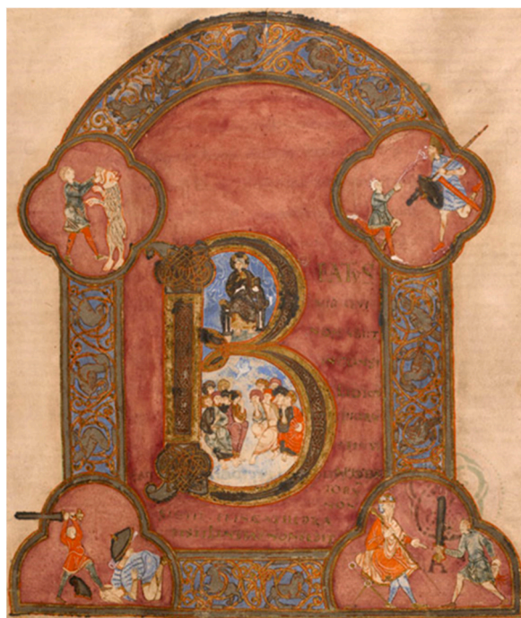
Figure 1. Boulogne-sur-Mer, Bibliothèque municipale, ms. 20, fol. 11 recto.