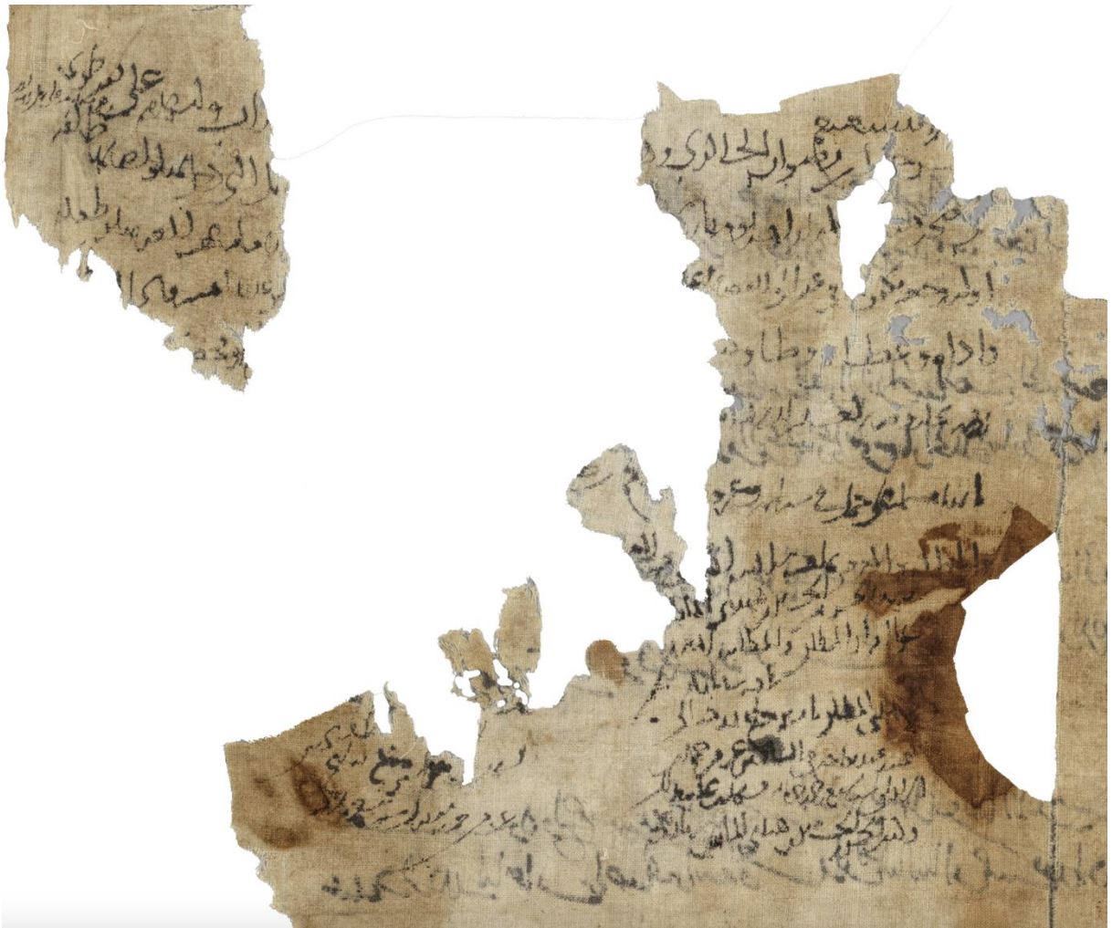
Figure 7. P. Dār al-āthār al-islāmiyya in Kuwait Inv. LN S 81 TF verso (text 3)

1 In the name of God, the Merciful, the Compassionate.