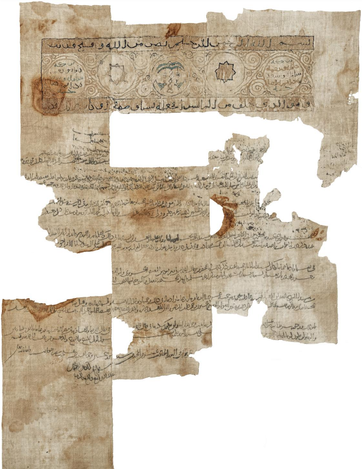
Figure 1. P. Dār al-āthār al-islāmiyya in Kuwait Inv. LN S 81 TF recto