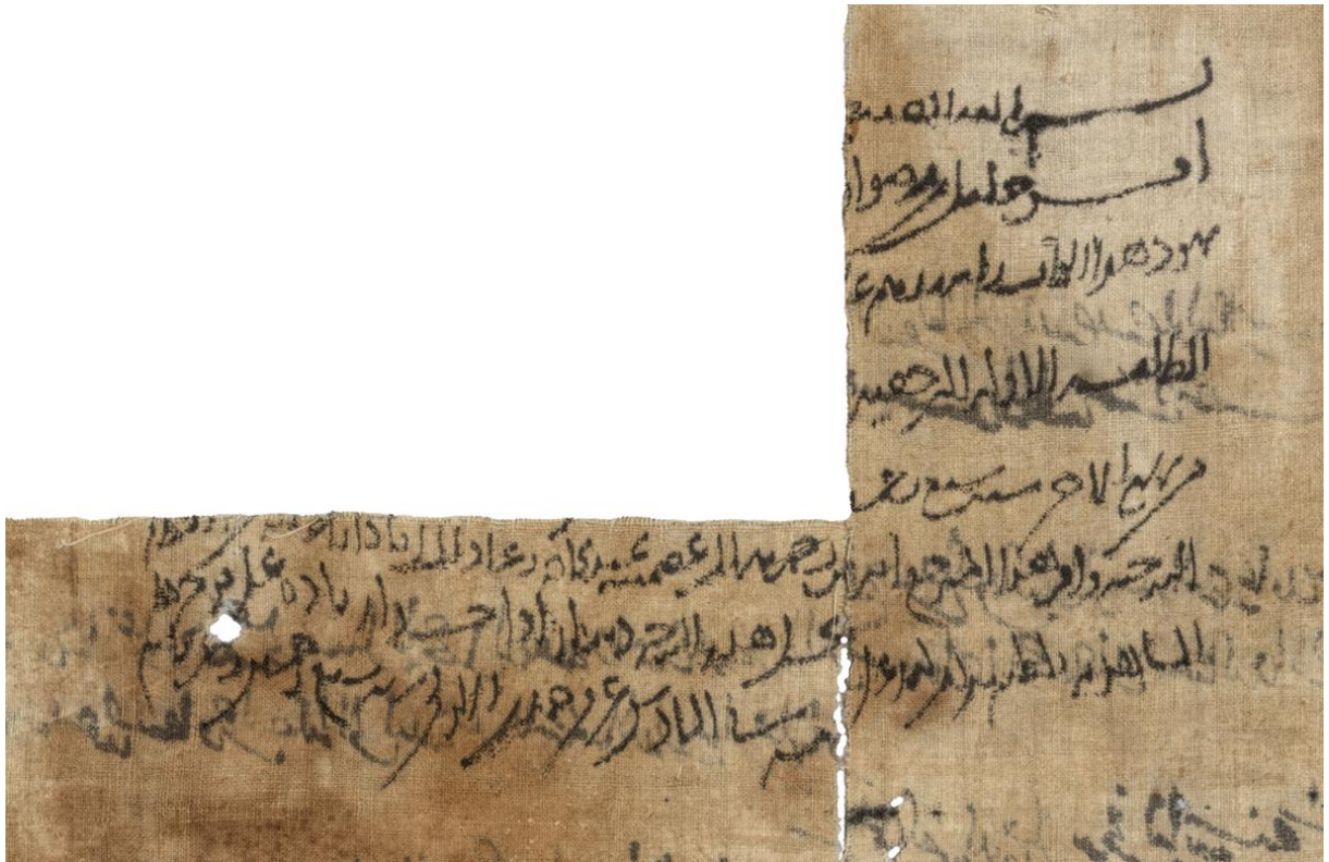
Figure 6. P. Dār al-āthār al-islāmiyya in Kuwait Inv. LN S 81 TF verso (text 2)

1 In the name of God, the Merciful, the Compassionate.