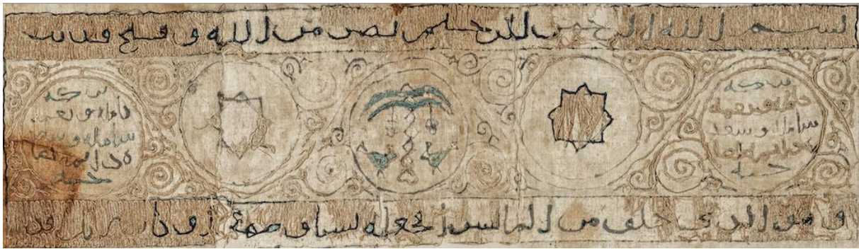
Figure 3. P. Dār al-āthār al-islāmiyya in Kuwait Inv. LN S 81 TF recto (embroidered heading)

The heading embroidery is particularly well preserved but incomplete, so much so that one wonders if it was ever finished. Most of it is executed in beige silk thread. The first, second, and third lines of the left medallion are embroidered in a green or blue thread, as are the inside of the birds' bodies and the leaves of the palm tree. The round letters of the upper and lower inscriptions, embroidered in black thread, are also filled with green or blue embroidery. In contrast, the centre line of the right medallion is not embroidered, and the brown thread embroidery of the palm trunk and stars is incomplete. The scrolls in the centre of the piece are also incomplete. These missing silk threads reveal the preliminary layout of the drawings and calligraphy, executed in a black ink that was meant to be concealed by the embroidery.