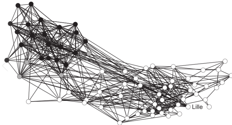
Figure 21.2: Example of use of word co-occurrences

-> A network of migrations between towns "Migration" defined as a movement by married people between their birth and marriage, creating a tie between the place where they were born and the place where they lived just before marrying Layout based on geographical positions; white/grey/black based on main language spoken in each place (according to a different source).