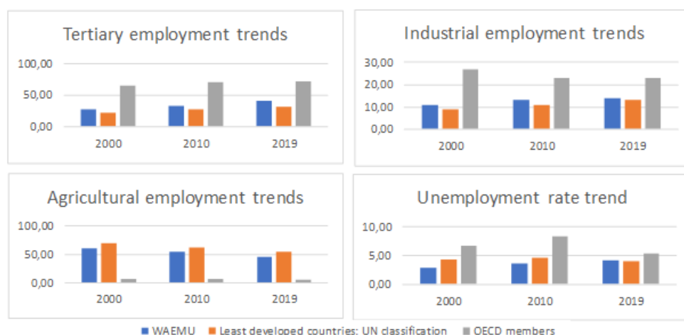
Figure 1: Employment and unemployment trends 2000-2019 (%)

In addition, according to the World Bank (2019), the unemployment rate is on a downward trend in both developed and developing countries, as depicted in Figure 1. Indeed, over the period 2000-2019, the unemployment rate fell by 0.3 points in less advanced countries (from 4.3% in 2000 to 4.0% in 2019) and by 1.4 points in the Organization for Economic Cooperation and Development (OECD) countries (from 6.8% in 2000 to 5.4% in 2019). However, in contrast to this global trend, an increase in unemployment has been observed in the WAEMU countries. The unemployment rate rose from 2.95% in 2000 to 4.19% in 2019, an increase of 1.24 points. Furthermore, data from the WAEMU (2019) reveal that countries in the sub-region face inequalities in the distribution of unemployment according to certain individual characteristics. Indeed, youth unemployment is significantly higher than that of other age groups. The unemployment rate among 15-24 years old is 5%, compared with 1% for 41-64 years old. Similarly, depending on the level of education, unemployment persists particularly among higher education graduates, with a rate of 11%, while for the working population without a degree, it is just 2% (WAEMU, 2019). Furthermore, urban workers (5%) are particularly more affected by unemployment than their rural counterparts (1%).