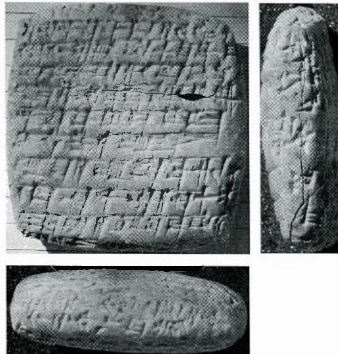
Figure 2: Photos of the different sides of Kt 2018/k 2.