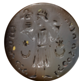
Fig. 3. The motif of the good shepherd on the seal of the Nayeri collection (courtesy Dr. Jebrail Nokandeh, National Museum of Iran, No. 5740).