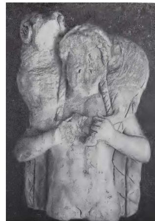
Fig. 6. The statue of the bearded Hermes Kriophoros, Archaeological Museum of Ancient Corinth n° 686. https://commons.wikimedia.org/wiki/File: Hermes the Ram Bearer, Roman Period, AM of Corinth, 202812.jpg .