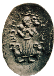
Fig. 2. The motif of the good shepherd on the impression of a Sasanian seal kept in a private collection (Gignoux / Gyselen 1982, 13.2/4.6).

An iconography similar to that of the Good Shepherd is also attested on some of the seals that are dated to the Sasanian period. One of these seals is kept in a private collection; the information regarding this seal was published in 1982 by R. Gyselen and Ph. Gignoux. This seal has a Pahlavi inscription: (š) 'hyn pn 'hy yzd 'n , i.e. šāhēn panāh yazdān , “Šāhēn, protection of the gods” (Fig. 2); despite the plural form of the legend, it has been identified as Christian: R. Gyselen argues that the plural formulation could be due to a confusion of the lapidary, the final -t of singular yzdt read -yn . 12 Another seal belongs to the Nayeri collection (National Museum of Iran, No. 5740) and has an obscure inscription in Middle Persian 13 (Fig. 3). With the discovery of Bābōy's seal, we have three attestations of this motif in Sasanian sigillography.