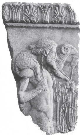
Fig. 5. Hermes the Ram Bearer, No. 54 of the Archaeological Museum of Athens (Stroszeck 2004, p. 231).

This motif was later used in Greek art to depict Hermes as Hermes Kriophoros (lamb/ewe-bearer) or Moschophoros (calf-bearer). This imagery began in the Archaic period in Greece (550–480 B.C.) in the form of bronze statuettes, terracotta figurines and statues. 8 But after Calamis introduced the Hermes that carried a ram on his shoulders, it became one of the most popular subjects for Greek sculptors 9 (Fig. 5). This motif was also used by the Romans and they reproduced Kriophoros statues 10 (Fig. 6).