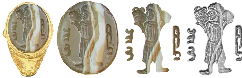
Fig. 1. The motif of the good shepherd on the seal auctioned at Christie's with a Syriac inscription ( www.christies.com ).