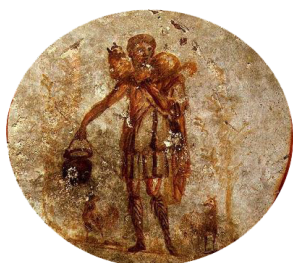
Fig. 7. Ceiling paintings in the tomb of Callistus in Rome (3rd century AD).

Late in the third century, with the slight increase in the Christian populations in the Roman and Persian Empires, we see the appearance of this motif in early Christian art, which is specifically known in Christian literature as the Good Shepherd. The Good Shepherd of this era appeared mostly on clay lamps and in funerary contexts. The motif can be seen in the mosaics of the cemetery under St Peter's Basilica, the wall paintings of the Tomb of the Aurelii, and the Catacombs of Via Latina, Domitilla, Priscilla and Callistus 11 (Fig. 7-8), etc.