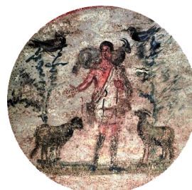
Fig. 8. Ceiling painting in the tomb of Priscilla in Rome (3rd century AD). https://commons.wikimedia.org/wiki/File: Good shepherd 01 small.jpg .

An iconography similar to that of the Good Shepherd is also attested on some of the seals that are dated to the Sasanian period. One of these seals is kept in a private collection; the information regarding this seal was published in 1982 by R. Gyselen and Ph. Gignoux. This seal has a Pahlavi inscription: (š) 'hyn pn 'hy yzd 'n , i.e. šāhēn panāh yazdān , “Šāhēn, protection of the gods” (Fig. 2); despite the plural form of the legend, it has been identified as Christian: R. Gyselen argues that the plural formulation could be due to a confusion of the lapidary, the final -t of singular yzdt read -yn . 12 Another seal belongs to the Nayeri collection (National Museum of Iran, No. 5740) and has an obscure inscription in Middle Persian 13 (Fig. 3). With the discovery of Bābōy's seal, we have three attestations of this motif in Sasanian sigillography.