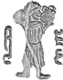
Fig. 1A. Image and inscription on the impression of the seal (see: Fig. 1).

The inscription is not easy to read as some letters are not clearly formed.