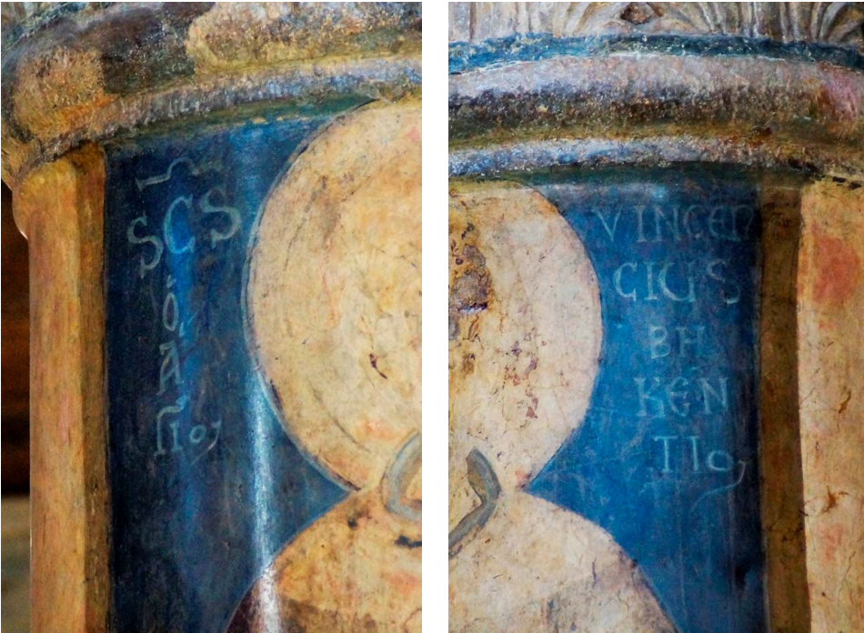
Fig. 7a and 7b. Saint Vincent painted on a column in the Nativity church of Bethlehem with his name in Greek and in Latin (third quarter of the twelfth century).