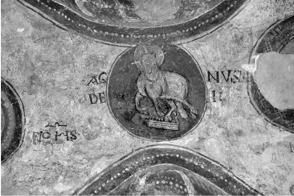
Fig. 4. Lamb of God painted in the crypt of Notre-Dame-la-Grande at Poitiers at the end of the eleventh century.