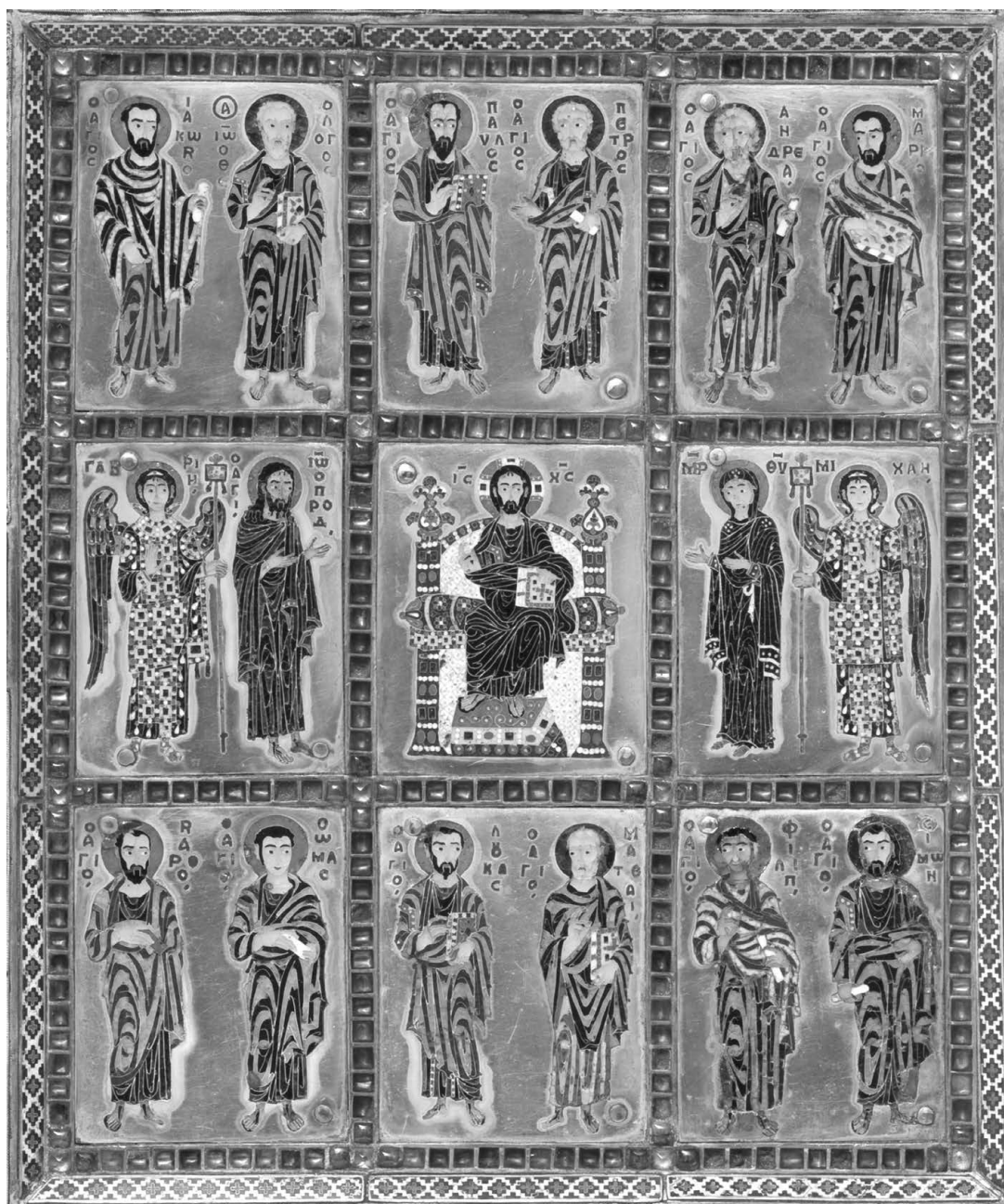
Fig. 6. Detail of the Limburg staurotheca (10 th c.). Image: Andreas Rhoby, Epigramme auf Fresken , fig. 26