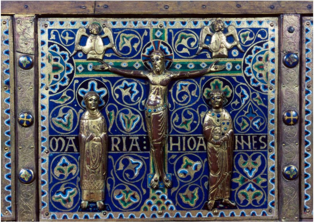
Fig. 9. The Virgin Mary on the Saint Calminius Reliquary, twelfth-century chasse-form reliquary, treasury of Mozac Abbey.