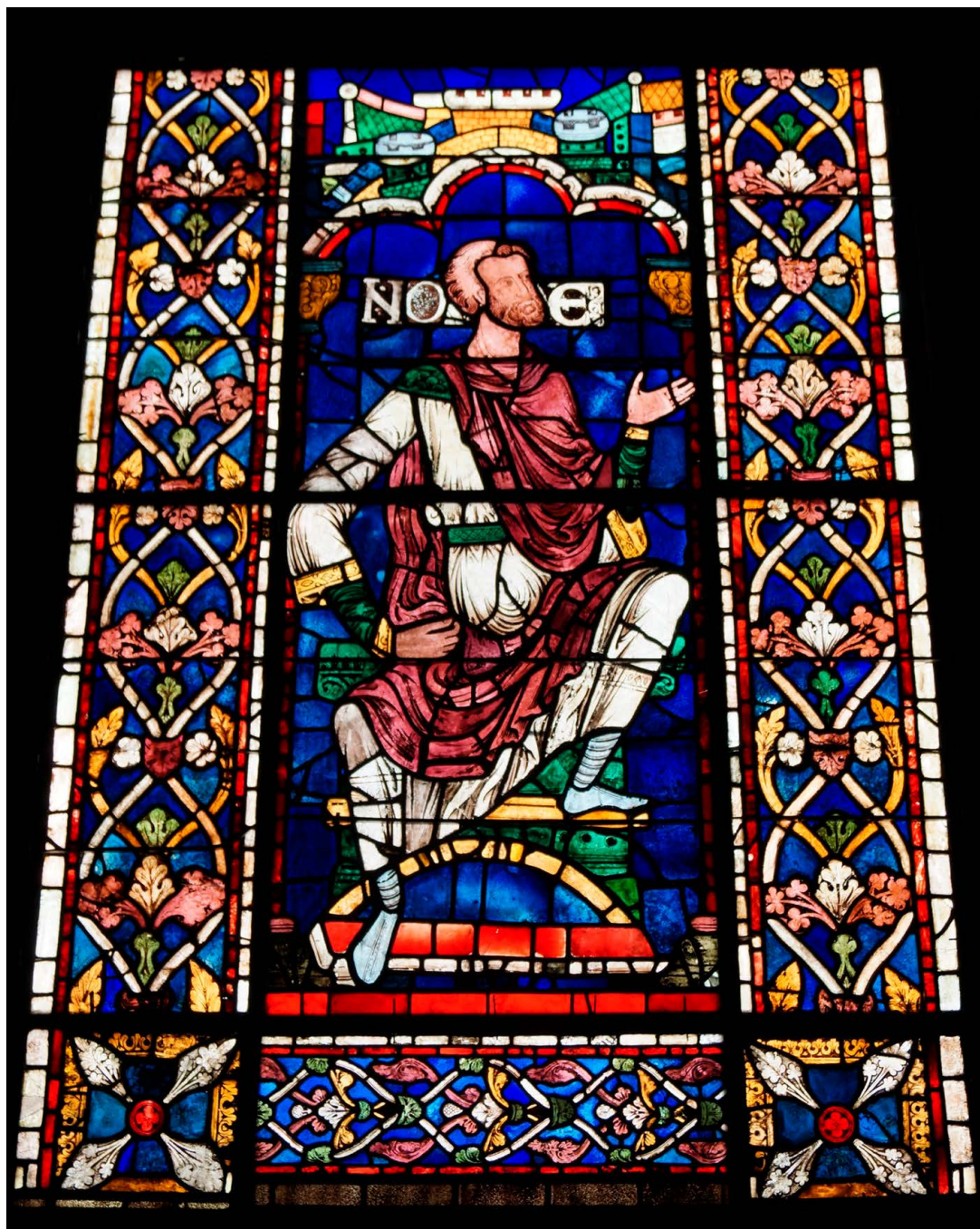
Fig. 3. Stained glass from Canterbury Cathedral at the Met Cloisters (1178–1180) depicting Noah.