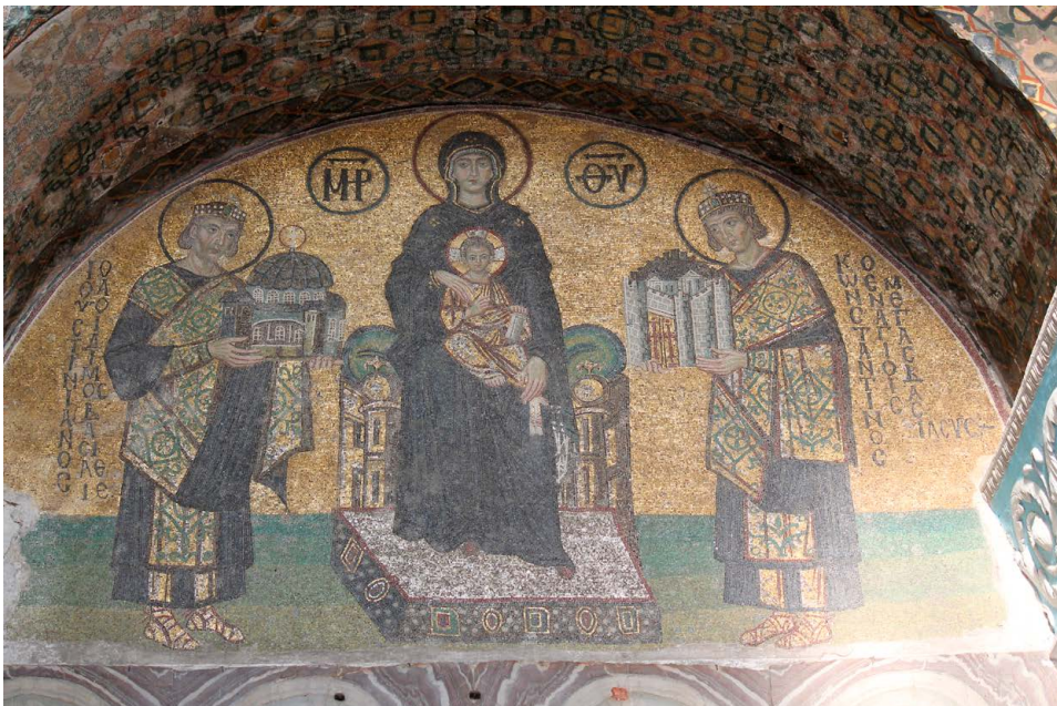
Fig. 5. Mosaic in the southwest vestibule of Hagia Sophia in Istanbul representing Mary and Christ, Justinian and Constantine (10 th c.).