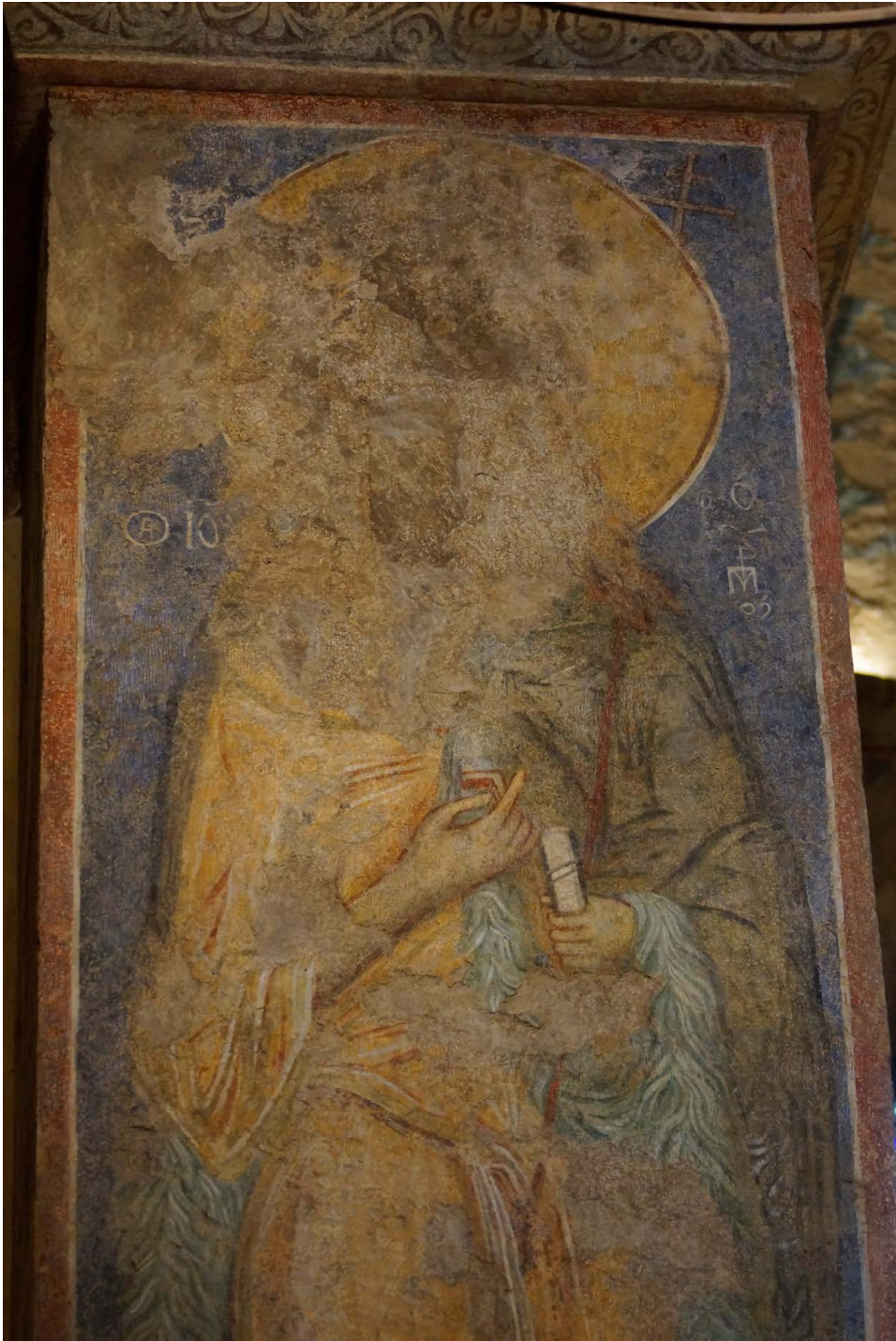
Fig. 8. John the Baptist painted on a pillar in the Hospitaller church of Abu Gosh in the Latin Kingdom of Jerusalem (c. 1170).