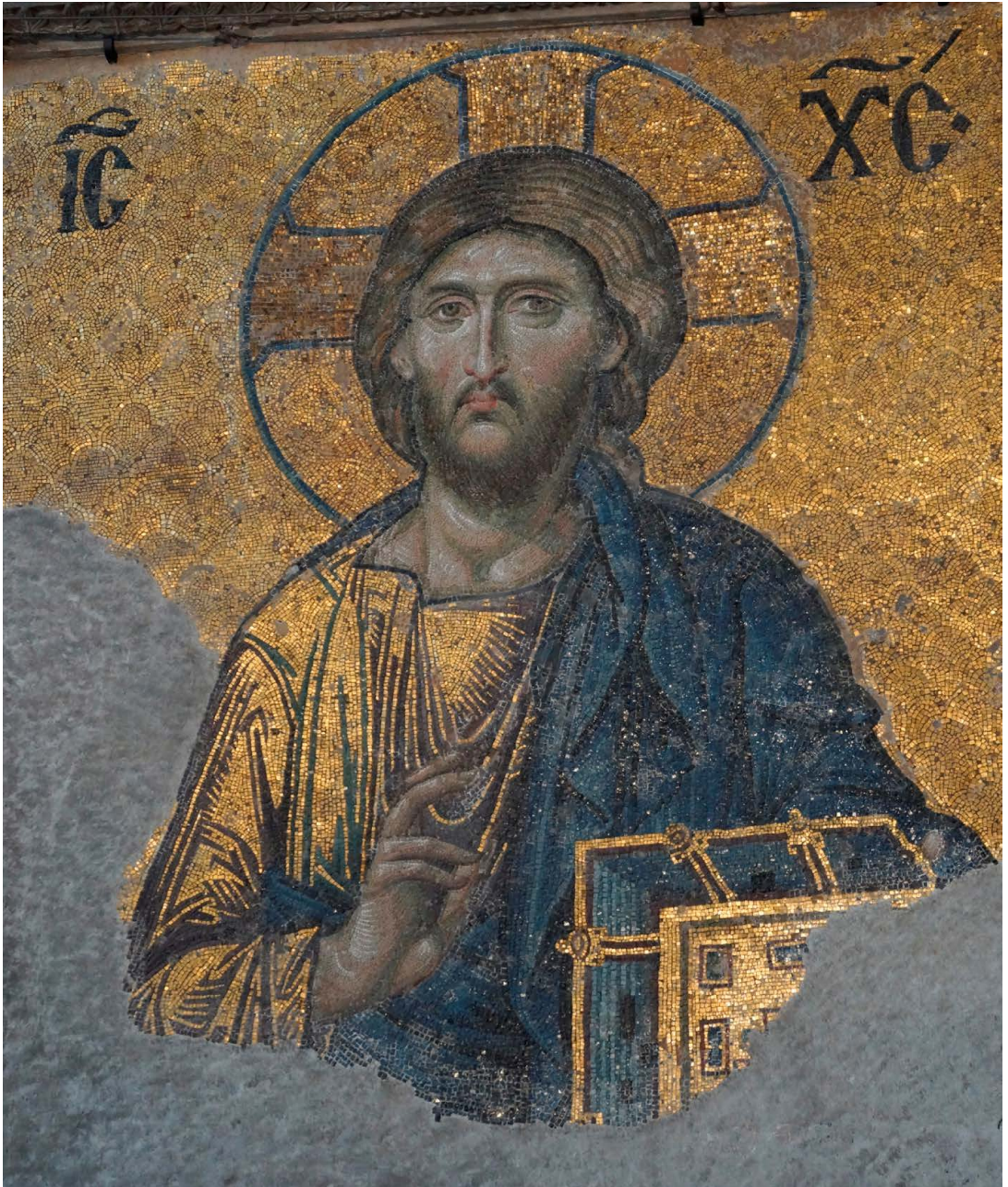
Fig. 2. The Christ Pantocrator of the deesis mosaic (1261), in the upper south gallery of Hagia Sophia, Istanbul.