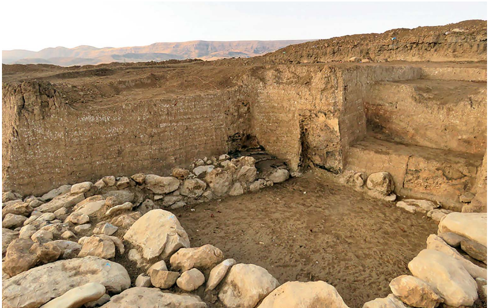
Fig. 7: Area E. Room L. 692 looking south-west. The access to L. 915, not yet excavated, is well visible