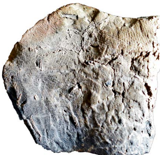
Fig. 5: Sealing M. 1002 showing a contest scene and the textile imprint (Mission archéologique française du Peramagon)