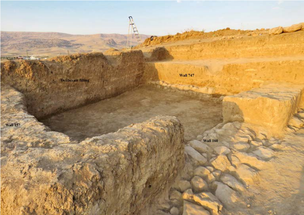
Fig. 2: Area B. Room L. 742 from the north-east