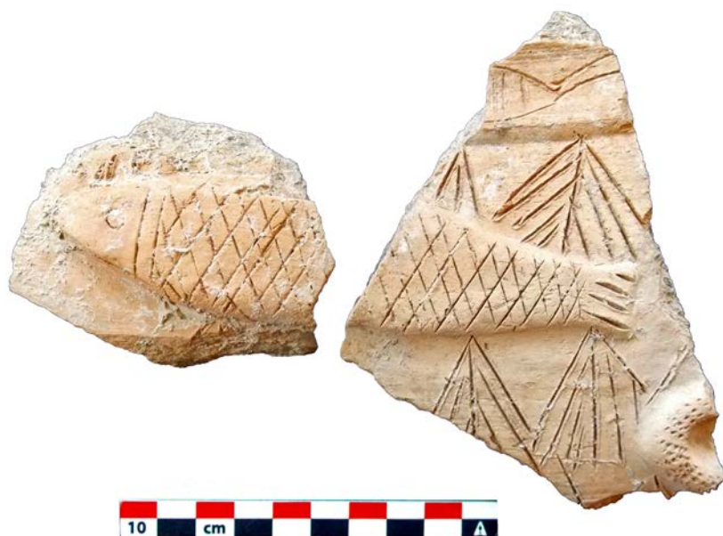
Fig. 3: Area B. Sherd with a modelled fish (Mission archéologique française du Peramagon)