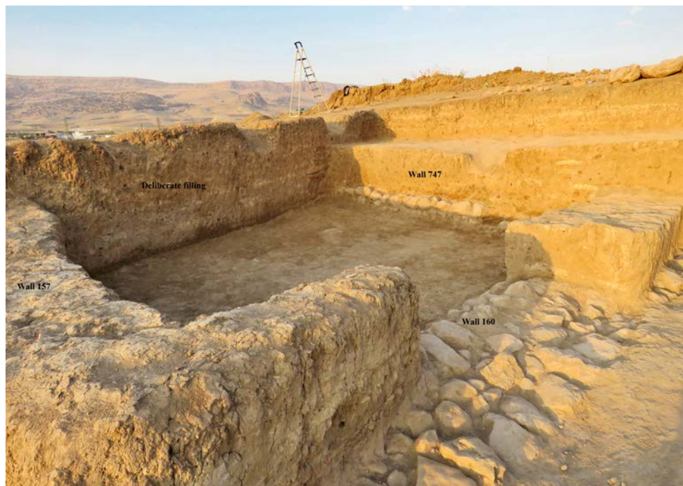
Fig. 2: Area B. Room L. 742 from the north-east