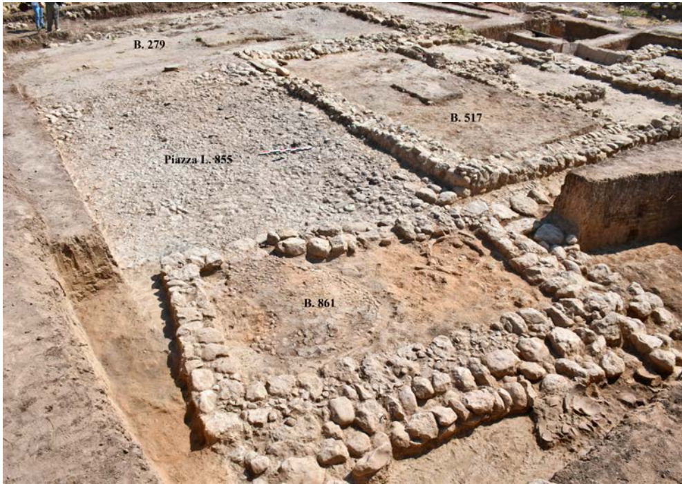
Fig. 4: Northern part of Area C looking south-east (Mission archéologique française du Peramagon)