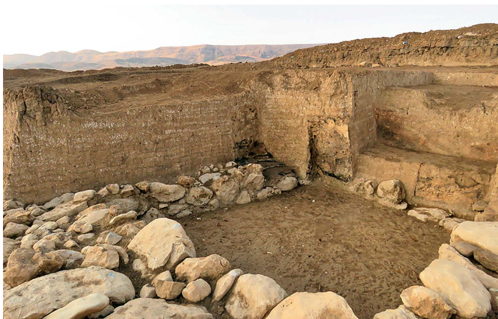
Fig. 7: Area E. Room L. 692 looking south-west. The access to L. 915, not yet excavated, is well visible