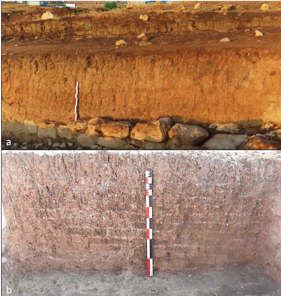
Fig. 8: Area C. Wall 813. On top (a) the eastern face with irregular layers of cob, on the bottom (b) the western face with regular cob modules (Mission archéologique française du Peramagon)