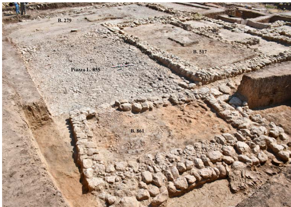
Fig. 4: Northern part of Area C looking south-east (Mission archéologique française du Peramagon)