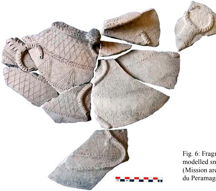
Fig. 6: Fragmentary jar with modelled snakes and scorpions (Mission archéologique française du Peramagon)