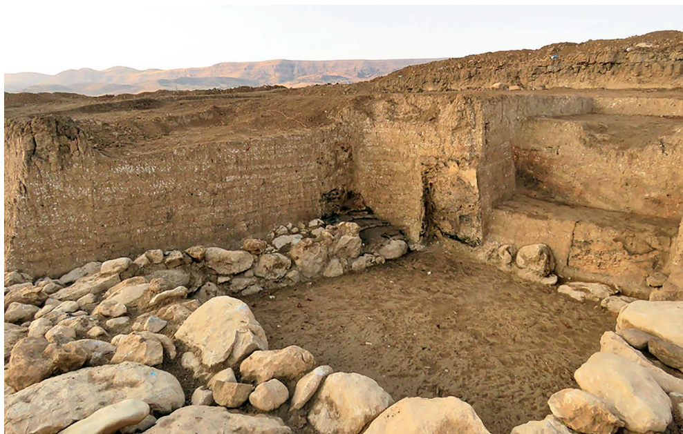
Fig. 7: Area E. Room L. 692 looking south-west. The access to L. 915, not yet excavated, is well visible (Mission archéologique française du Peramagon)