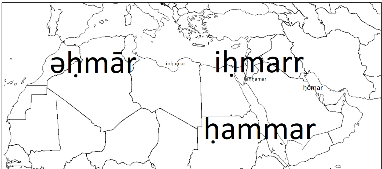
Figure 1: ‘Turn red’ across Arabic dialects

Further south, in contrast, Form IX is often nonexistent, as in Upper Egypt 10 , Sudan 11 , Chad 12 , and Nigeria 13 ; all along western Arabia from Wadi Ramm 14 through the Hijaz 15 and Asir 16 to Yemen 17 ; and across southern Arabia as far east as much of Oman 18 . Across most of this area, from Nigeria to Oman, it is typically replaced by Form II 19 , effectively shifting its gemination to the second rather than third radical. In between the Form IX and Form II areas, other strategies are more sporadically attested. In some sedentary Gulf dialects 20 , Form IX is replaced by FōʕaL (at least for colours), while in southwestern Jordan it is typically replaced with Form VII, anFaʕaL . Periphrastic forms are also found. See Figure 1 for the schematic distribution of these strategies.