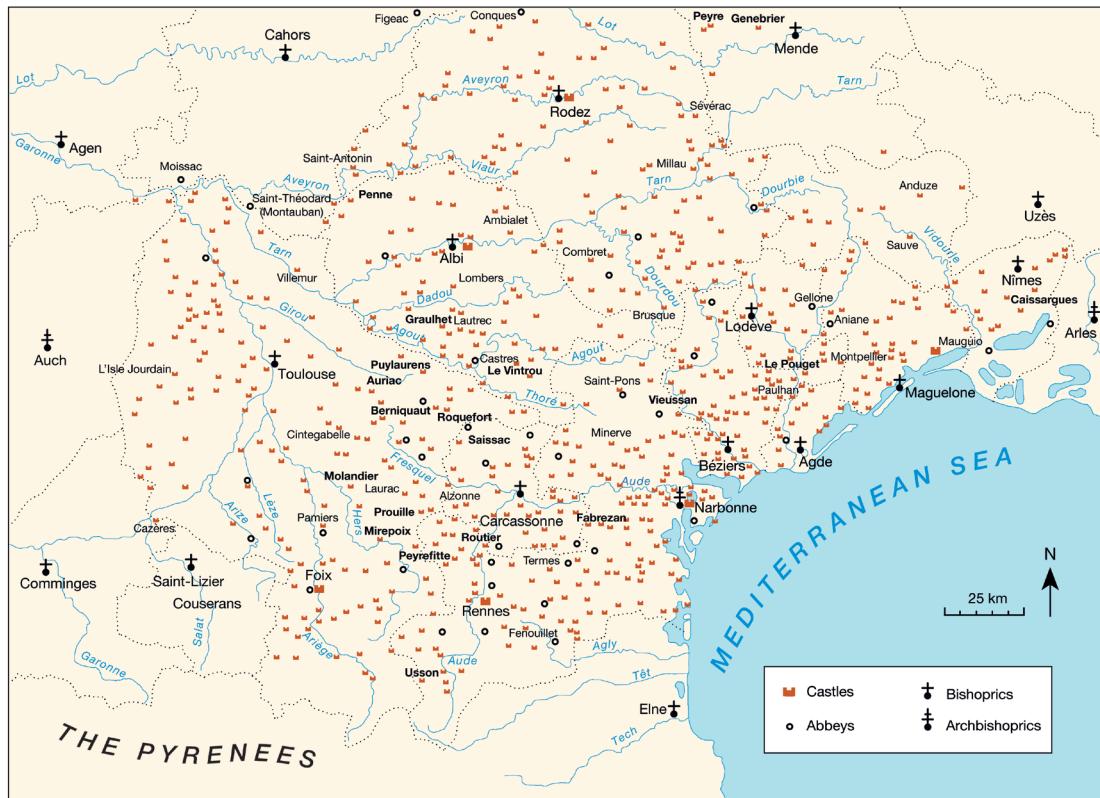
Figure 3: Castles, eleventh-twelfth century