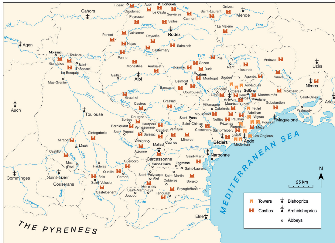
Figure 2: Castles, ninth-tenth century

This phenomenon becomes very clear if one compares two maps: that of castles attested in the ninth to tenth centuries (see Figure 2) and that of castles attested in the eleventh to twelfth centuries (see Figure 3). In the Carolingian and post-Carolingian period, there are few attested castles, between approximately five and ten per county, despite the relative abundance of documents (we can count approximately 1,000 charters for the ninth and tenth centuries, with, among other things, a good ten wills of members of comital or vice-comital lineages in the second half of the tenth century). In contrast, the profusion of castles in the eleventh and twelfth centuries is such that it defies any mapping on the same scale. In some areas, it is impossible to fit all the attested fortified structures into a page: the map (Figure 3) should be understood as an evocation and not an accurate geography of castles, which would require a much larger-scale level of representation. Moreover, the terms for the ancient structures of population management, such as the ministerium , vicaria , or pagus , disappear from the sources and are replaced by the terminium (»boundary«) or the mandamentum , or territorium castri (»land controlled by a castle«), or by the parrochia (»parish«). 7 At the head of all these small castles, one meets a multitude of lords about whom abundant documentation is preserved. It is this data that will interest us now.