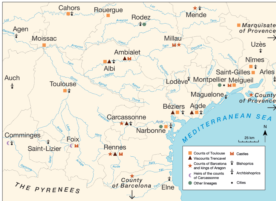
Figure 1: Languedoc at the end of the 12th century

representatives of power date to the middle of the tenth century. The first tentative royal interventions occurred in the middle of the twelfth century, when the Capetian ruler Louis VI (r. 1108-1137) tried to seize Toulouse in the name of his wife Eleanor (in 1141) and his son Louis VII (r. 1137-1180) went on pilgrimage to Santiago de Compostela (in 1155). The period under consideration came well before the major intrusion of French northerners into the region at the beginning of the thirteenth century – the so-called Albigensian crusade (1209-1229), which ultimately led to the integration of these lands in the royal demesne. 1