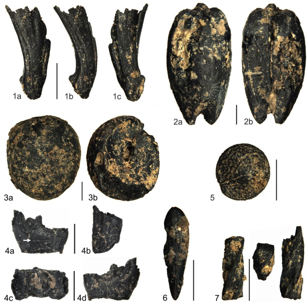
Fig. 3 Charred remains of cultivated plants from Nicolaevca V. 1 , glume base of Triticum monococcum (einkorn); 2 , caryopsis of Triticum sp. (wheat), a , dorsal view, b , ventral view; 3 , Fabaceae indet., large (probably Pisum sp., pea); 4 , spikelet base of cf. NGW ( T. timopheevii ), a , ventral view, b , lateral view, c , top view, d , dorsal view; 5 , seed of Chenopodium hybridum (goosefoot); 6 , achene of Lapsana communis (nipplewort); 7 , awn fragments of Stipa sp. (feather grass); scale bars, 1 mm

due to the lack of details about the archaeological context (layer and potsherd origin) as well as difficulty of plant identification from imprints we should not take these data into account. This is especially true in the case of commonly found remains of Panicum miliaceum (broomcorn millet), as its Neolithic chronology still remains uncertain (Filipović et al. 2020). For example, one grain of Panicum from the Neolithic layer at Kamyane was dated and it proved to be later (Martin et al. 2021: cal AD 264–541; GifA19189a: 1,635 \pm 45 BP). This suggests that millet remains can easily be intrusive at Neolithic sites. However, 11 specimens of cultivated and wild plants from Kamyane and Nicolaevca were directly radiocarbon dated and their Neolithic origin was confirmed (Table 1).