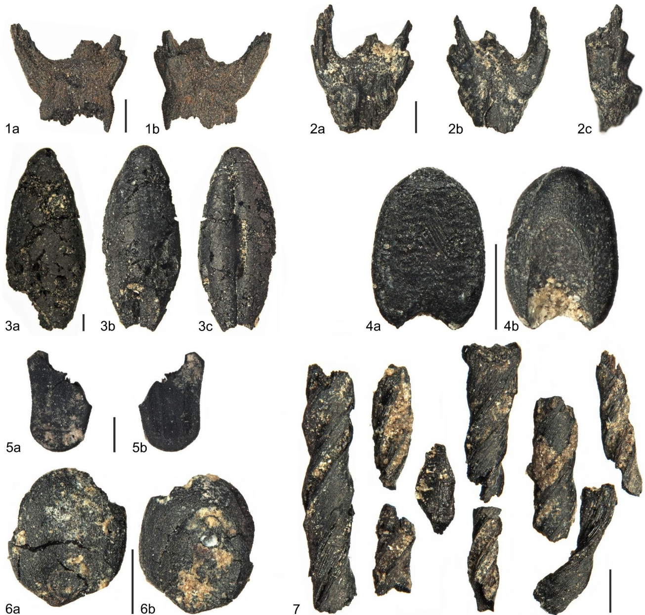
Fig. 2 Charred remains of cultivated (1–3) and wild (4–6) plants from Kamyane-Zavallia. 1 , spikelet base of Triticum monococcum (einkorn); 2 , spikelet base of Triticum sp. (wheat), probably from the lowermost part of the ear; 3 , caryopsis (grain) of Triticum monococcum (einkorn); 4 , caryopsis of Setaria viridis/verticillata (green/bristly fox-

tail), a , ventral view with visible characteristic sculpture left by papillae of palea, b , dorsal view; 5 rachis fragment of Hordeum vulgare (barley); 6 , caryopsis of Echinochloa crus-galli (cockspur), a , ventral view with visible hilum, b , dorsal view; 7 , awn fragments of Stipa sp. (feather grass); scale bars, 0.5 mm