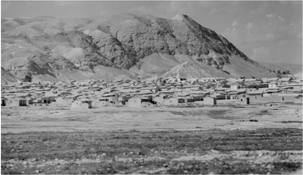
Figure 3. “This refugee camp near the ancient city of Jericho sheltered over 50,000 Palestine refugees in the aftermath of the 1948 Arab-Israeli war. Today, the scene is similar, but the camp is almost deserted – population, 3,700. In the face of the June 1967 hostilities, the refugees fled to east Jordan where they became refugees for the second time in their lives. Although thousands applied for permission to return after the fighting was over, few permits were granted to the inhabitants of the camps near Jericho on the West Bank.”

temporary arrangement pending the implementation of Resolution 194 (III), and more particularly the return of the refugees to their homes, such integration aimed to boost the country’s drive toward institutional and economic development. 17 Jordan was also the only Arab host country that fully supported the ESM works approach and actively engaged UNRWA in the industrial and agricultural development of the country. The creation in 1951 of the Jordan Development Bank that aimed (until 1966–67) to encourage economic development and raise the living conditions of the Jordanians, including the “Jordanians of Palestinian origin,” best illustrates Jordan’s (temporary) assimilationist approach. 18