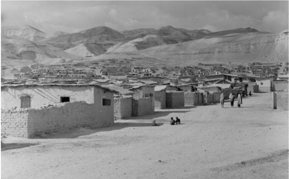
Figure 5. “Aqabat Jaber camp, 1973.”

of the River Jordan, close to the spot where John the Baptist baptized Jesus, Arabs look at a humming little settlement . . . and know that this, on a small scale, is the route they must sooner or later travel. 23