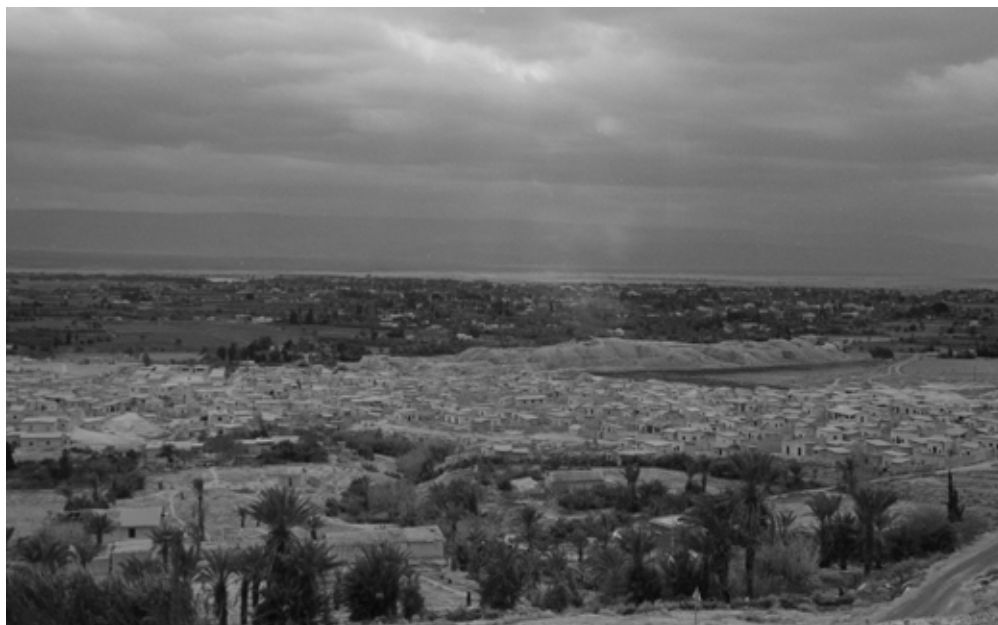
Figure 6. “Refugee conditions, Ein El Sultan, West Bank.”