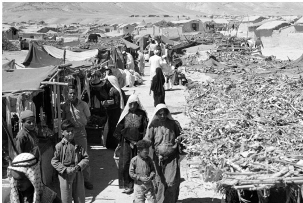
Figure 2. “Aqabat Jaber camp for Palestine refugees near Jericho was once home for 45,000 persons. After the 1967 Arab-Israeli conflict, most inhabitants fled east across the Jordan River. Today, only 2,700 remain in the camp.” © UNRWA photo, undated.

advisor to the ICRC put it, “immense education efforts amongst refugees”; beyond relief, it was crucial “to take advantage of the exile of these uneducated Arabs and teach them the basics of cleanness and hygiene, of children’s education, of civic-mindedness and to train cadres amongst the most educated of them.” 14