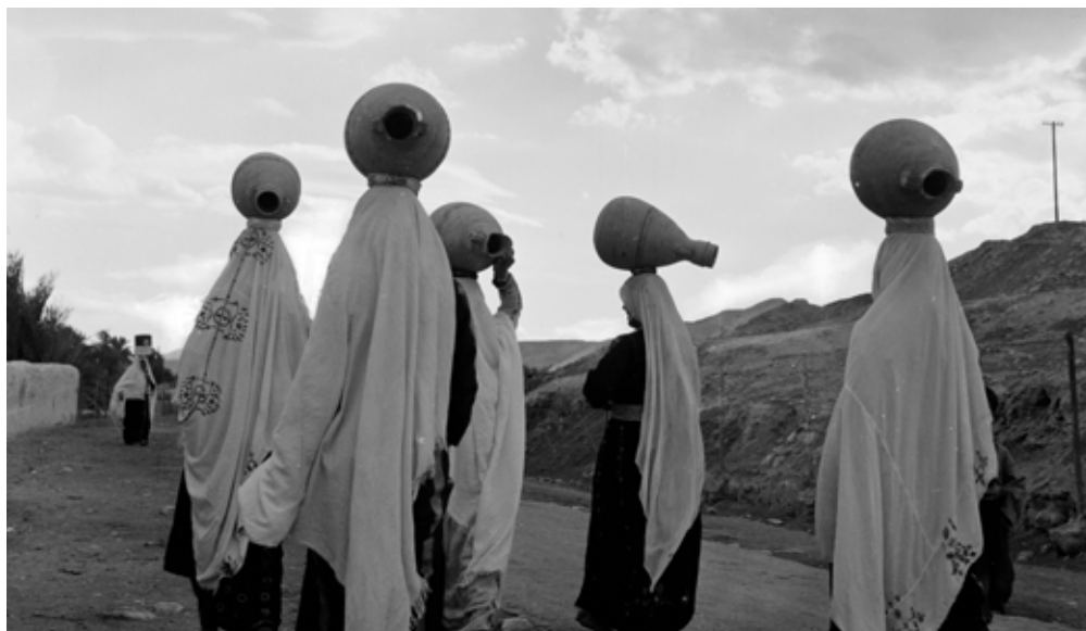
Figure 4. “Every morning and evening these women go to fetch water from Elisha’s fountain [‘Ayn al-Sultan] for their families who live in Aqabat Jaber, which lies in the shadow of the mount of temptation near Jericho. Displaced from their homes in Palestine in 1948, a large number of refugees stayed here in the Jordan valley because of its many springs which provide them with water. Elisha’s fountain provides water for this camp, as it did for the ancient city of Jericho more than 6,000 years ago. As a result to the 1968 Arab Israeli war, only 2,273 persons out of 52,000 remain in the three camps in Jericho, most of them concentrated [across] the Jordan River into east Jordan.”

Unfortunately, when the ESM toured the region in September 1949, the ADS was still struggling to pump sufficient water suitable for irrigation. Its hydrological experts rapidly concluded that the project was not promising and did not select it as suitable for international support. 21 Suspecting that the ESM decision reflected less on any technical concerns than on the aim of Western powers to resettle the refugees as far as possible from the borders with Israel, the ADS continued to pursue its pumping efforts. 22 These eventually came to fruition in January 1950: irrigation water was found in sufficient quantity and the construction of the farm began. Echoing the ICRC grand narrative of social development in situ replacing relief as laid out above, the ADS enshrined its project within the regeneration of the Palestinian people as a whole – a regeneration that did not suppress Palestine’s traditional agrarian society, but sought to empower its main actors, the farmers. As the triumphal ADS put it: