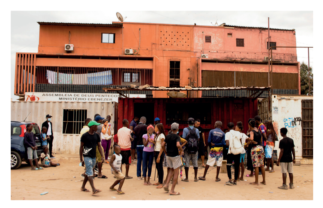
Figure 4: Bungula Street Session, Bairro Operário, September 11, 2021. Photographer: Manetov.

General view of the concert given in Bairro Operário, a central neighbourhood known for being the birthplace of many freedom fighters in the 1950s to 1970s. This time, Faradai and his crew had negotiated with the owner of the red container to use the space in front of what is in fact a small bar. The white container on the left holds the sign of a Pentecostal church. On this day the crowd was much smaller, probably making my presence more visible than in Figure 1.