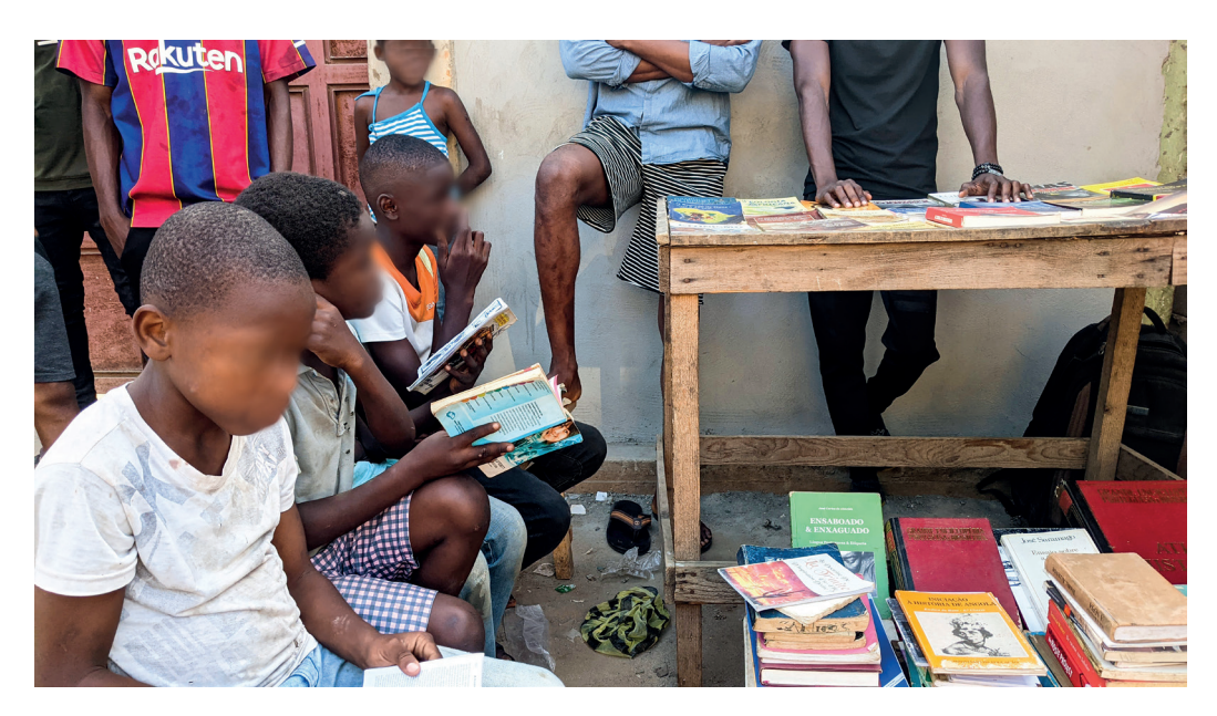
Figure 6: Bungula Street Session, Cacuaco, October 2, 2021.

This picture (Figure 6) was also taken in Cacuaco but during a different session from that held under the bus shelters presented above. This time, the Vosi Yetu Project partnered with Projecto Agir, a local organisation focusing on popular education and political mobilisation outside political parties. Amongst its tools, Projecto Agir has developed an itinerant library. The participation of Projecto Agir could be one of the reasons why the audience on this day was made up mostly of children, many of the members of Projecto Agir being teachers in local schools.