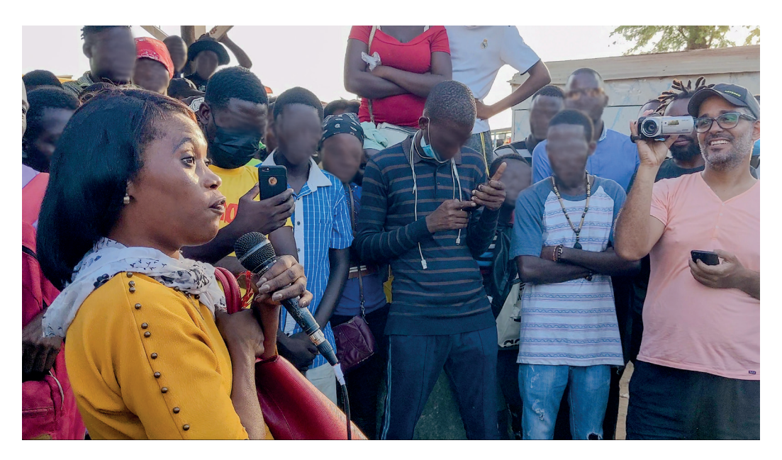
Figure 9: Ikonoklasta films the crowd, Cacuaco, November 20, 2021. Screenshot.