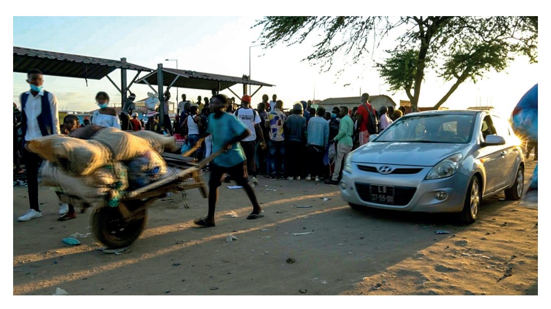
Figure 3: Bungula Street Session, Cacuaco, November 20, 2021.

Same place as in Figures 1 and 2. Street life continued as the concert was going on. Vehicles navigated the road between the improvised stage and the nearby shops, as visible in Figure 1