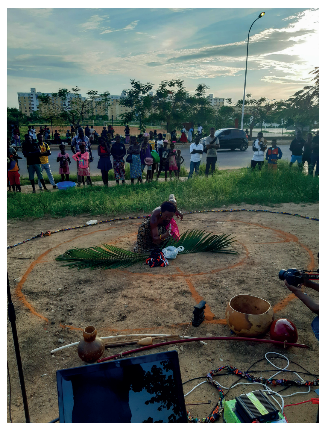
Figure 7: Performance by Cabuenha, February 2020, Sequele.

a spectacle and reveals its carnivalesque potential when all those taking part in it eventually claim the moment as their own and attempt to capture that glimpse of "popular power" that is a mark of carnivals (Averill 1994, 244).