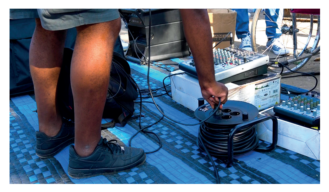
Figure 5: Bungula Street Session, Cacuaco, November 20, 2021. Detail of the electrical installation in Cacuaco.

Every month, the Bungula Street Session was organised in a different neighbourhood. The exact spot was chosen so as to accommodate a public that could vary between a few dozens to about one hundred participants. The main difficulty was the access to electricity, essential for the musical instruments. On the day in Cacuaco, a cable was pulled from a nearby shop. The shopkeeper received a small sum in compensation. A few meters away, another shopkeeper was in a discussion with Ikonoklasta about the musicians' cars that were parked in front of his shop. The rapper laughed the complaint away with the argument that the road belongs to everyone, which is, in fact, the very essence of the Vosi Yetu Project. In our conversation afterwards, Faradai acknowledged that the only time they were stopped from performing was not because of police interference but because members of the local MPLA branch forbade anyone in the vicinity to provide them with electricity.