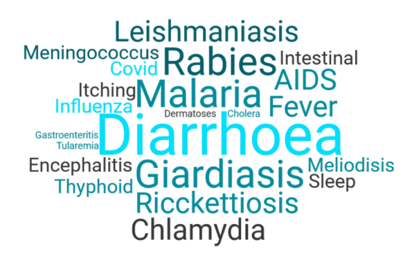
Figure 1. Word cloud of the main occurrences recorded.

The most common category of references explores the relationship between backpackers and health, often framing backpackers as a population at risk. This question appears in many studies on the incidence of diseases affecting tourists. The word cloud shown here (figure 1) reflects the frequency of references related to various diseases. The most frequently mentioned (13 times) is traveller's diarrhoea (turista), but there are also numerous studies on parasitic infections (6), malaria (5), sexually transmitted infections (STIs) (4), rabies, and hepatitis (3).