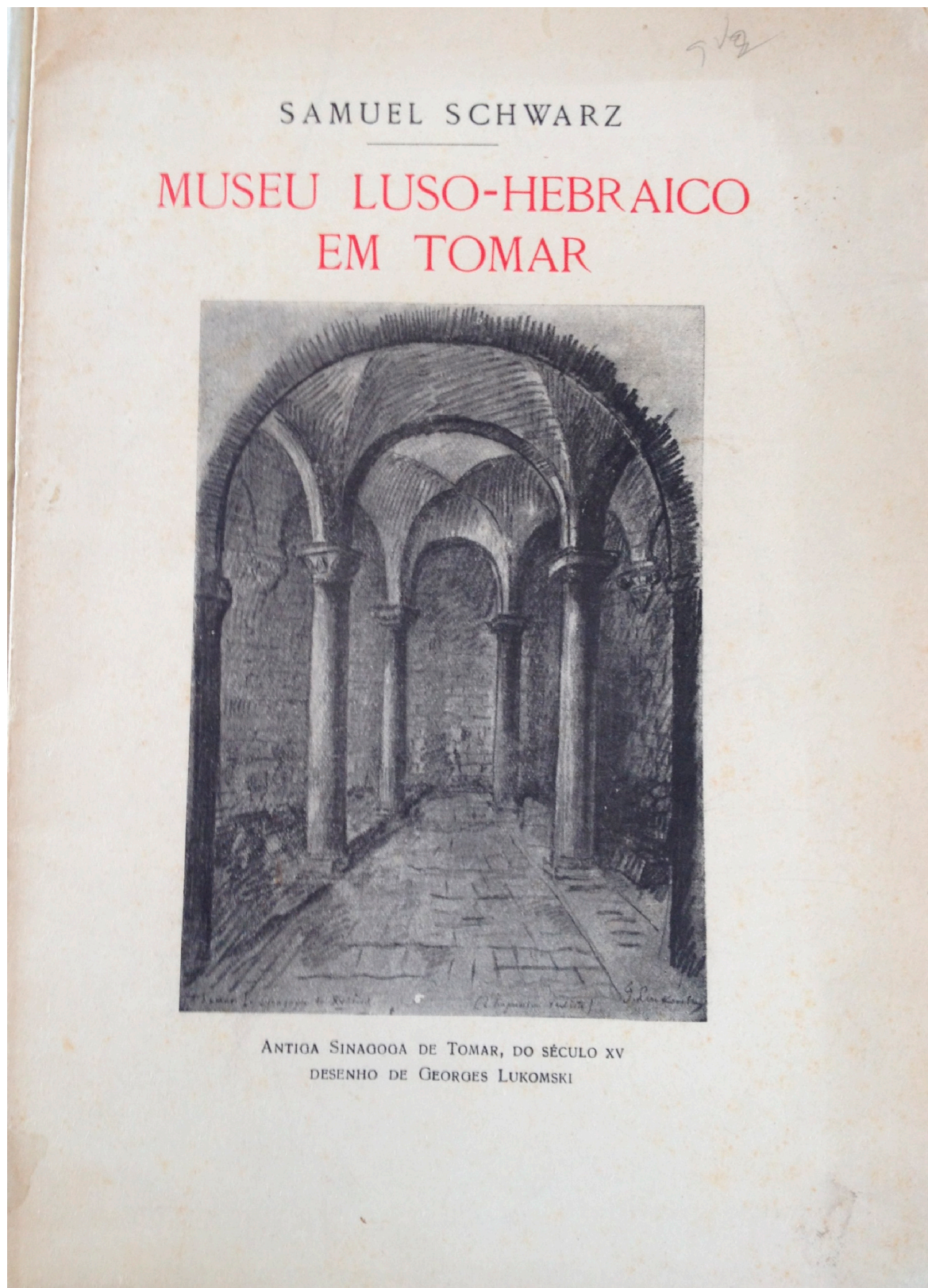
Figure 3. Front page of the Samuel Schwarz museum project, 1939.