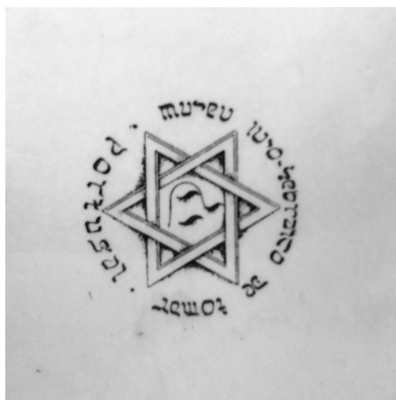
Figure 8. Museum logo, with the Sefardic letter at the center, c. 1940.

After identifying a letter that recurred on several of the stones but is not part of the Hebrew alphabet, the museum team developed an additional strategy to highlight the inscribed letters. Schwarz interpreted this enigmatic character as a representation of the unspeakable name of God in the Jewish Portuguese tradition, and it was rapidly chosen as the museum logo (Figure 8) and was reproduced on publications and promotional documents. Santos Simões contacted the director of medieval synagogues in the Spanish city of Toledo, 4 which had similarly been transformed into national monuments and museums in the early twentieth century (see Flesler and Melgosa 2020, pp. 141–96). The director informed him that the mysterious ideogram had also been found in Spain, further evidence that it had served as a respectful reference to God in the wider Sephardi community.