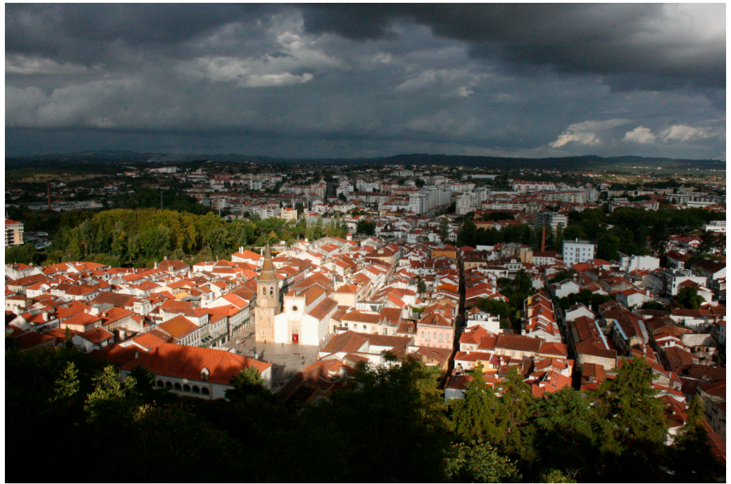
Figure 2. View of the Tomar old town from the Convent, 2016, photo by the author.

During the same period, Schwarz was working on other vestiges of Portuguese Judaism, including medieval Hebrew epigraphy that he tracked down throughout the country (Schwarz 1923), manuscripts, and incunabula dealing with Portuguese Jews (Andrade and Caramelo 2018). He also documented the religious survival of the Marranos (or Crypto-Jews), whose traces he discovered over four centuries after their forced conversion in the fifteenth century (Schwarz 1925). In the late 1920s, the fourfold unearthing of the Jewish past was launched from one end of the country to the other, bringing a number of religious artifacts into the scientific, cultural, and political spotlight. Findings included medieval lapidary fragments, books and manuscripts in Hebrew, and rites and traditions of the secret Jews in the Beira Baixa, as well as the Tomar synagogue, an extraordinarily well-preserved medieval place of worship in the middle of the country.