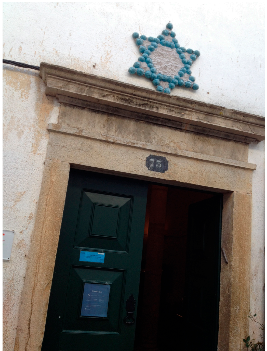
Figure 1. Entry door of the synagogue, Tomar, 2014, photo by the author.

fabled era of serene coexistence between Jews, Muslims, and Christians, often called convivencia (Cohen 1994; Menocal 2002). In addition to the building's architecture, visitors can examine a series of stones bearing Hebrew script, most of them tombstones rescued from archaeological sites and local museum collections throughout Portugal. The epigraphic collection testimonies to the Jewish presence in Portugal since early medieval times. Groups of Jewish tourists occasionally pray inside the synagogue, although it is primarily viewed as a historic landmark for Jewish roots tourism or for visitors in search of significant sites in the city. The Tomar synagogue thus functions primarily as a place of memory (Nora 1989) recalling the Sephardic past and as a key element of Jewish heritage and cultural tourism in contemporary Portugal, but only rarely as a place of worship.