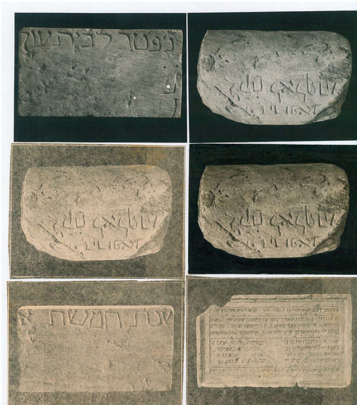
Figure 4. Working photographs of the epigraphic collection, c. 1940, Tomar Municipal Archives, UI 259 Pt 1.