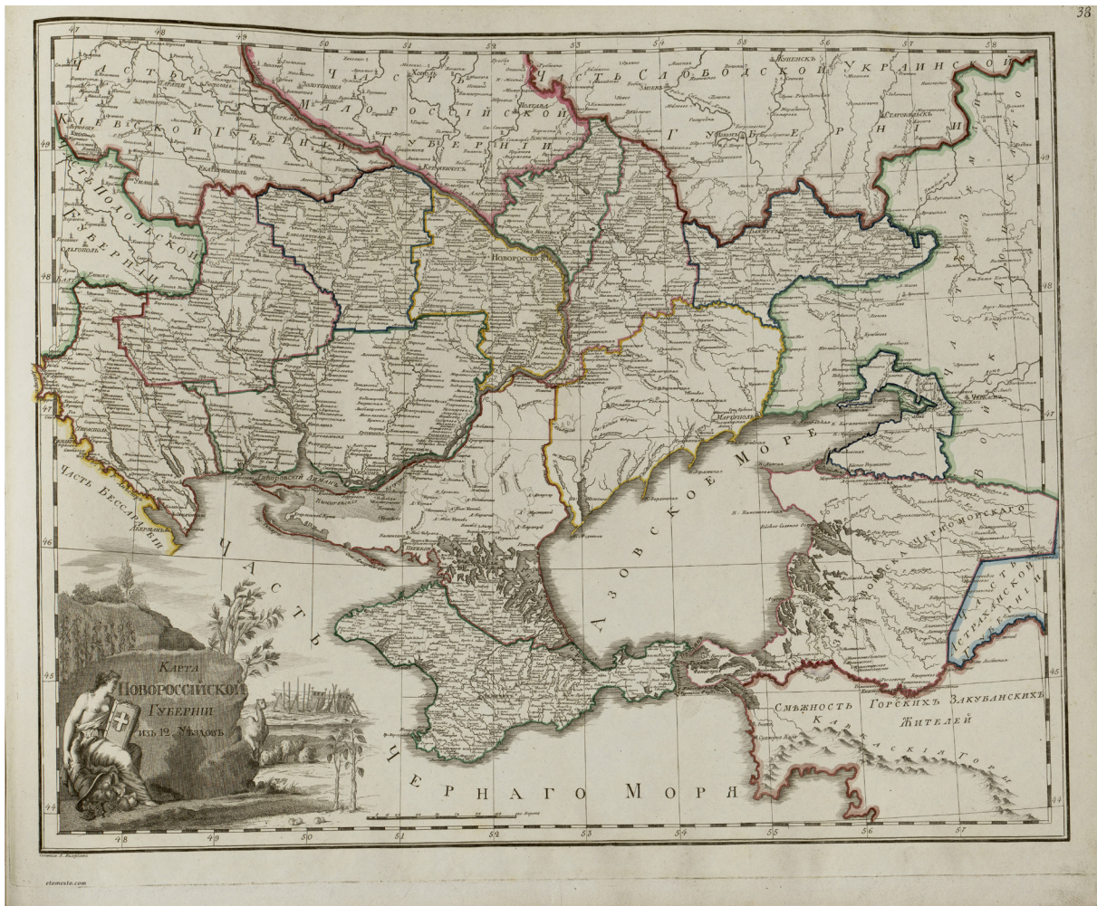
FIGURE 3 MAP OF THE GOVERNORATE OF NEW RUSSIA WITH ITS 12 DISTRICTS, 1800