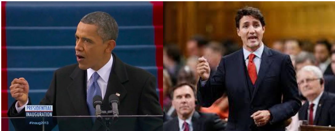
Figure 4: Illustrations of thumb pointing