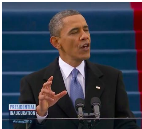
Figure 7: Metaphoric gesture