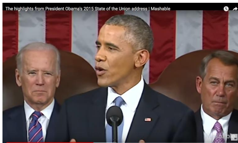
Figure 1: Medium close-up framing

Political speeches are often filmed with a fairly close framing that leaves most of the hand gestures out (medium close-up framing; cf. Figure 1). If a recording with a larger framing is available (medium shot, from the waist up; cf. Figure 2), it can be preferred so as to capture as many gestures as possible. And yet, if only close-up framings are available, they are of course relevant for multimodal analysis as well. Indeed, political orators are often used to medium close-up framings and adapt by relying mostly on gestures that are visible on camera, such as facial expressions, head and shoulder movements, and hand gestures with a small amplitude or realised in the visible part of the gesture space.