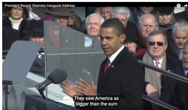
Figure 3: Sideways angle with high desk

A recording that faces the speaker should be preferred to one with a camera positioned sideways. And yet, if the speaker is positioned behind a high reading desk, gestures might be partly hidden behind it. In that case, if a recording with a sideways camera angle is available, it can be preferred so as to capture more of the speaker's hand gestures (cf. Figure 3).