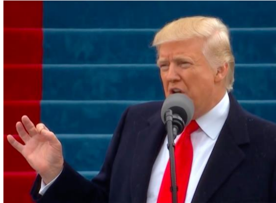
Figure 6: Precision grip

Figure 6 illustrates the ‘precision grip’ (Kendon 2004), a recurrent gesture whose core meaning is the expression of a precise, specific idea. Figure 7 is a typical example of a metaphoric gesture: the speaker is talking about an abstract referent, the topic of ‘values’, while representing this referent as a concrete object that can be manipulated — see also Streeck (2008) on speech-handling gestures.