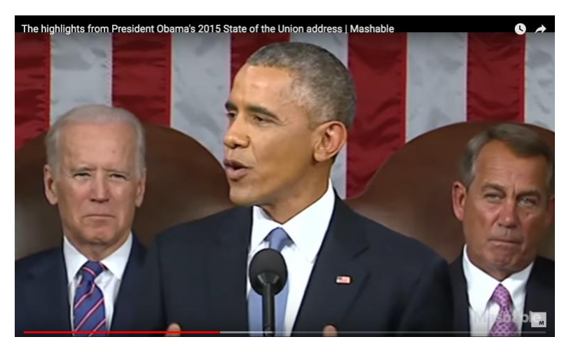
Figure 1: Medium close-up framing

Political speeches are often filmed with a fairly close framing that leaves most of the hand gestures out (medium close-up framing; cf. Figure 1). If a recording with a larger framing is available (medium shot, from the waist up; cf. Figure 2), it can be preferred so as to capture as many gestures as possible. And yet, if only close-up framings are available, they are of course relevant for multimodal analysis as well. Indeed, political orators are often used to medium close-up framings and adapt by relying mostly on gestures that are visible on camera, such as facial expressions, head and shoulder movements, and hand gestures with a small amplitude or realised in the visible part of the gesture space.