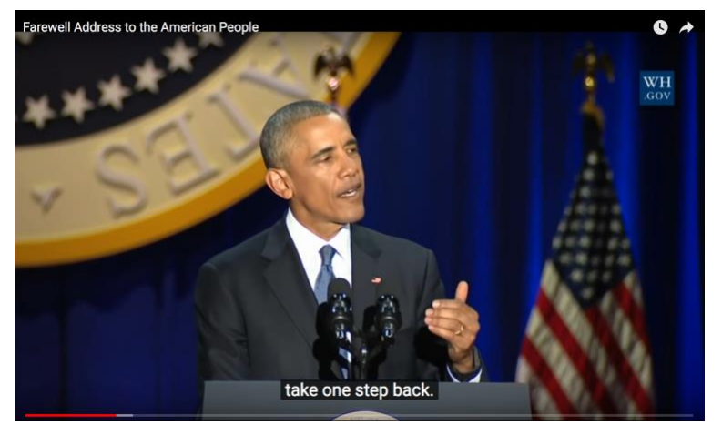
Figure 2: Medium shot framing