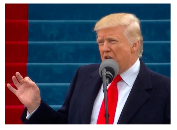
Figure 6: Precision grip

Figure 6 illustrates the 'precision grip' (Kendon 2004), a recurrent gesture whose core meaning is the expression of a precise, specific idea. Figure 7 is a typical example of a metaphoric gesture: the speaker is talking about an abstract referent, the topic of 'values', while representing this referent as a concrete object that can be manipulated — see also Streeck (2008) on speech-handling gestures.