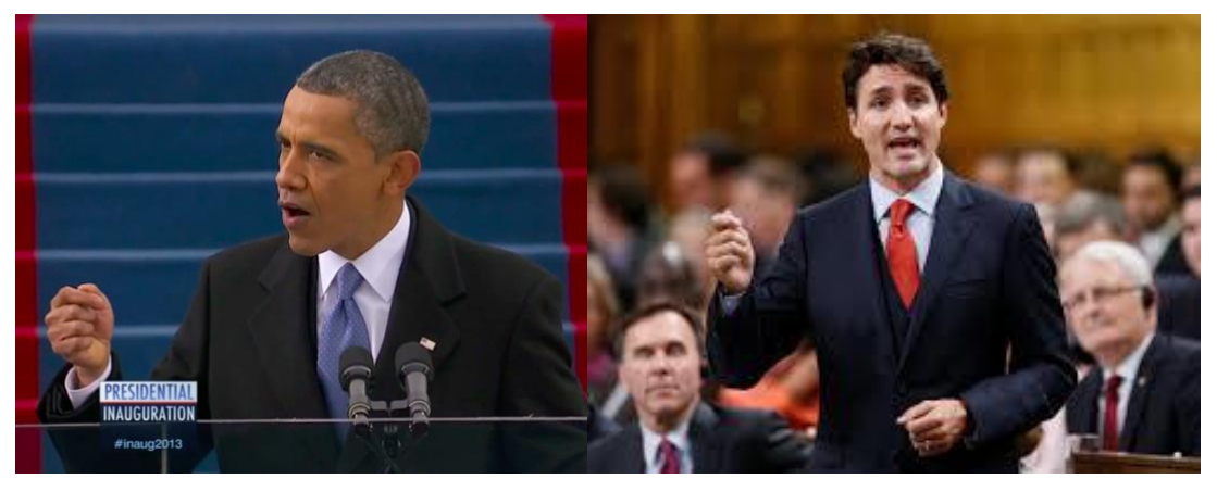
Figure 4: Illustrations of thumb pointing