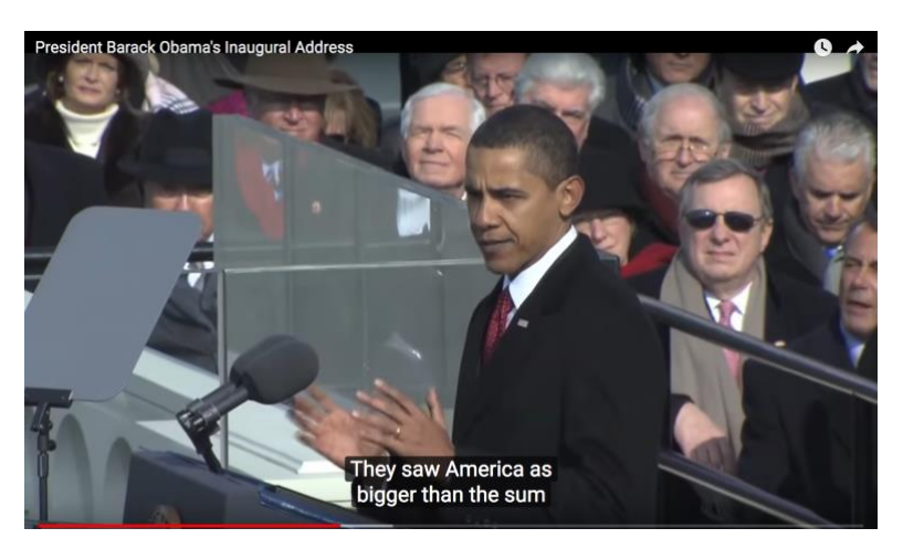
Figure 3: Sideways angle with high desk

A recording that faces the speaker should be preferred to one with a camera positioned sideways. And yet, if the speaker is positioned behind a high reading desk, gestures might be partly hidden behind it. In that case, if a recording with a sideways camera angle is available, it can be preferred so as to capture more of the speaker's hand gestures (cf. Figure 3).