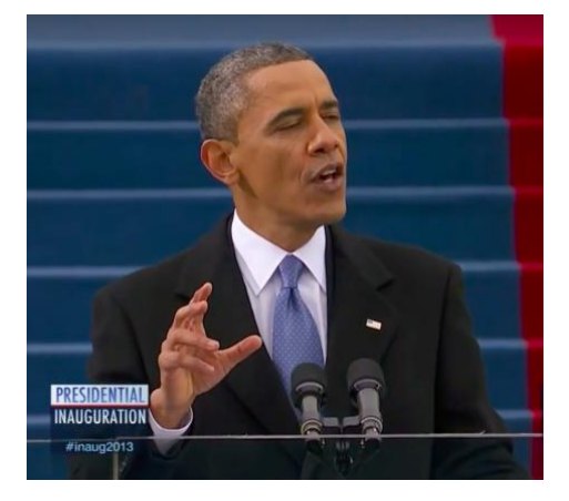
Figure 7: Metaphoric gesture