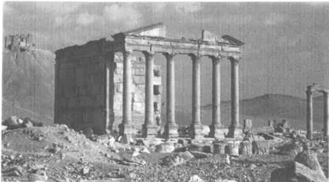
Fig. 2. Temple-tomb no. 86, view of façade (J.-B. Yon).

cerned not only the religious world, but also owed much to methods common in cities elsewhere in the Roman empire.