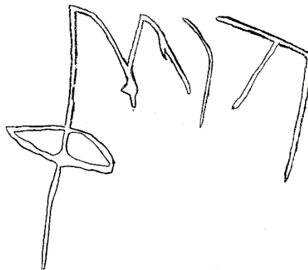
Figure 1 – Armazian inscription engraved on a wall in Armazi acropolis (Baginet’i) 26

Among the Aramaic inscriptions found on the ancient acropolis of the Iberian kings, one of them particularly draws the attention. It is a few words carved on a stone from a wall of the hill of Baginet’i (figure 1). The photography of this epigraphic document was published by Giorgi Ceret’eli, without a translation being proposed so far. It is possible to read the letters ḵrḥ p (כִּרְח פּ), which can be developed ( ḵrḥ(h) p(hnt) ), which can be translated: “here (the store of) the citadel” 27 . This would testify the importance of the royal warehouses for the storage of foodstuffs, weapons and artifacts necessary for the life of the court and the defence of the acropolis. Unfortunately, Giorgi Ceret’eli does not specify the context of the discovery of this inscription or even its exact location on the site of