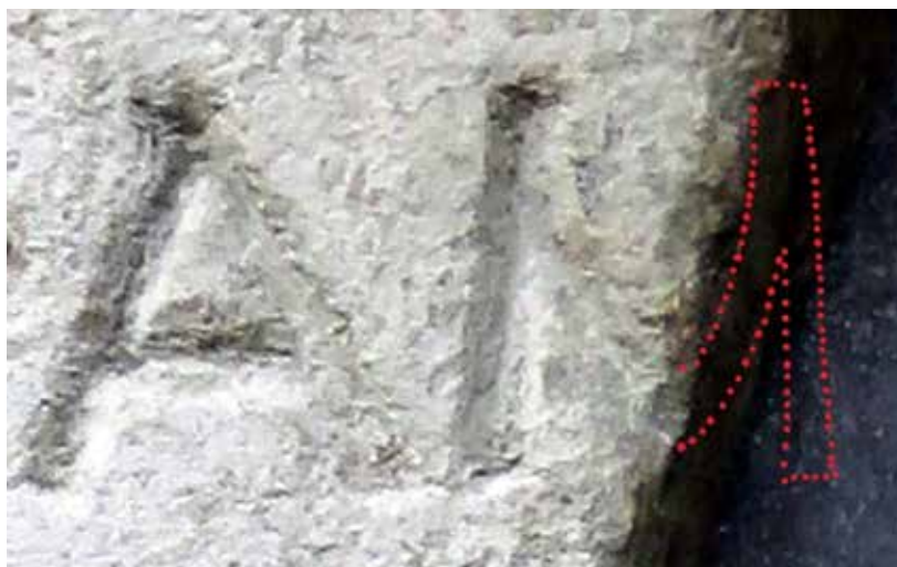
Figure 1 – Reconstitution of the damaged M in the second line

The third line has subsisted poorly by five letters divided into two words by a separating point, which was made invisible by the damage on the stone but whose presence is still discernable with the little interval between the sigma and the beta. T'inat'in Qauxč'išvili, who had read the name "Anagranes" in the precedent line, chooses logically to reconstitutes the missing word as [τροφ]εὺς, but providing no reconstitution for the following letters. It could be possible without certainty that line 3 indicates a tropheus , that is to say a foster father or a tutor in charge of educating a member of the royal family 9 . His name is not Anagranes, because the beginning of the word on the preceding line shall be read as AM, while first following letters after EYΣ appear quite clearly as a B and an O. This truncated name Bo-, being probably of an Iranian origin, leaves open various hypotheses of reconstitution: Boes, Bodes, Bochres, Boraspos, Bordanes, Borzos, Bostagon, Boubakes, Boubares, and others 10 . An interesting possibility would be to imagine a Greek name equivalent to the Iranian name Buzmihr, which refers to the pitiaxēs mentioned in a dish from Bori dated to the third century CE 11 .