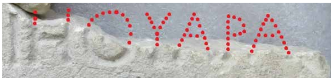
Figure 2 – Possible reconstitution of the damaged letters in the fifth line

With Oulpia Naxia, Aurelie Vara would be one of the Iberian queens whose name contains two components, including an imperial gentile name and a nickname 21 . Obviously, the family of Aurelie had woven political links with the Antonine dynasty. The sixth line clearly indicates the relationship of Aurelie, designated as the daughter of an Iberian dignitary, probably a king, but not necessarily Amaspos the Great. A gap unfortunately prevents us from knowing surely if θυγάτηρ was effectively