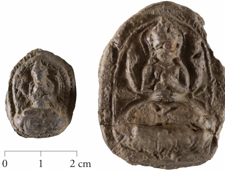
Fig. 13: The two tsha tshas that were analysed (no. 1, left, and no. 2, right). Uncooked clay.