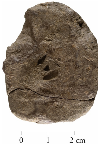
Fig. 14: Tsha tsha no. 2. View of the back.