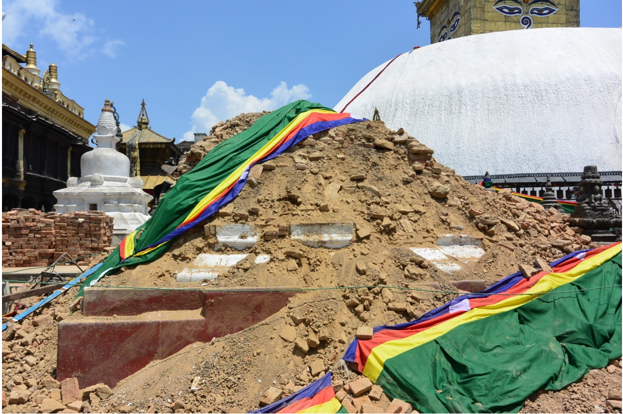
Fig. 3: Mañgal Bahudvāra Caitya after the earthquake, on 2 May 2015. View from the south.