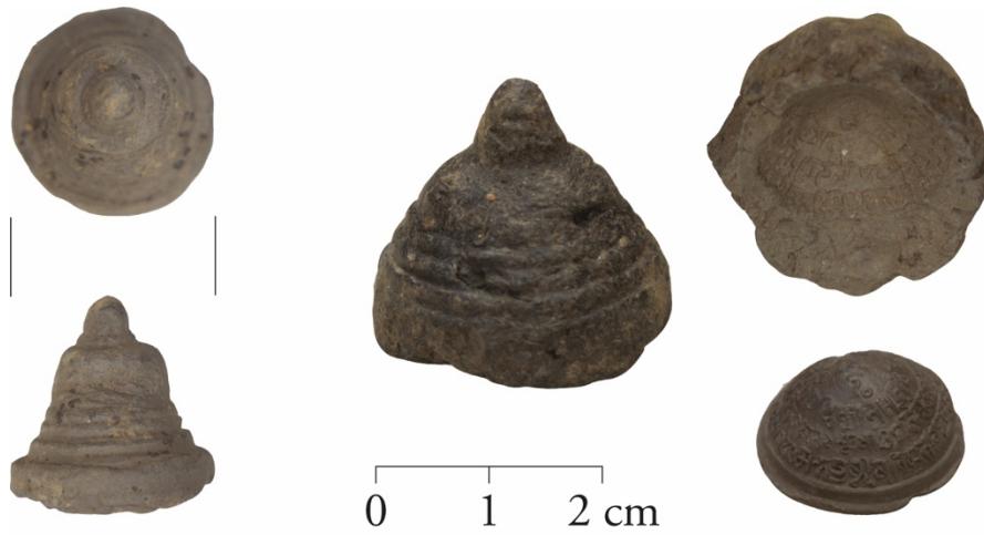
Fig. 10: Tsha tshas type 1 and 4 (left and right), the most encountered ones at MBC. Type 4 contains inscribed dhāraṇīs .