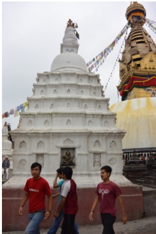
Fig. 1: The Maṅgal Bahudvāra Caitya, or Tashi Gomang Stūpa, in 2013. View from the south.

The magnitude 8.1 “Gorkha Earthquake” that hit Nepal on 25 th April 2015 caused severe human and material damages in the country’s central part. Thousands of historic monuments, particularly within the Kathmandu Valley’s seven World Heritage Monument Zones, were affected. Svayambhū, a central place of devotion for Buddhists and Hindus of Nepal, India and Tibet, lost many priceless buildings. Among them is the Maṅgal Bahudvāra Caitya, which collapsed completely (fig. 1 and 3). In charge of the monument’s protection, the author, together with the local community and Nepal’s Department of Archaeology (DoA), decided to excavate the stūpa until a solid level of foundations (that would allow its reconstruction) could be identified. This paper presents some preliminary remarks on clay artefacts (Tib. tsha tsha ) discovered during the protection and excavation campaigns carried on the monument. These objects shed lights on rituals executed during the different construction phases of the structure. They also provide valuable information about the donors’ cultural environment.