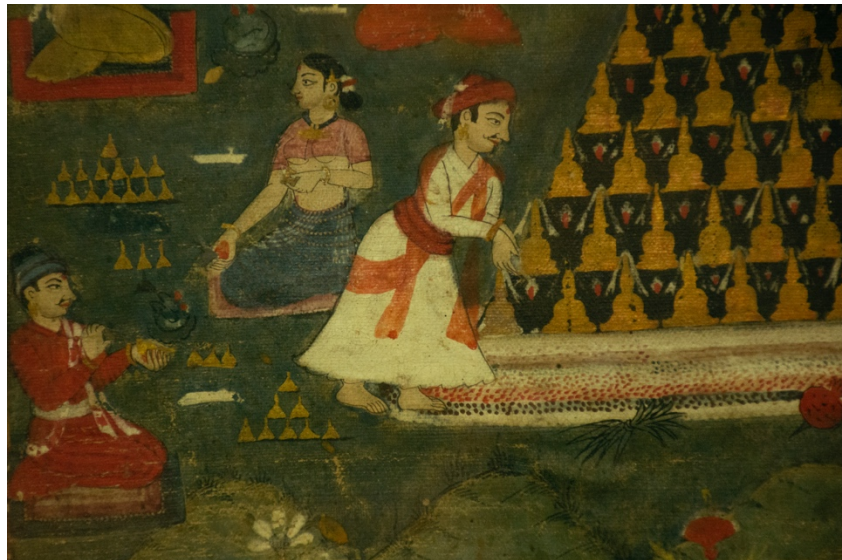
Fig. 12: Moulding and piling of tsha tshas . Detail of a Lakṣacaitya vrata paubha of 1694. Paint on cloth. National Museum, Chhauni, Kathmandu (Inv. No. 17.76.180).