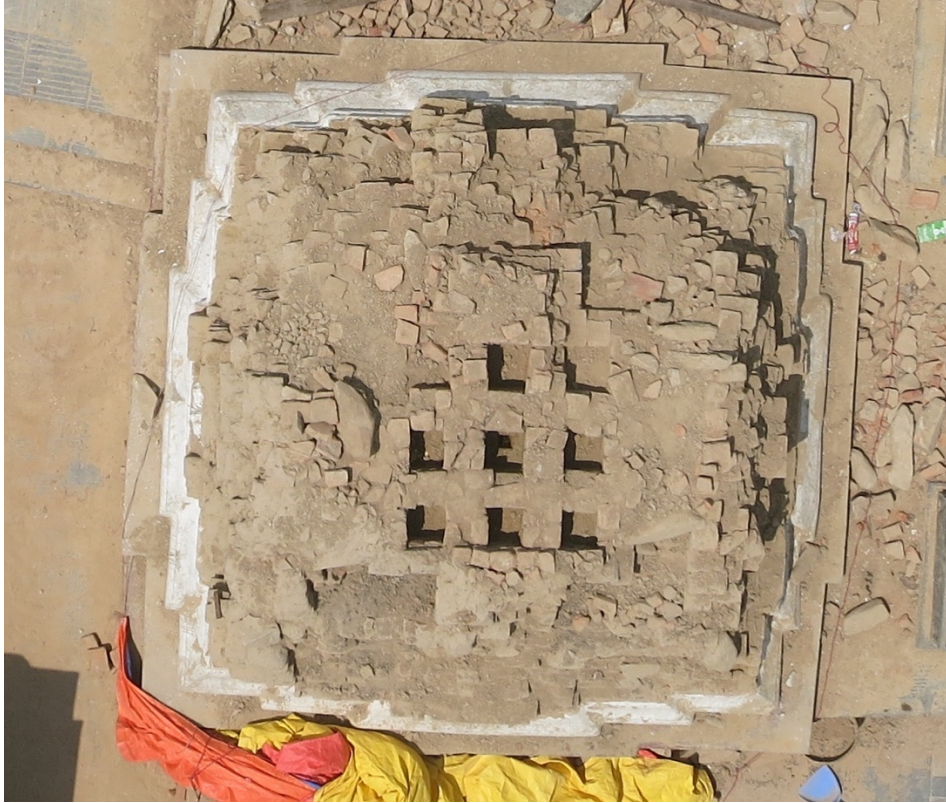
Fig. 7: Aerial view of the nine cavities. The north is on the top.