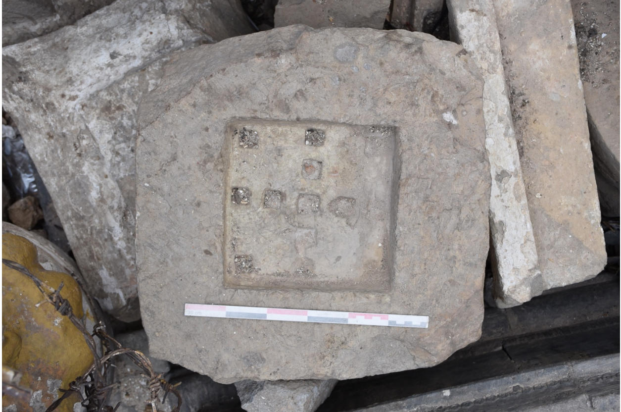
Fig. 5: Deposit stone in which the reliquary casket was set. Found in the rubbles.