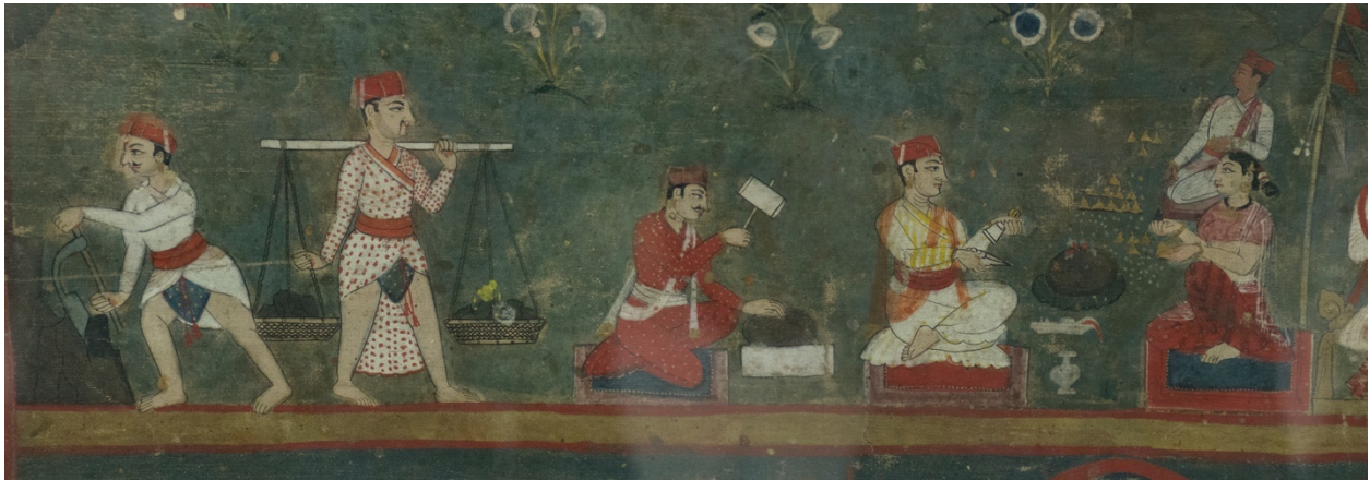
Fig. 11: Preparation of the clay and moulding of tsha tshas by donors during a luchidyah ritual. Detail of a Lakṣacaitya vrata paubha of 1694. Paint on cloth. National Museum, Chhauni, Kathmandu (Inv. No. 17.76.180).