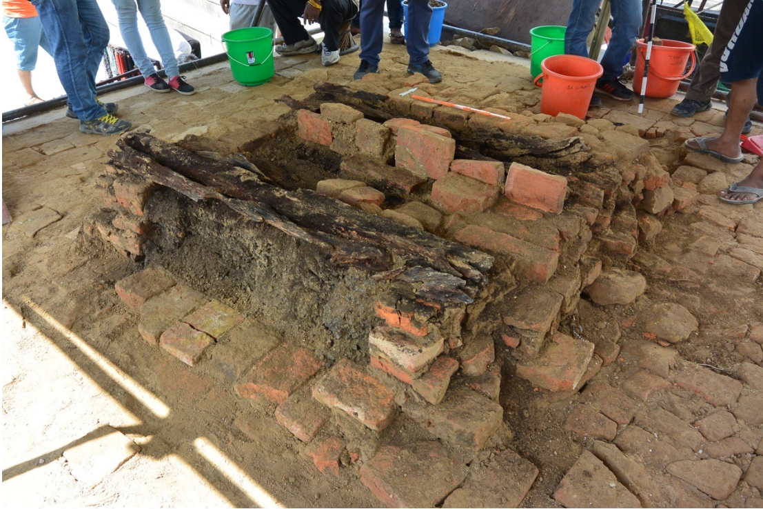
Fig. 9: The five cremated wooden beams. The dark material below the beams is entirely composed of tsha tshas . View towards the north-west.