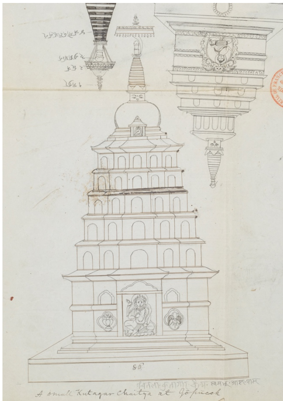
Fig. 2: Figure 86 of B. H. Hodgson’s essay. Probably drawn by R. Singh (British Library, IO San 3976f, f.6v.).

“The other modifications (so to speak) of the Chaitya model, as shown in the drawings, result from the blending of the solid structure with others of a wholly different and chambered kind; but these chambered additions, when consisting of several stories still show a tendency to the original solid character of the style by having only their basal story hollow.” (Hodgson op. cit. , 117)