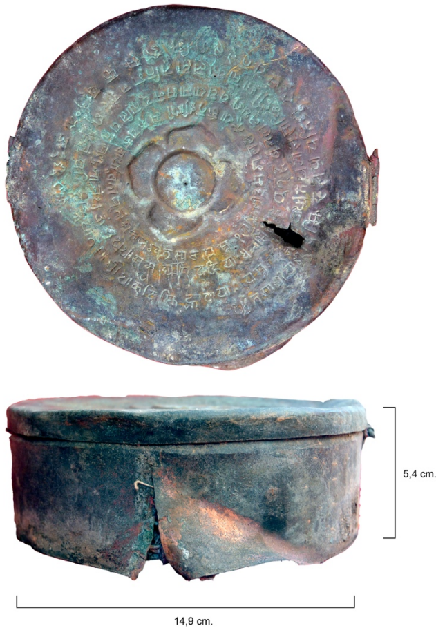
Fig. 4: Reliquary casket containing bones and ashes. 1875. Copper. Found in the rubbles.