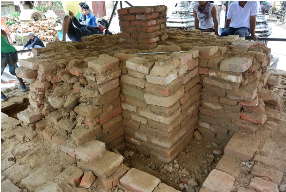
Fig. 8: The maṇḍala structure during its excavation. View towards the north-west.