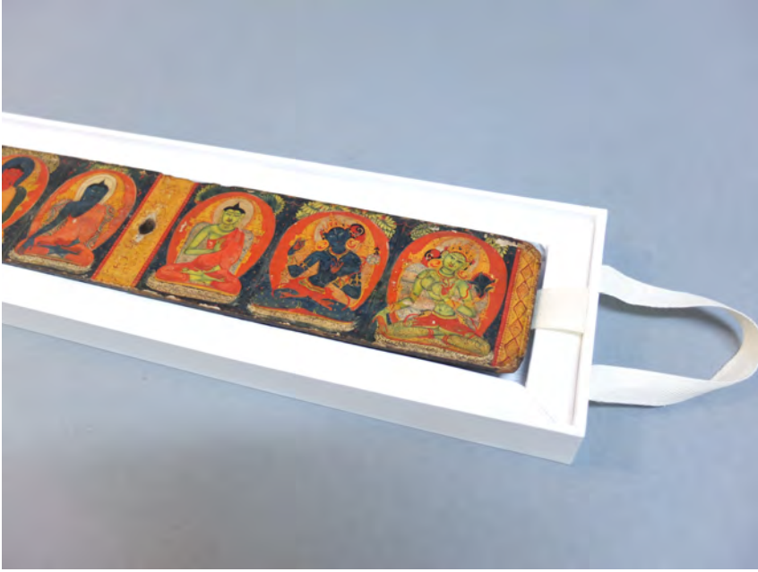
Fig. 306. Packaging, one of the wooden board cradle.

lections featuring a controlled environment (temperature: 18/19°C, relative humidity: 50% [ \pm 5\% ]).