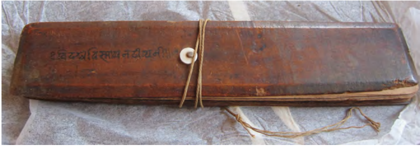
Fig. 292. CDF, MS.SL.27, Vidagdhavismāpana, Nepal, ca. fifteenth century AD. Closed manuscript protected by wooden boards.

traditions, for large manuscripts using talipot leaves such as MS.SL.68 (55 cm long × 6.7 cm wide), the stability of the manuscript was ensured by two holes and binds placed in the middle of the width and at a third of the length (see Fig. 293).