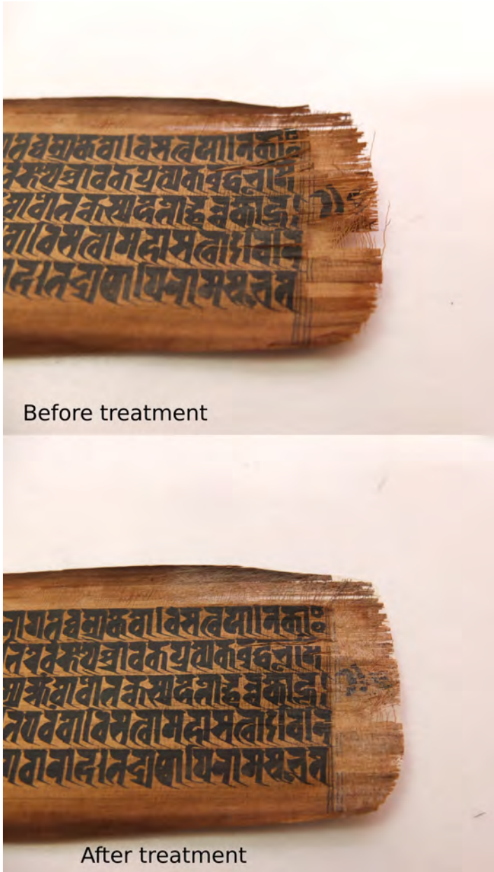
Fig. 303. Treatment of the delaminations, before and after.