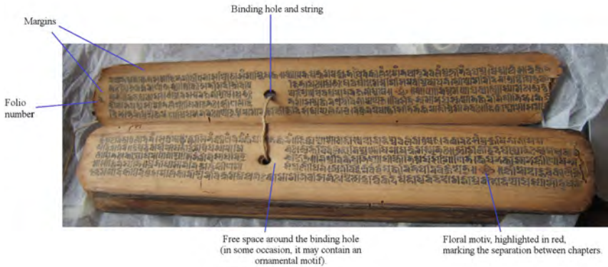
Fig. 291. Paris, Bibliothèque d'études indiennes du Collège de France (CDF), Rim.94, western Bengal (India), nineteenth century AD: Folio n° 3 (verso) and 4 (recto).

India, 17 cow dung, 18 different mixtures of herbs in Indonesia, 19 pineapple leaves along with Beli fruits ( Aegle marmelos ) and paddy in Sri Lanka. 20