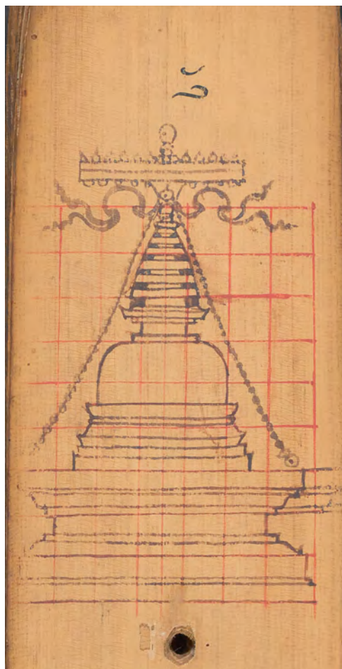
Fig. 297. Detail of Paris, CDE, MS.SL.27 Vidagdhavismāpana: depiction of a Buddhist monument (stūpa).