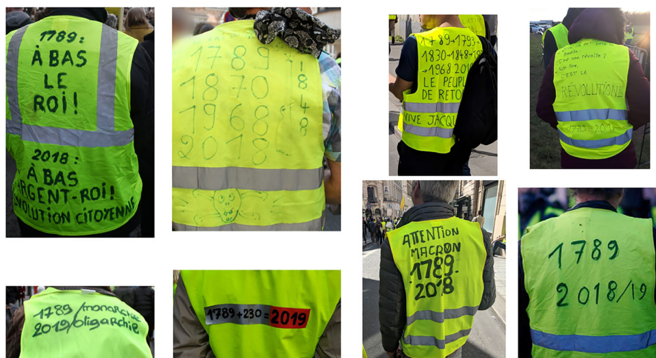
FIGURE 2 Revolutionary years. [Colour figure can be viewed at wileyonlinelibrary.com ]

explanations: “1789: down with the King! 2018: Down with the Money-King! Citizen Revolution!”, “1789/monarchy 2019/oligarchy”, “Warning to Macron 1789–2018”, “Sire, they have taken the Bastille.—Is it a revolt?—No, Sire, it is the Revolution!!! 1789–2019”. In some cases, there were intermediary dates, as if the Yellow Vests were picking up and continuing an interrupted history, started in 1789—because there was never, to my knowledge, an earlier date written 14 : “1789 > 1793 > 1830 > 1848 > 1871 > 1968 > 2018 The people is back”; “The people’s cry 1789 1870 1968 2018 / 1848” (Figure 2).