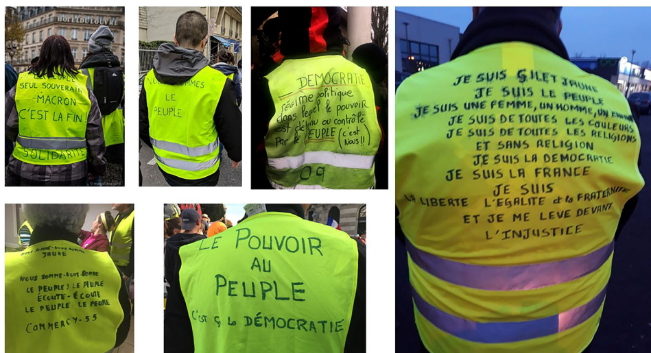
FIGURE 1 The sovereign people. [Colour figure can be viewed at wileyonlinelibrary.com ]

“crowds and informal assemblies” (Frank, 2021, pp. 25–27). It is a form of democratic representation, but one which reveals its fundamentally aporetic character: the impossibility for any representative claim to fully represent the represented, and thus the necessity for the people to manifest themselves on occasion. And when they do, in the streets or popular assemblies, “they at once claim to represent the people while also signaling the material plenitude beyond any representational claim,” they “make manifest that which escapes representational capture” (Frank, 2021, p. 11). They must appear as the represented, whose mere presence shows that their institutional representation is not enough to represent them entirely, and thus forces representatives to hear the sovereign people they are supposed to represent.