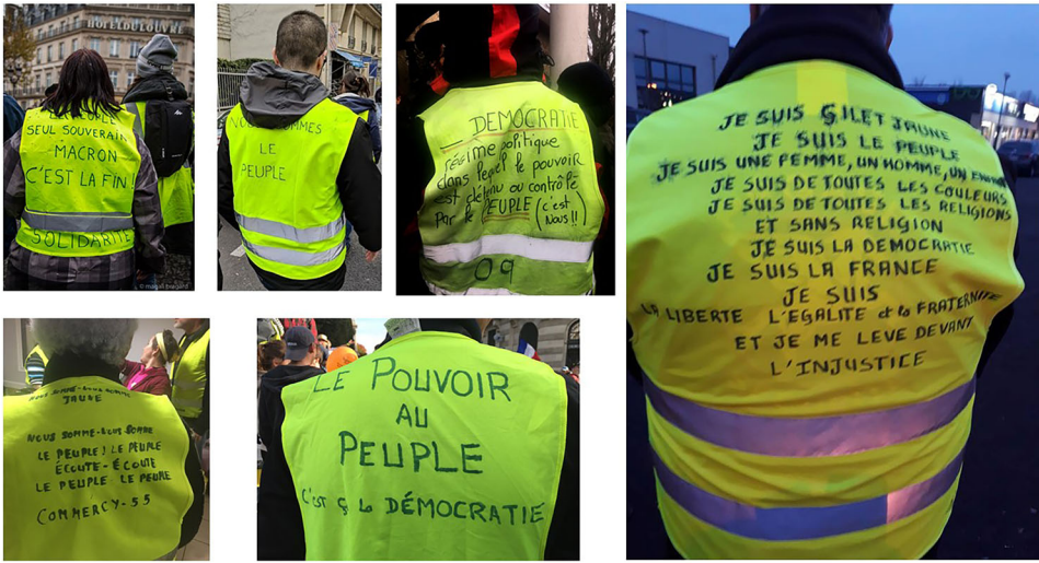
FIGURE 1 The sovereign people. [Colour figure can be viewed at wileyonlinelibrary.com ]

“crowds and informal assemblies” (Frank, 2021, pp. 25–27). It is a form of democratic representation, but one which reveals its fundamentally aporetic character: the impossibility for any representative claim to fully represent the represented, and thus the necessity for the people to manifest themselves on occasion. And when they do, in the streets or popular assemblies, “they at once claim to represent the people while also signaling the material plenitude beyond any representational claim,” they “make manifest that which escapes representational capture” (Frank, 2021, p. 11). They must appear as the represented, whose mere presence shows that their institutional representation is not enough to represent them entirely, and thus forces representatives to hear the sovereign people they are supposed to represent.