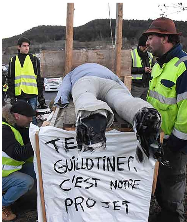
FIGURE 6 “Guillotining you is our project.” 15 [Colour figure can be viewed at wileyonlinelibrary.com ]

This use of revolutionary imagery of the guillotine was not limited to the back of the vests. On many roundabouts, a guillotine was built, and sometimes mock executions were staged (Figure 6). Historian Nathalie Alzas has shown how these executions were part of a long history of carnivalesque practices, where effigies of authority figures such as ministers were symbolically ridiculed, injured, or even killed; yet guillotines were almost never used in these demonstrations, and “direct attack on the president of the Republic [was a] rare occurrence” (Alzas, 2019). Simulating the execution of the head of state by guillotine was most likely a first in the history of social movements, yet the scene was repeated on many roundabouts and drawn on many backs of vests.