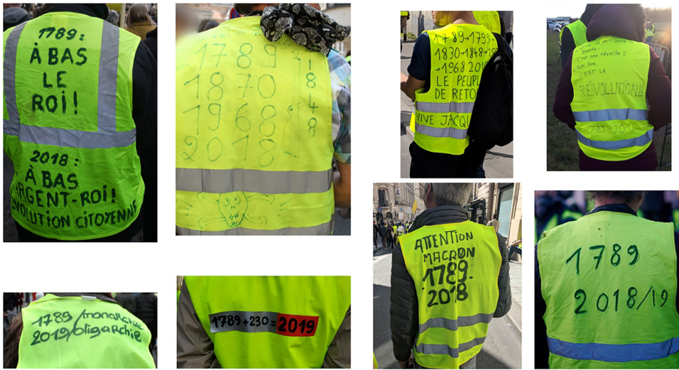
FIGURE 2 Revolutionary years. [Colour figure can be viewed at wileyonlinelibrary.com ]

explanations: “1789: down with the King! 2018: Down with the Money-King! Citizen Revolution!”, “1789/monarchy 2019/oligarchy”, “Warning to Macron 1789–2018”, “Sire, they have taken the Bastille.—Is it a revolt?—No, Sire, it is the Revolution!!! 1789–2019”. In some cases, there were intermediary dates, as if the Yellow Vests were picking up and continuing an interrupted history, started in 1789—because there was never, to my knowledge, an earlier date written 14 : “1789 > 1793 > 1830 > 1848 > 1871 > 1968 > 2018 The people is back”; “The people’s cry 1789 1870 1968 2018 / 1848” (Figure 2).