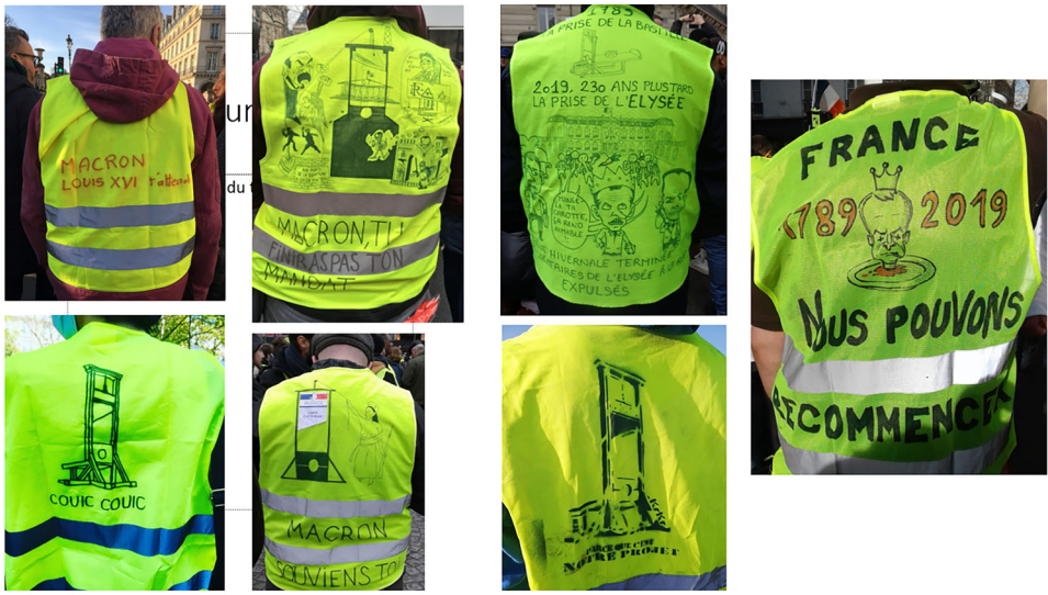
FIGURE 5 Macron and the guillotine. [Colour figure can be viewed at wileyonlinelibrary.com]