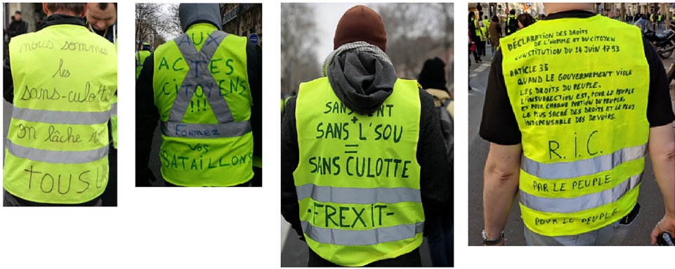
FIGURE 3 The Yellow Vests as sans-culottes. [Colour figure can be viewed at wileyonlinelibrary.com]