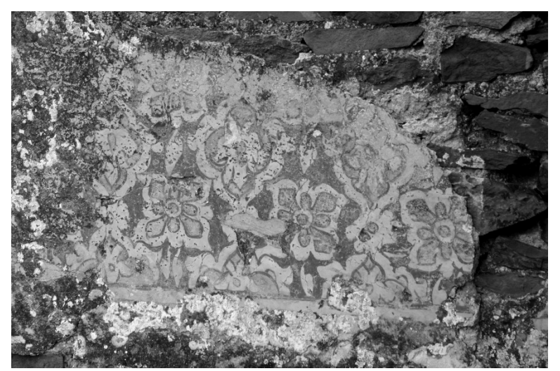
Susinyos Palace (decorated wall)