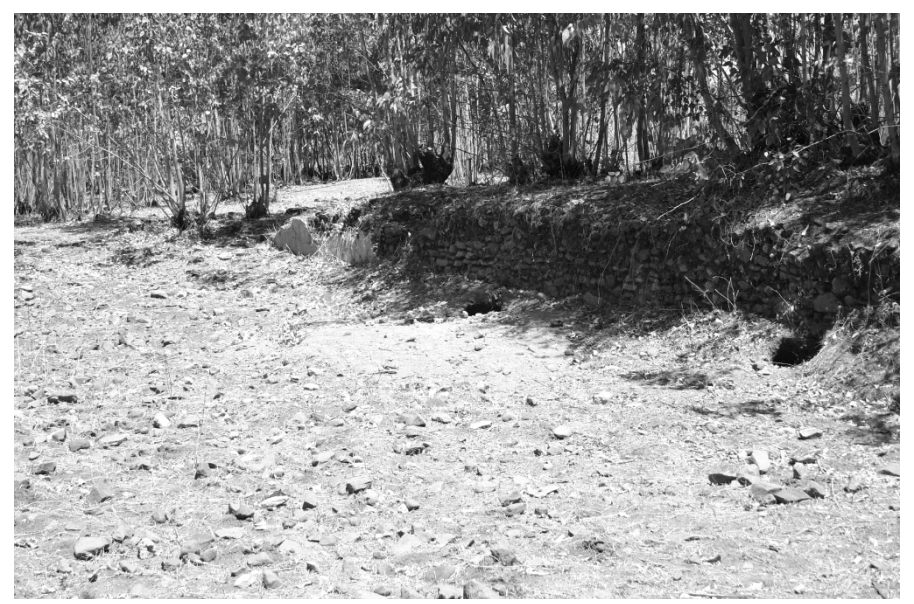
Susinyos bath (interior view)