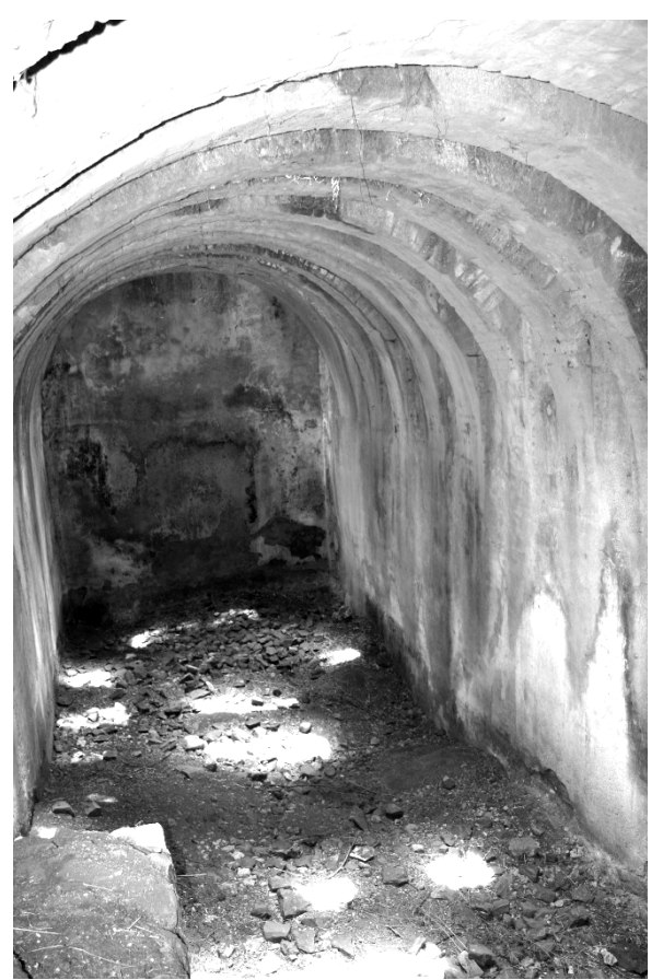
Susinyos Palace (arched cistern)