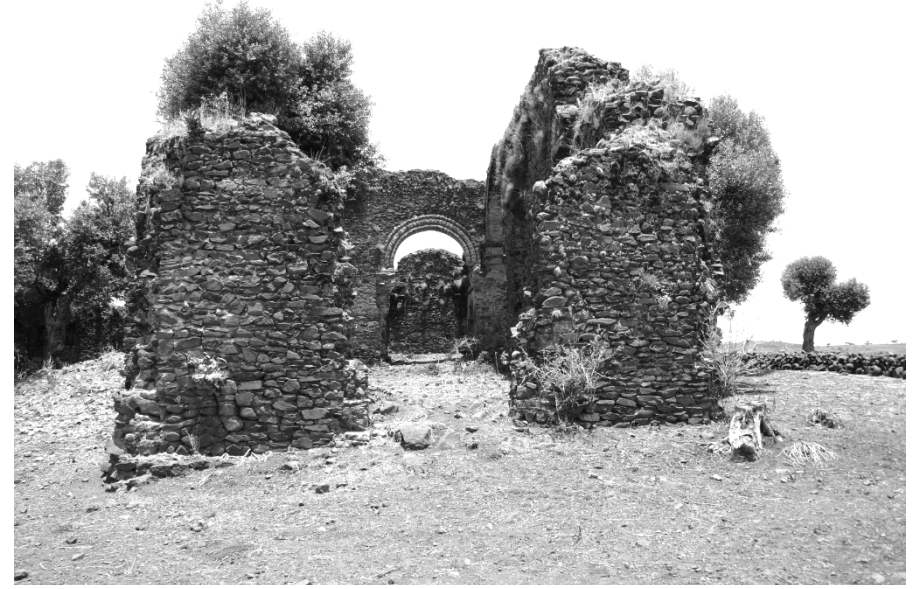
Catholic Cathedral (general view)