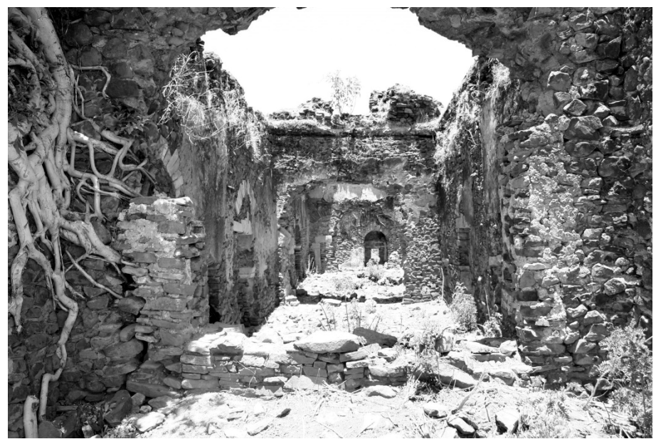
Casa do Patriarca (interior view)