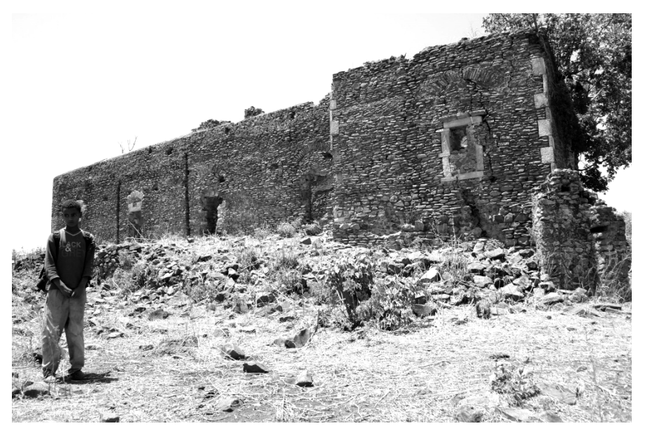
Casa do Patriarca (northern view)