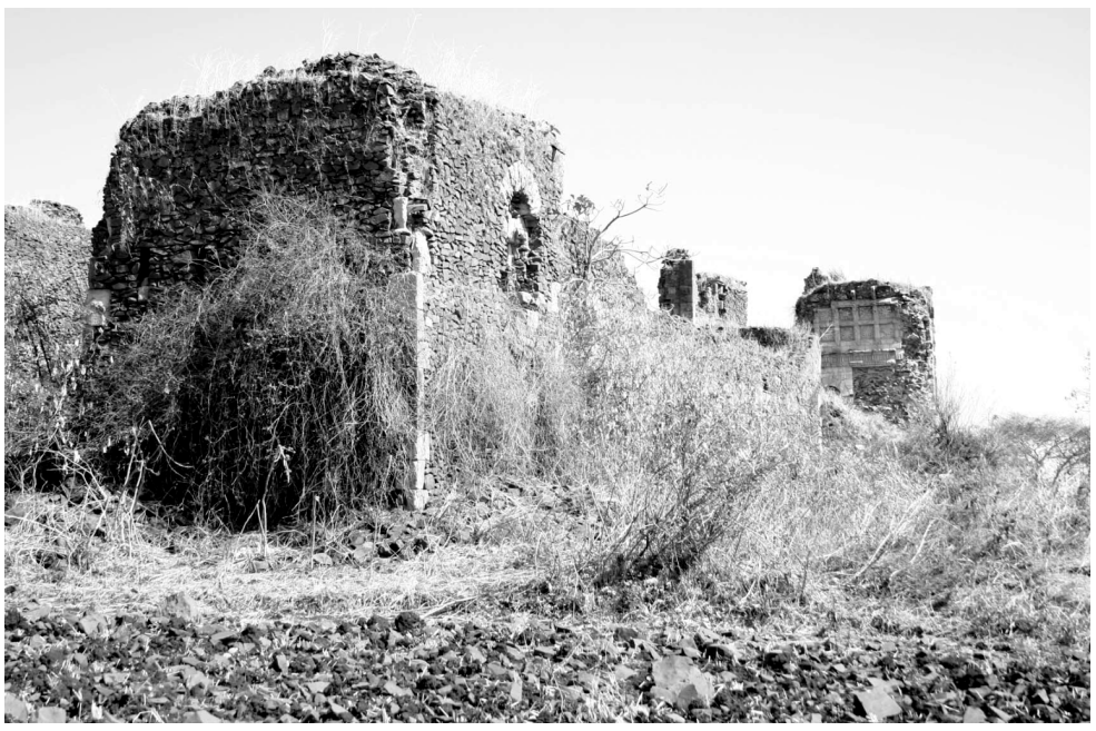
Susinyos castle and Catholic church (southeastern view)