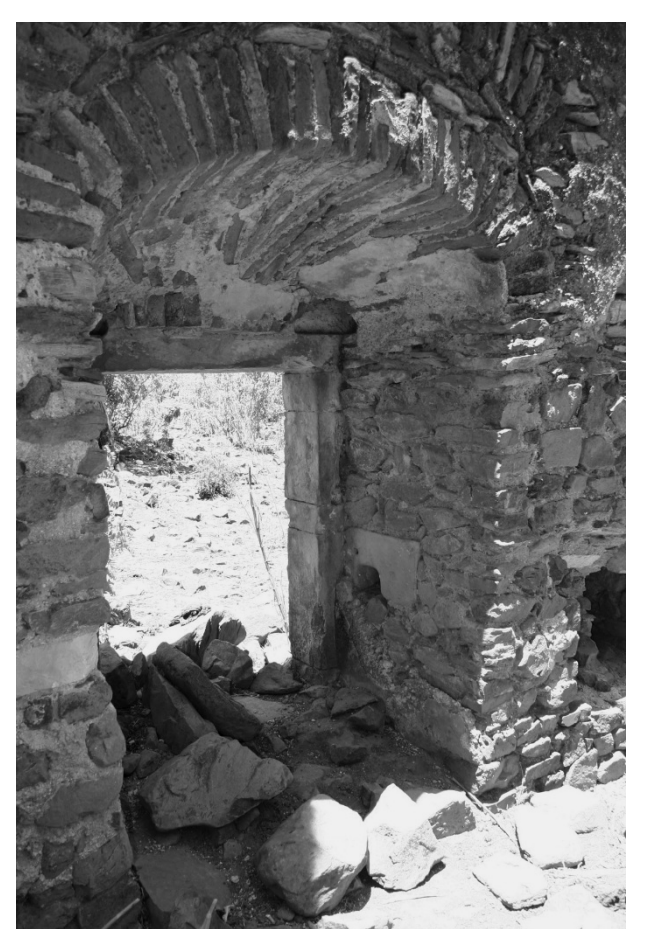
Casa do Patriarca (arched window)