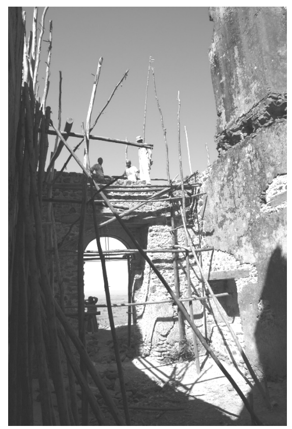
Guzara castle (interior view during the consolidation work)