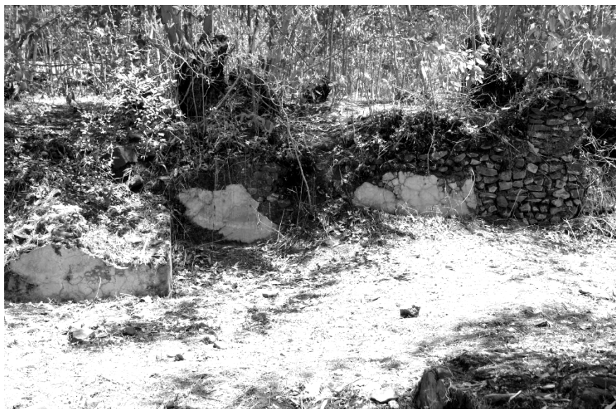
Susinyos bath (foundations of the pavilion)