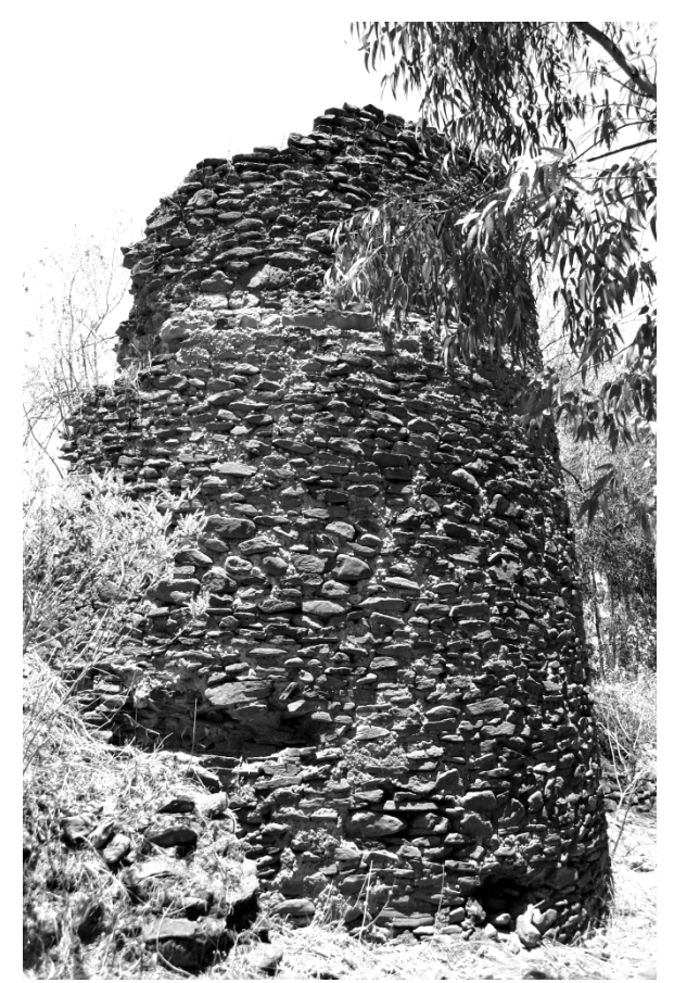
Susinyos castle (southeastern tower)