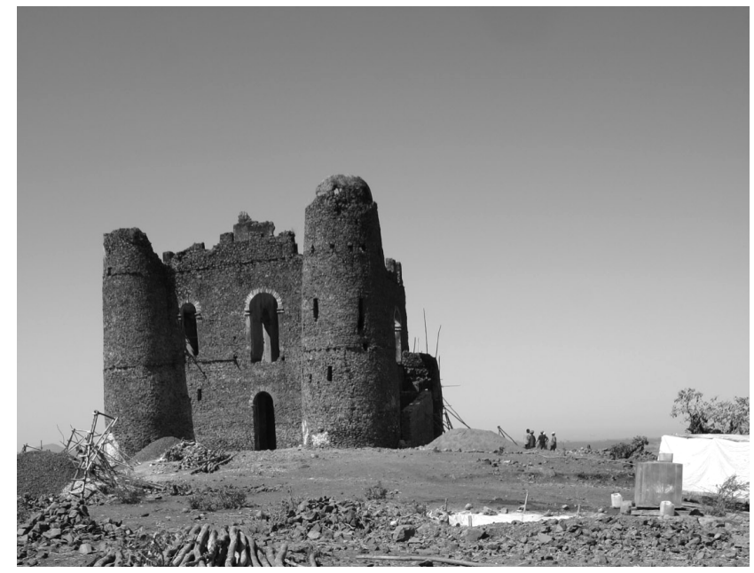
Guzara castle (general view)