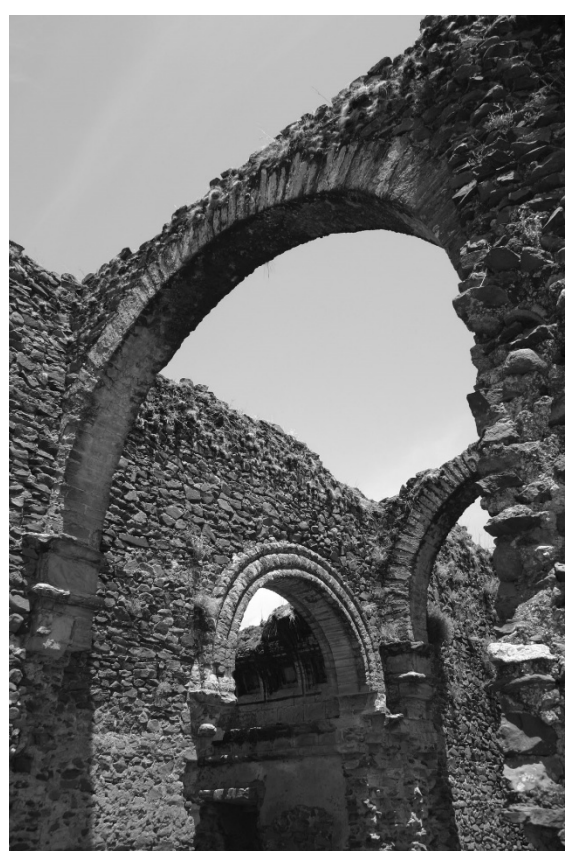
Catholic Cathedral (interior view)