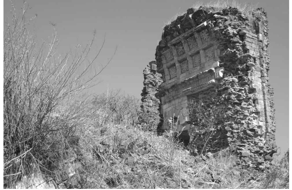
Catholic Church (detail of the apse) © Hervé Pennec 2005