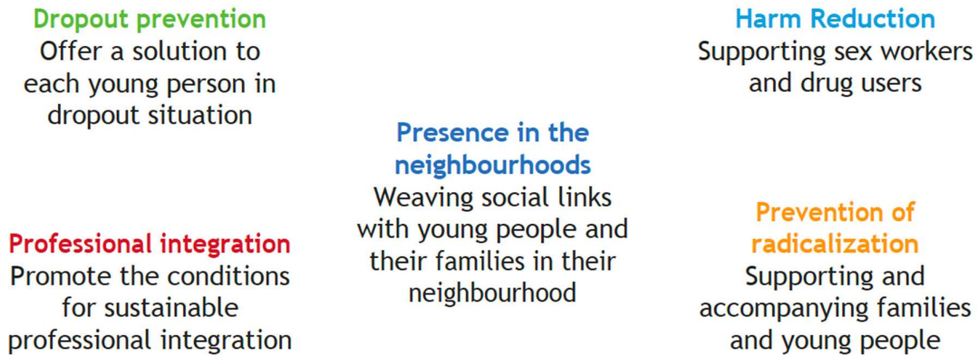
Figure 1: Activities of the Itinéraires association (Itinéraires, 2021)