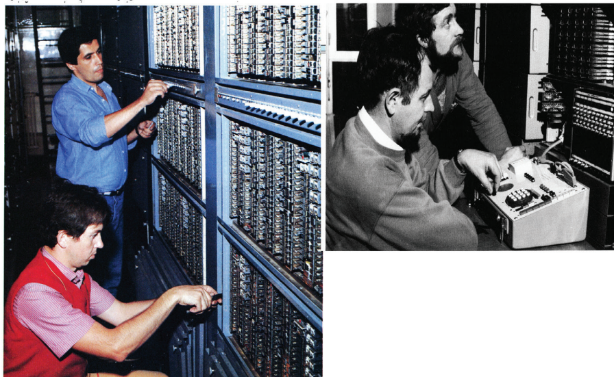
Figure 2. Technicians updating switching equipment.

In electromechanical switching, equipment, telecom technicians « closed » half numbering parts (on the left of the picture) and change the position of the « riders ». At 11pm, it will be enough to « unplug »