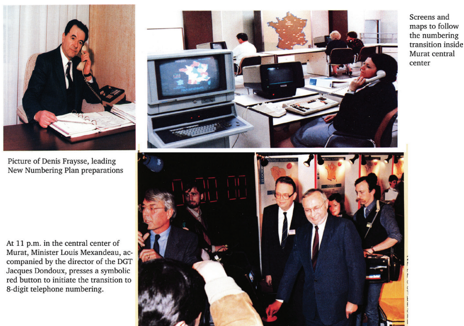
Figure 6. D-day for new telephone numbering.

mandate the production of switches with software specifically designed for the new numbering. By 1991, France Telecom had become an independent public entity. In 1995, the DGT, now no longer overseeing the work of installers, allowed companies to solicit various providers when upgrading their equipment.