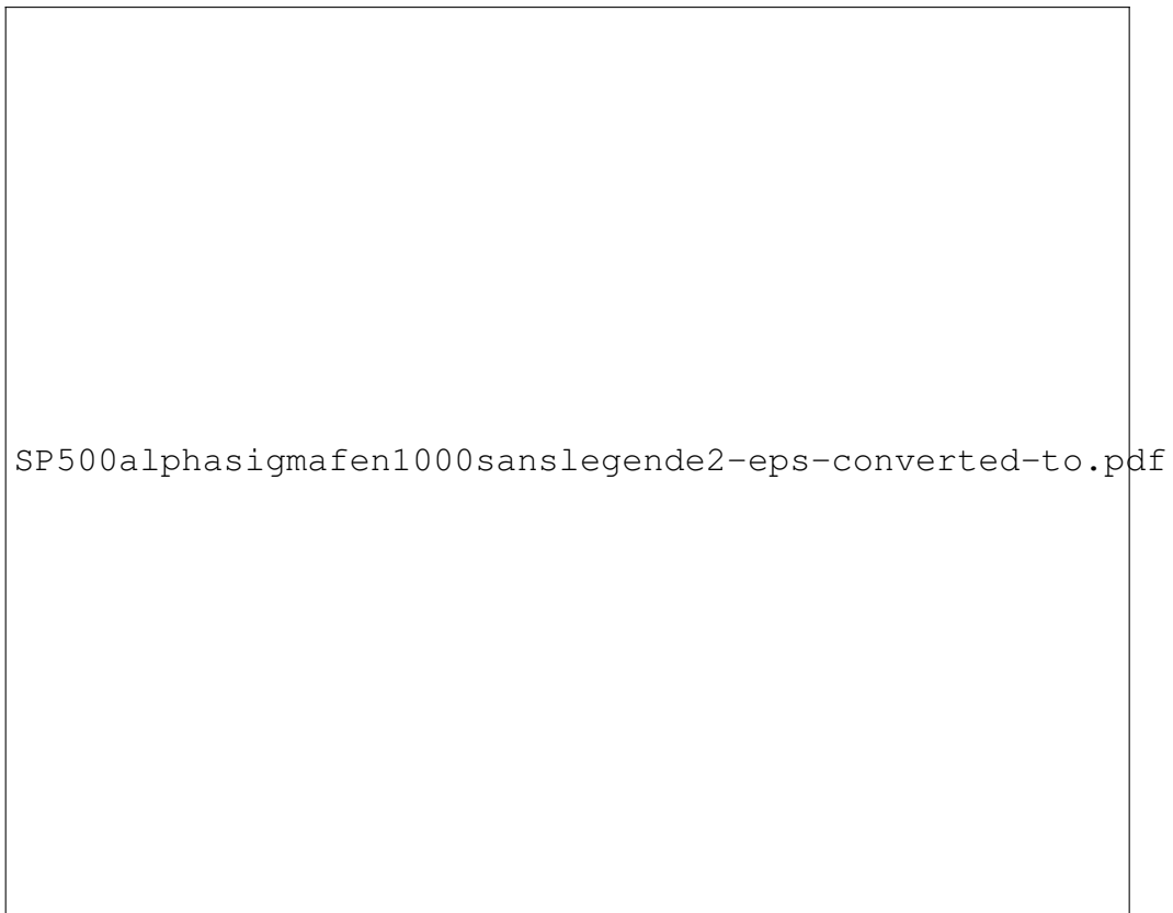
Figure 1: Compared evolutions of the local volatilities (top) and jump intensities (bottom). Estimations performed with the McCulloch (blue) and Koutrouvelis (black) methods on daily data of the S&P 500 between 01/03/1928 and 02/01/2012. Each value is estimated on a centred sliding window of size 2000 data points.

tion convention ? Indeed, these rules concentrate on volatility, aiming at reducing it. This effect is confirmed by our empirical study. However, it could well be that the very mechanism that reduces volatility also leads to a decrease in \alpha , that is, to an increase in jump risk. In such a scenario, we would have an example where regulation risk directly translates into a market risk, without being mediated by a model risk as in the situation considered in the next section. A study of the potential influence of prudential rules on the evolution of the jump intensity and volatility is presented in [30].