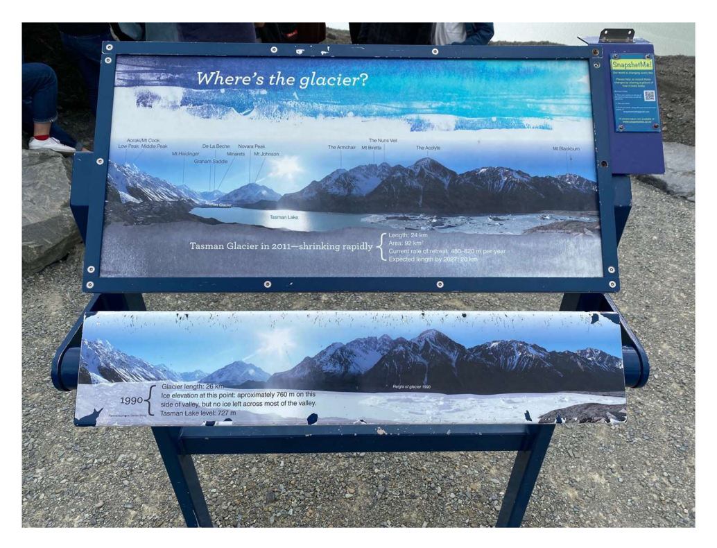
Figure 3. Comparative before-and-after photographs between 1990 and 2011, showing the retreat of the Tasman Glacier (New Zealand).

contemporary photograph of the glacier overlaid with a 'white specter' showing the extent and altitude the glacier was back in 1990.