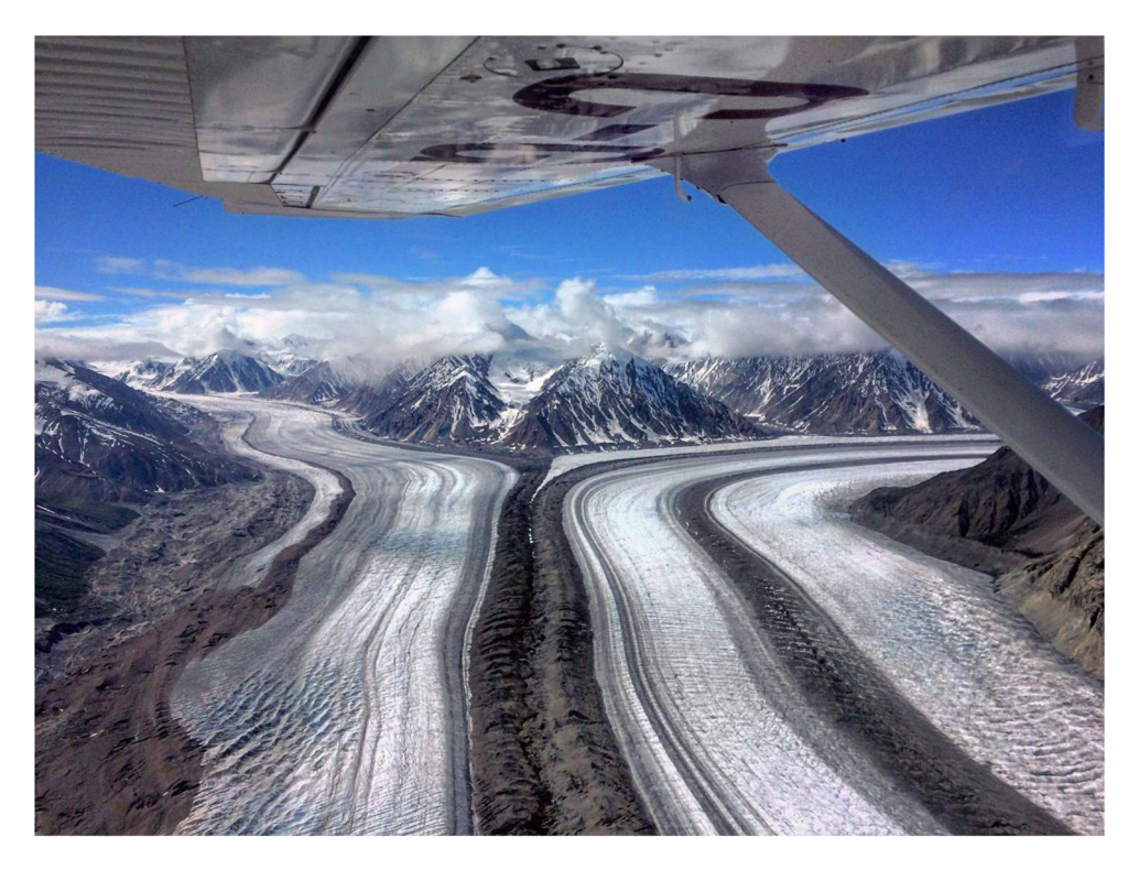
Figure 1. Flightseeing tours are a popular way to visit Kaskawulsh Glacier in Yukon (Canada).

Ravanel, 2023). Studies from Abrahams et al. (2021) and Lemieux et al. (2018) have shown that LCT has become a significant motivation for tourists to engage in glacier tourism, to such an extent that the ongoing vanishing of ice provides a substantial economic opportunity for local communities (Varnajot & Saarinen, 2021, 2022). Investigations in the Alps also have highlighted that LCT is often driven by the desire to understand the impacts of global warming on the environment, particularly at iconic sites that have become symbols of climate change (Salim & Ravanel, 2023), and it is expected that this dynamic creates increasing numbers of glacier ambassadors. Interestingly, this argument provides a form of legitimacy for the tourism industry to keep growing at sites of glaciers, as advocated by Lv et al. (2023).