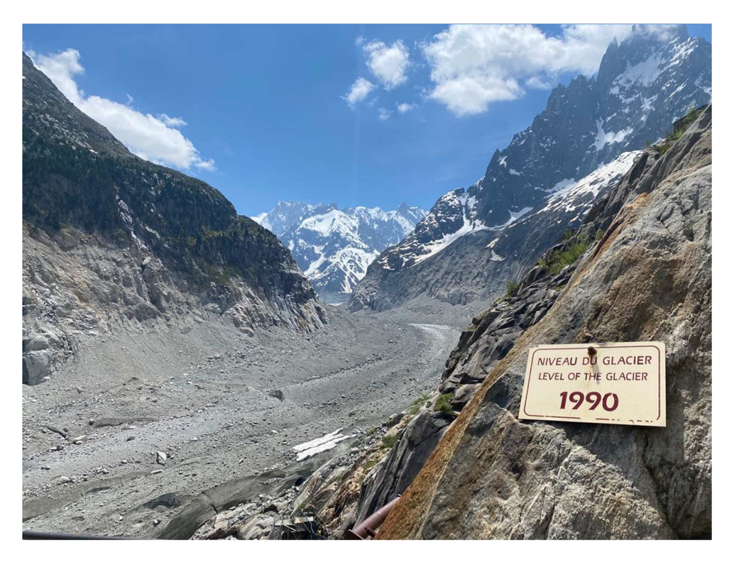
Figure 4. Plague showing the level of the Mer de Glace glacier in 1990.

will be in 10, 50 or 100 years from the time of their visit. Going back in time while walking down to the glacier may provoke what Willox (2012) termed 'anticipatory grieving' for expected losses. This anticipatory grieving is in fact, based on previous experiences of death (Doherty & Clayton, 2011). In this context, haunting emerges from an anticipatory future violence (see Chiovenda & Chiovenda, 2018), that would be 'populated with certain possibilities derived from the past' (Blanco & Pereen, 2013, p. 13). In the context of glacier tourism, experiencing the retreat of glaciers by going back in time with the plaques or even by counting the steps to get access to the ice may act as a trigger for anticipatory grieving. In this case, glaciers are out of both space and time, and haunting unfolds in temporalities where past, present, and future collide. Nevertheless, both the use of before-and-after photographs and the time perspective focus on loss and apocalyptic narratives (Garrard & Carey, 2017). According to several authors such as Garrard & Carey (2017), Varnajot & Saarinen (2022) or Jackson (2015) these narratives showcasing a doomed, dystopian, and unescapable future are reductionist and deterministic. These narratives oversimplify historical processes and may overlook local communities' perspectives on the issues associated with glacier retreat at stake.