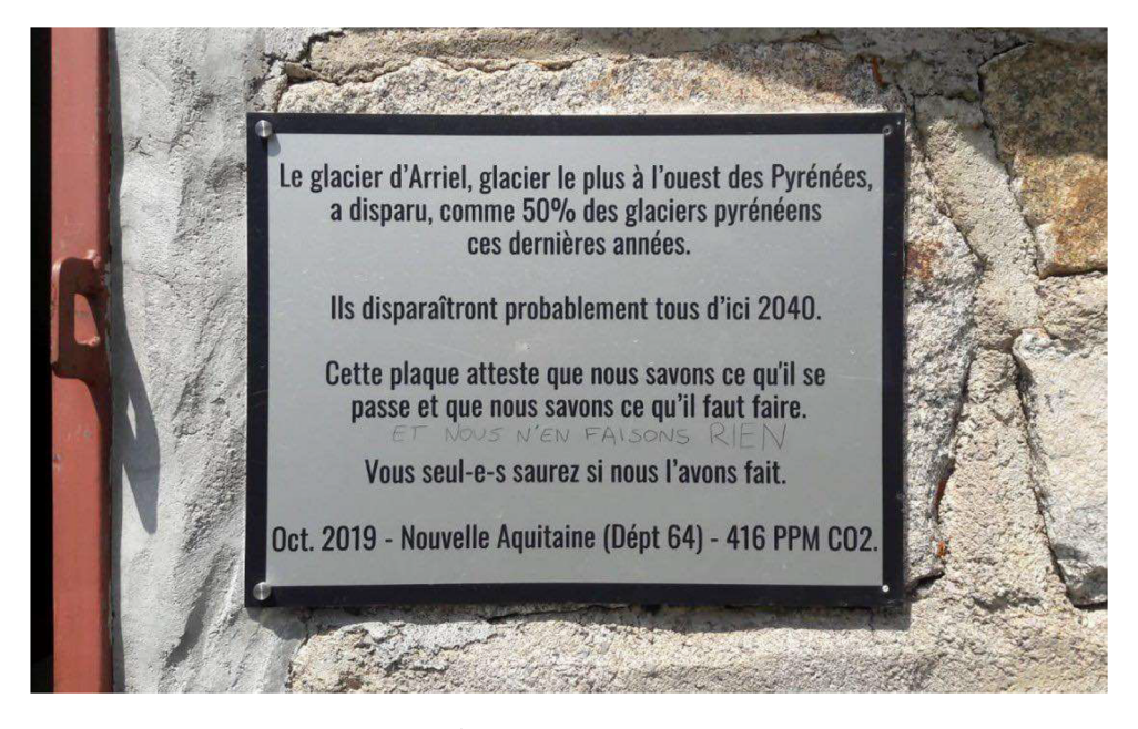
Figure 2. The commemorative plaque for vanished Arriel glacier, in the Pyrenees. "The Arriel glacier, the westernmost Pyrenean glacier is gone, just like 50% of Pyrenean glaciers these past few years. They will probably all disappear by 2040. This plaque acknowledges that we know what is happening and what needs to be done. Only you know if we did it".